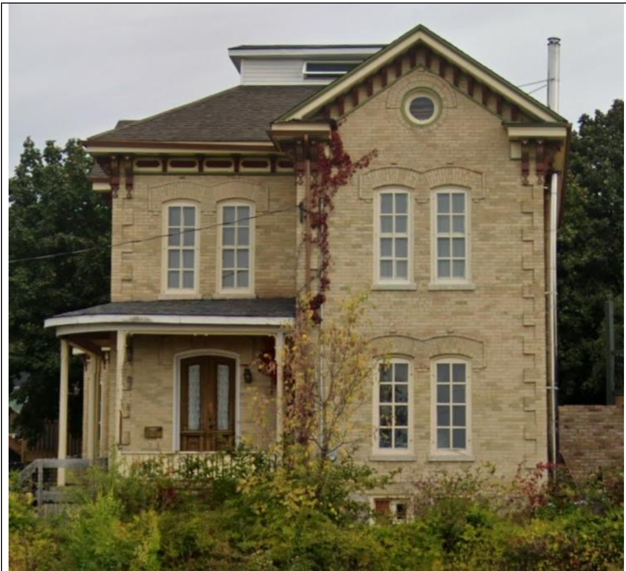
Side Elevation (South Façade) (originally the front elevation off of King Street East)