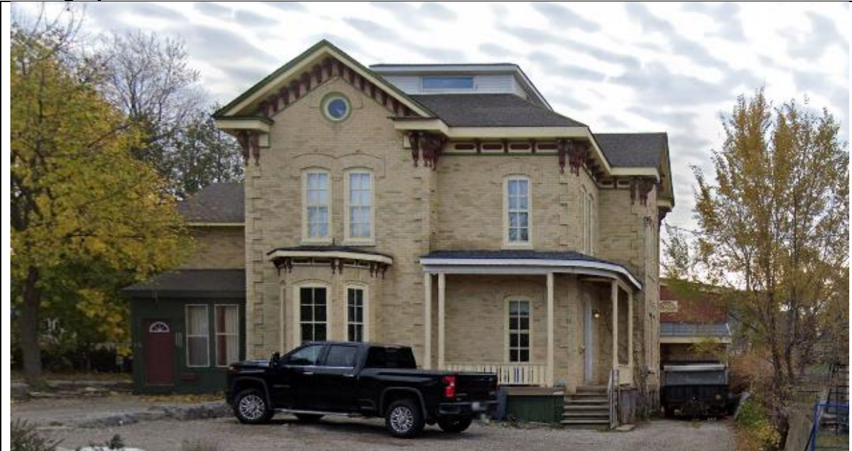
Front Elevation (West Façade) (originally a side elevation)