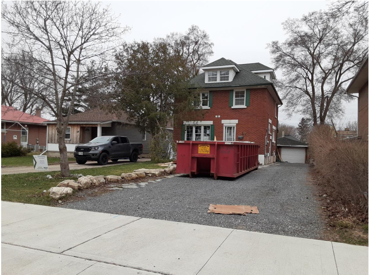
Figure 2 - View of property from street

In considering the four tests for the minor variances as outlined in Section 45(1) of the Planning Act, R.S.O, 1990 Chap. P 13, as amended, Planning staff offers the following comments: