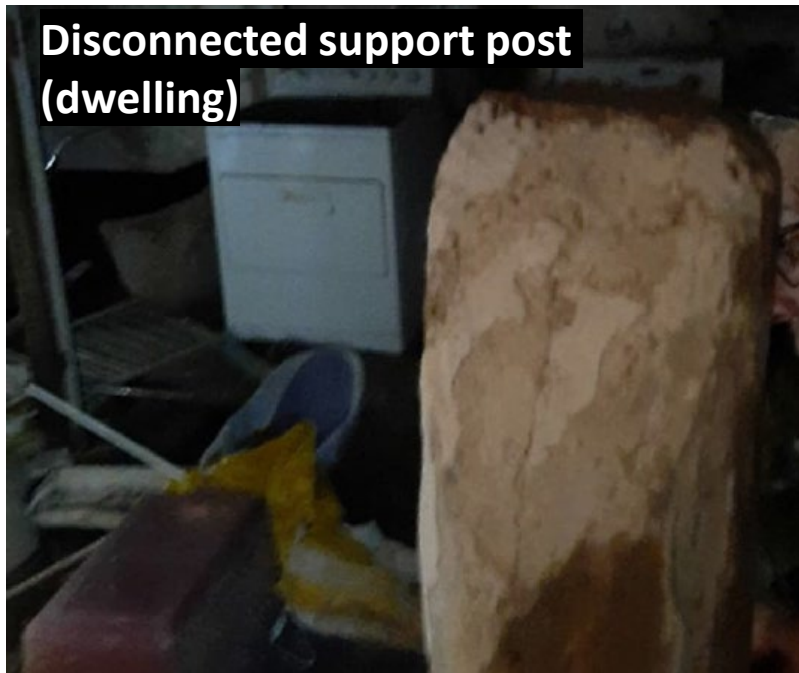
Disconnected support post (dwelling)