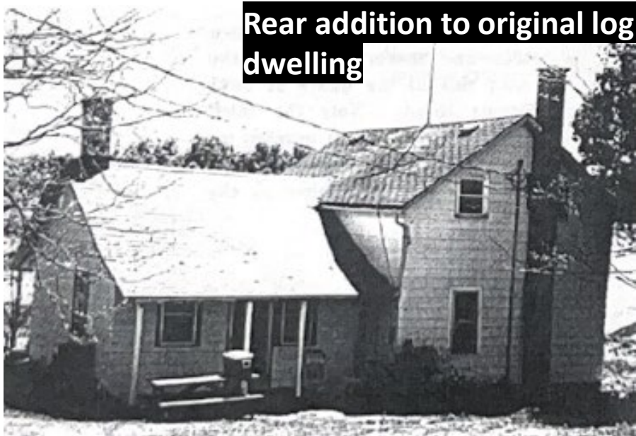
Rear addition to original log dwelling