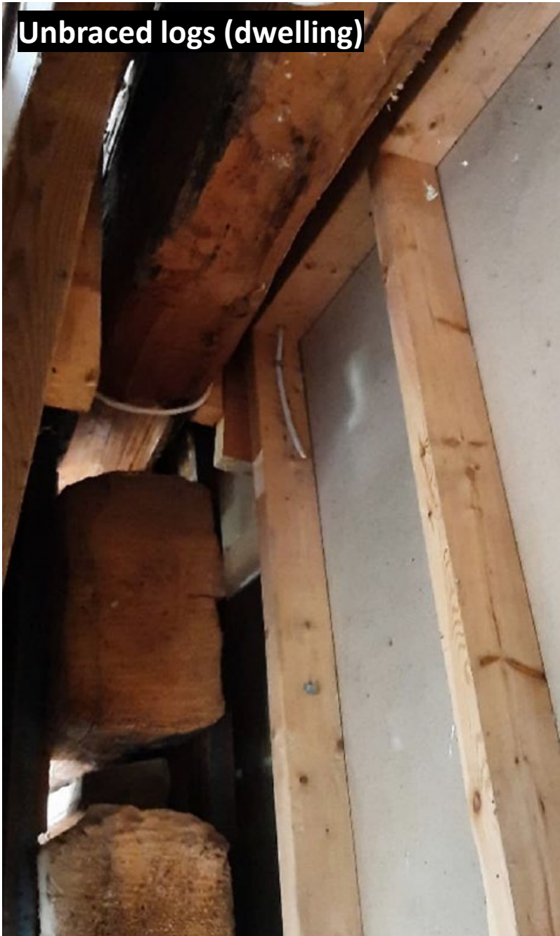
Unbraced logs (dwelling)