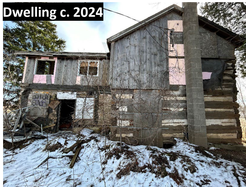
Dwelling c. 2024