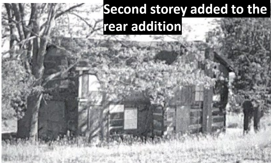
Second storey added to the rear addition