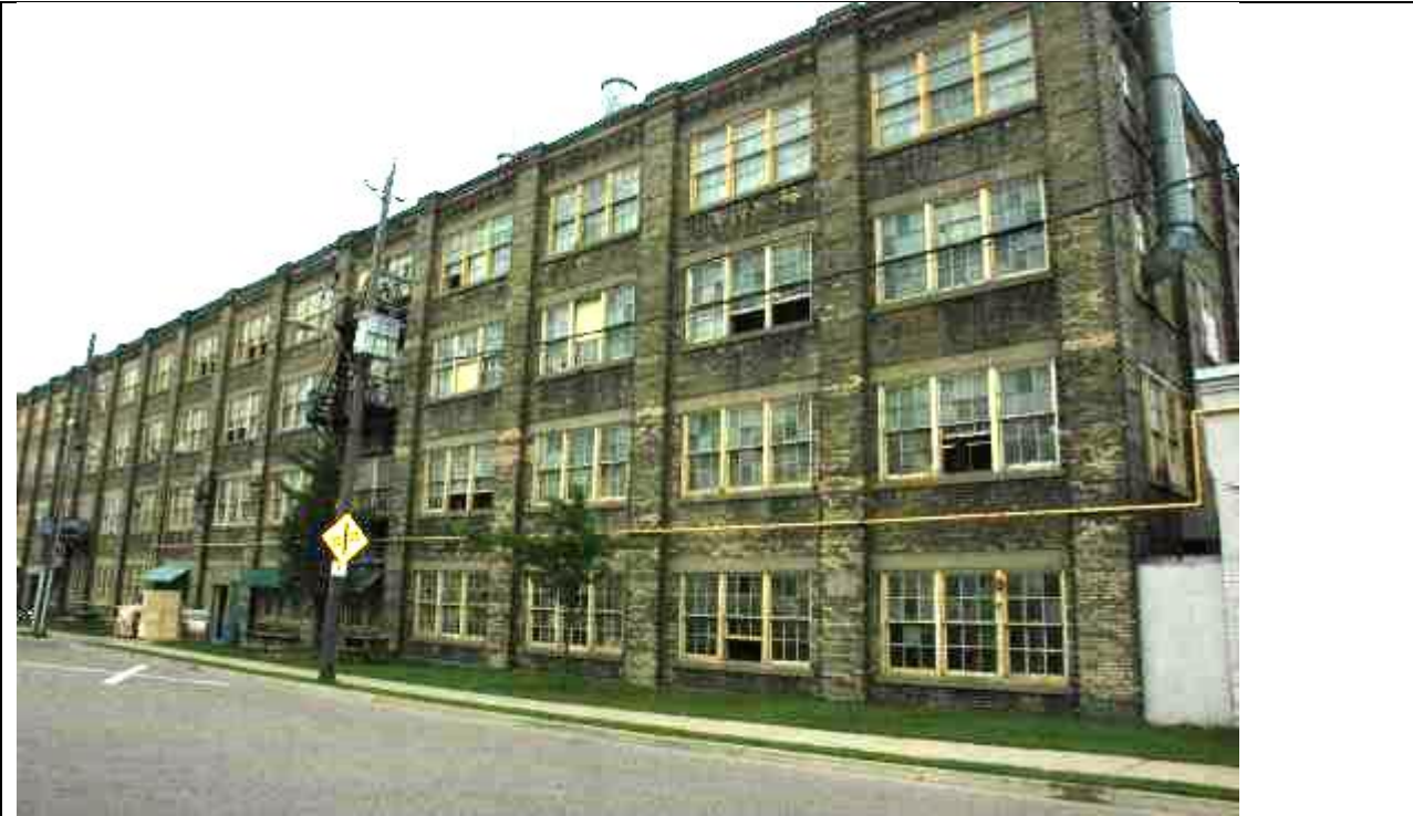
111 Ahrens Street West – south elevation