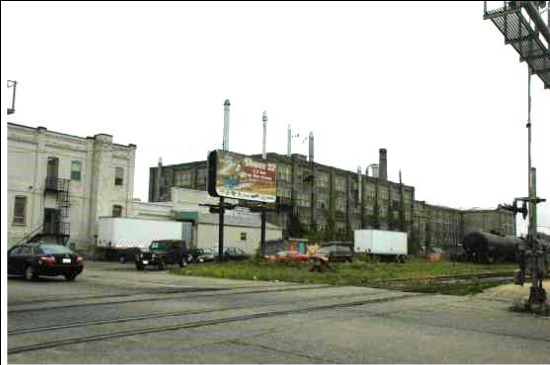
111 Ahrens Street West – South Elevation