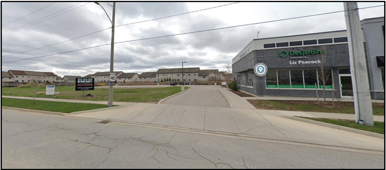
Figure 5: The existing road access to the commercial plaza

Staff visited the subject property on March 2 nd , 2024.