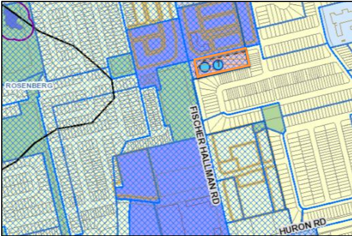
Figure 2: The subject property in the zoning map.

The subject property is identified as 'Urban Corridor' on Map 2 – Urban Structure and is designated as "Mixed Use One" in the Rosenberg Secondary Plan