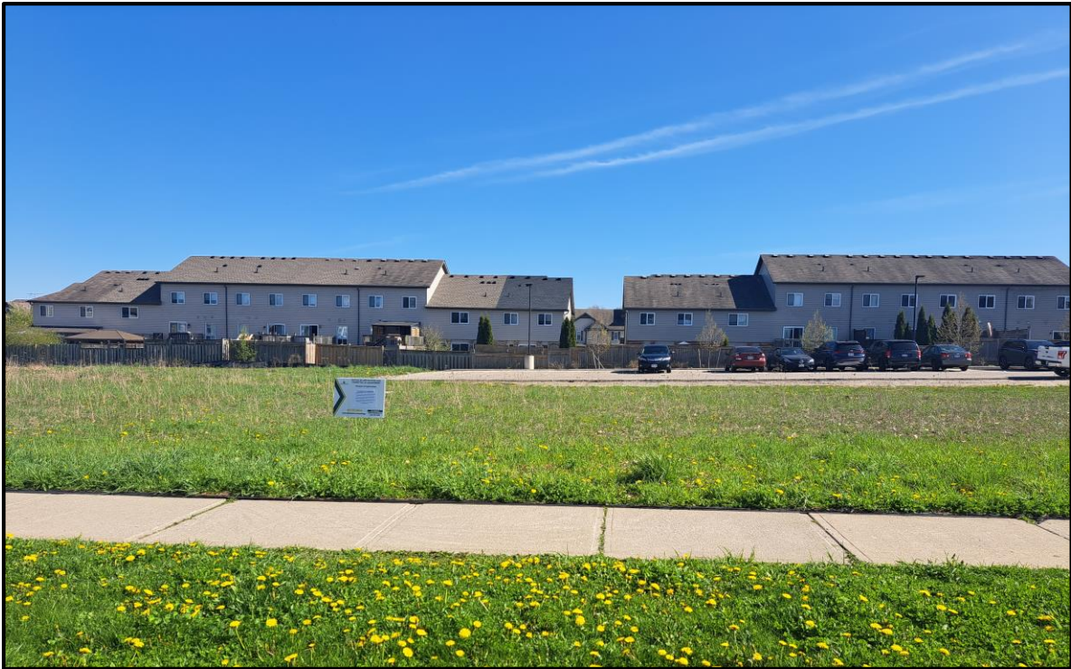
Figure 6: The subject property from Seabrook Drive where the proposed building will be located

Staff visited the subject property on March 2 nd , 2024.