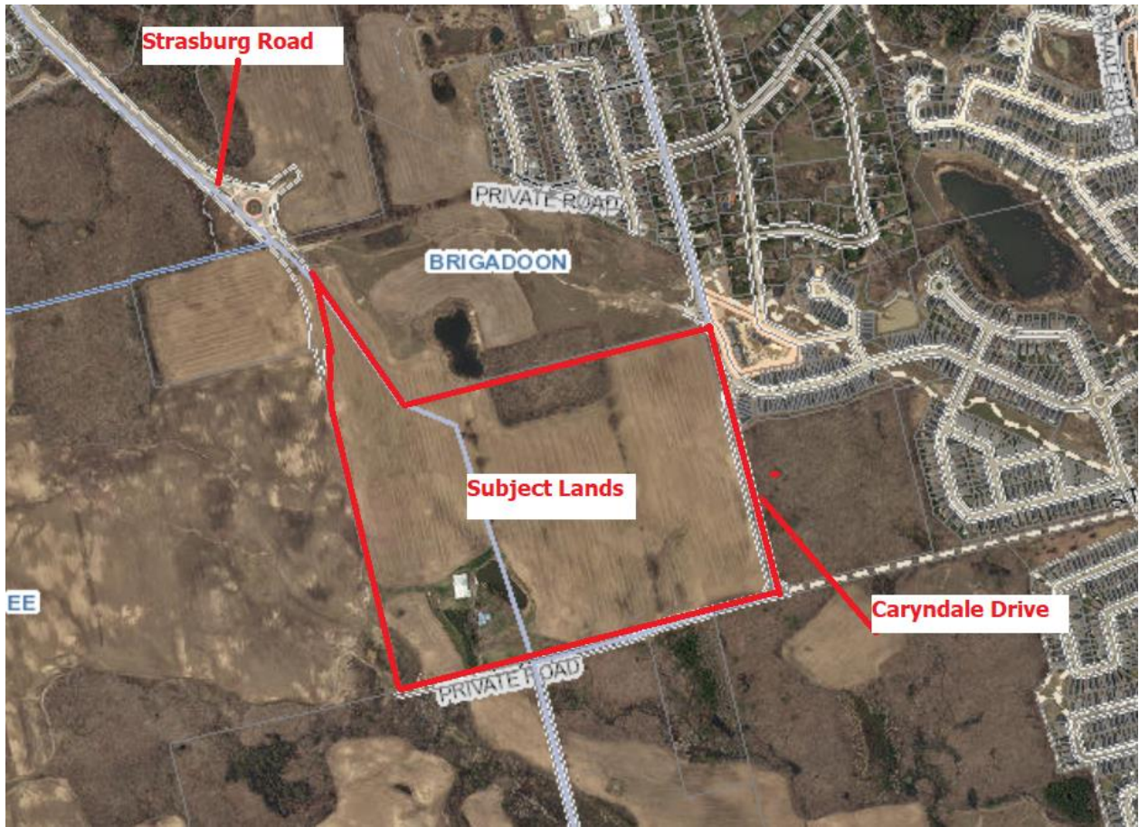
Figure 1: Location map- 500 Stauffer Drive