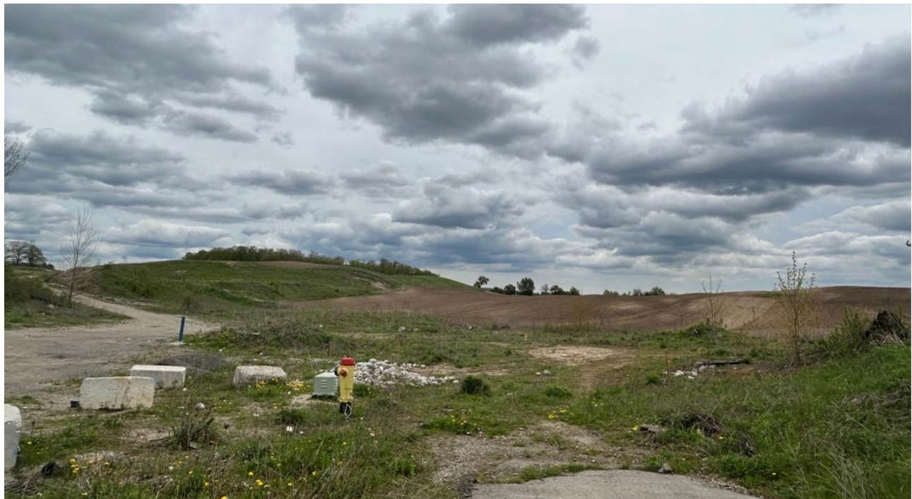
Figure 2: Existing site conditions at 500 Stauffer Drive