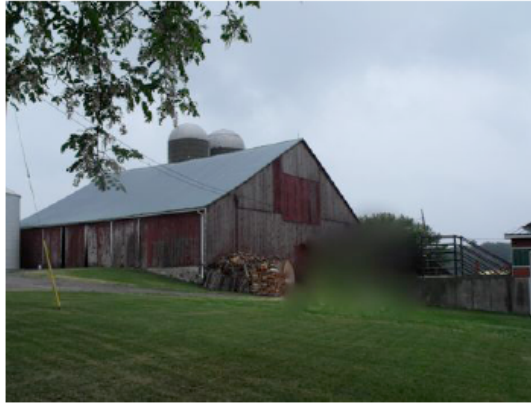
Figure 43: The barn at 236 Gehl Place

The house has value as an enduring pioneer dwelling that has undergone relatively few changes to its physical structure. The original log house still exists under layers of later cladding: it was covered in stucco, then insul-brick, and then, in 1966, aluminum siding which was added after the insul-brick was removed. Additions have been added to the west and north, but the original fenestration pattern remains on the south façade and on the east and west sides. In the Georgian tradition, the windows are all placed symmetrically, but the front door is off-centre in order to allow entry directly into the main living area. Inside, much of the original floor plan remains, and the walls have a plaster finish as did the original log house. A verandah that once stretched along all of the south façade has been replaced by a one bay porch (Ryan 1991). The front shed-roofed dormer is a later addition.