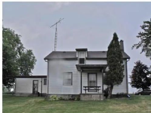
Figure 42: The house at 236 Gehl Place, 2010