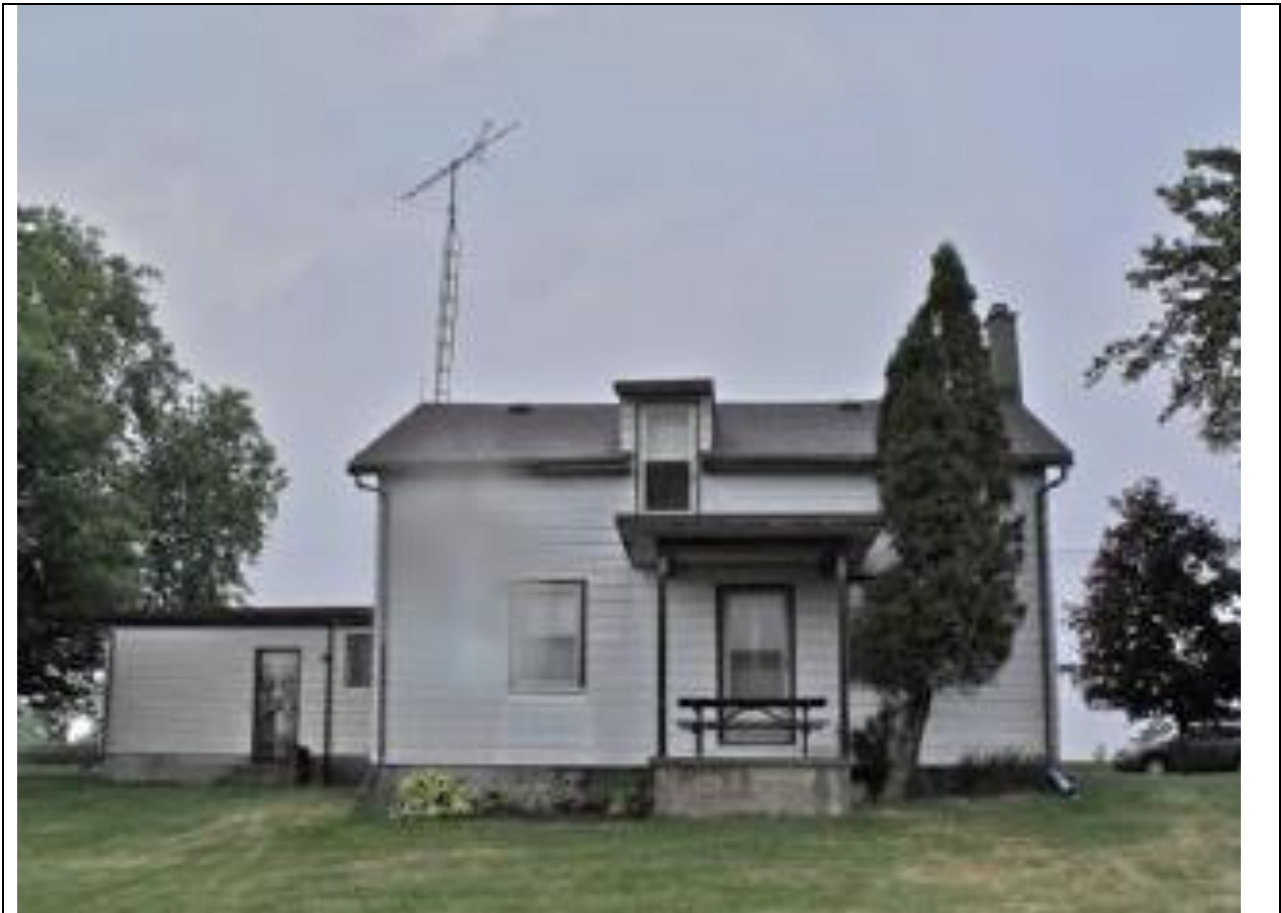
236 Gehl Place