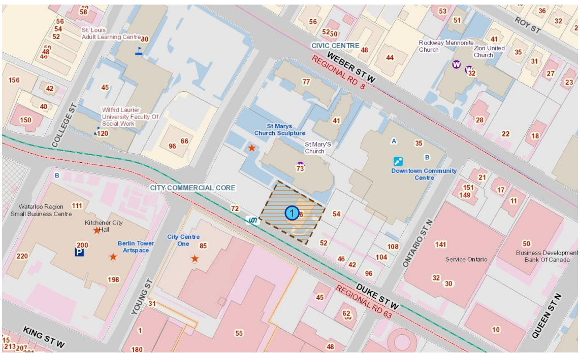
Figure 1. Location Map - 56 Duke Street West

56 Duke Street West is a two-storey early 20<sup>th</sup> century building constructed in the Gothic architectural style. The building is situated on a 0.34 acre parcel of land located on the north side of Duke Street between Young Street and Ontario Street in the City Commercial Core Planning Community of the City of Kitchener within the Region of Waterloo (Figure 1). The principal resource that contributes to the heritage value is the presbytery.