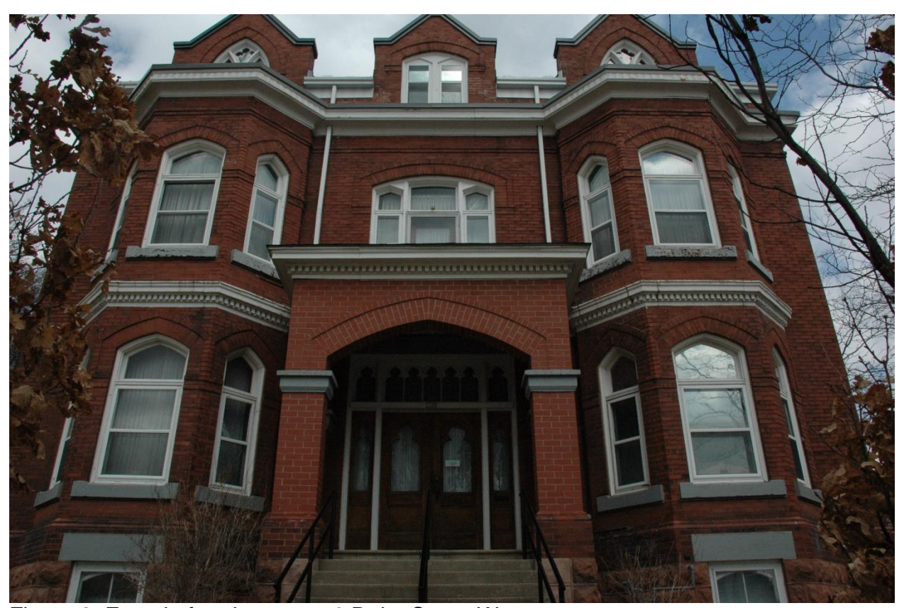
Figure 2. Façade fronting onto 56 Duke Street West.

Identifying and protecting cultural heritage resources within the City of Kitchener is an important part of planning for the future, and helping to guide change while conserving the buildings, structures, and landscapes that give the City of Kitchener its unique identity. The City plays a critical role in the conservation of cultural heritage resources. The designation of property under the Ontario Heritage Act is the main tool to provide long-term protection of cultural heritage resources for future generations. Designation recognizes the importance of a property to the local community; protects the property's cultural heritage value; encourages good stewardship and conservation; and promotes knowledge and understanding about the property. Designation not only publicly recognizes and promotes awareness, but it also provides a process for ensuring that changes to a property are appropriately managed and that these changes respect the property's cultural heritage value and interest.