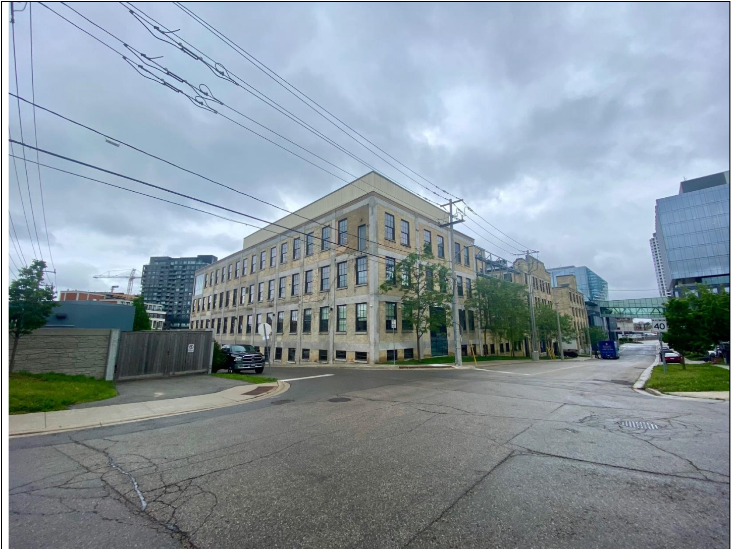
51 Breithaupt Street – front and side elevation