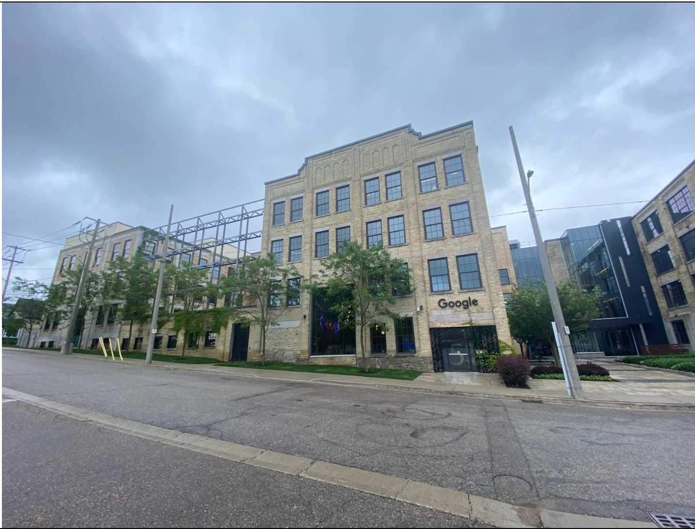
51 Breithaupt Street – front elevation