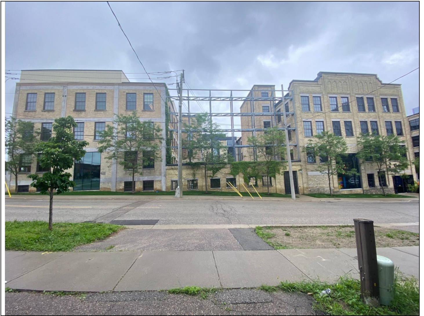
51 Breithaupt Street – front elevation