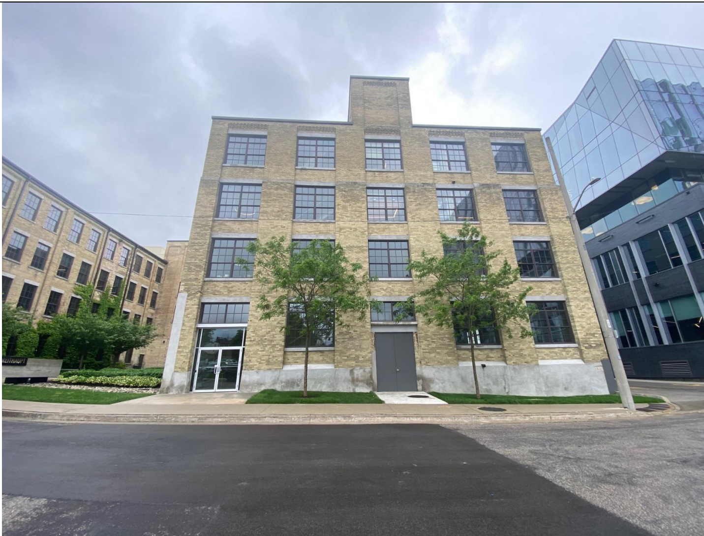
51 Breithaupt Street – front elevation