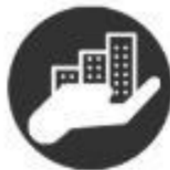
City-Wide Rental Replacement Policies