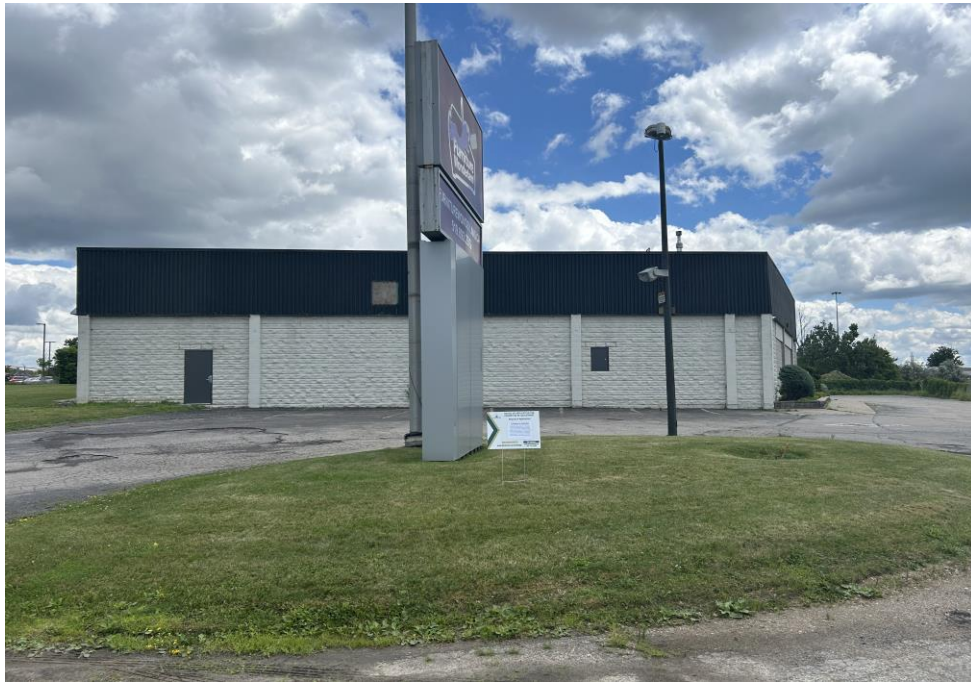
Figure 2: View of Existing Site Conditions