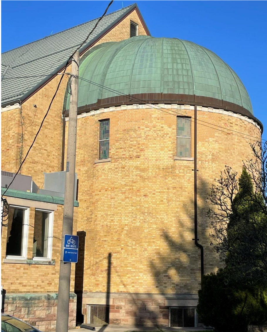
Rear Elevation (North Façade) – 148 Madison Avenue South