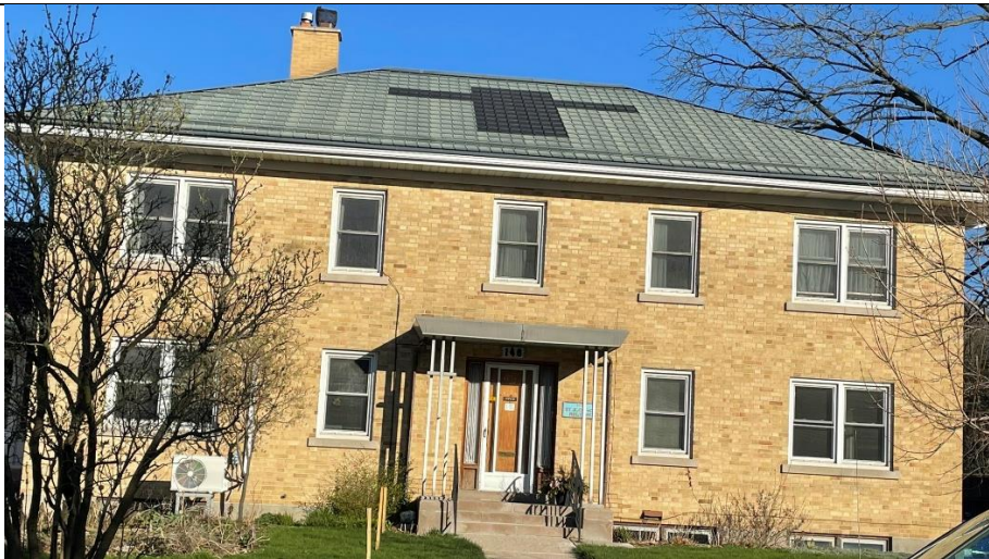
Side Elevation (East Façade) – 148 Madison Avenue South