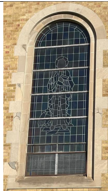
Side Elevation Window Detail (East Façade) – 148 Madison Avenue South