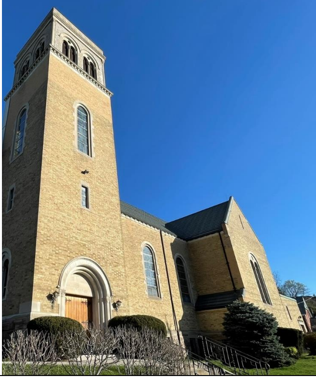
Side Elevation (East Façade) – 148 Madison Avenue South