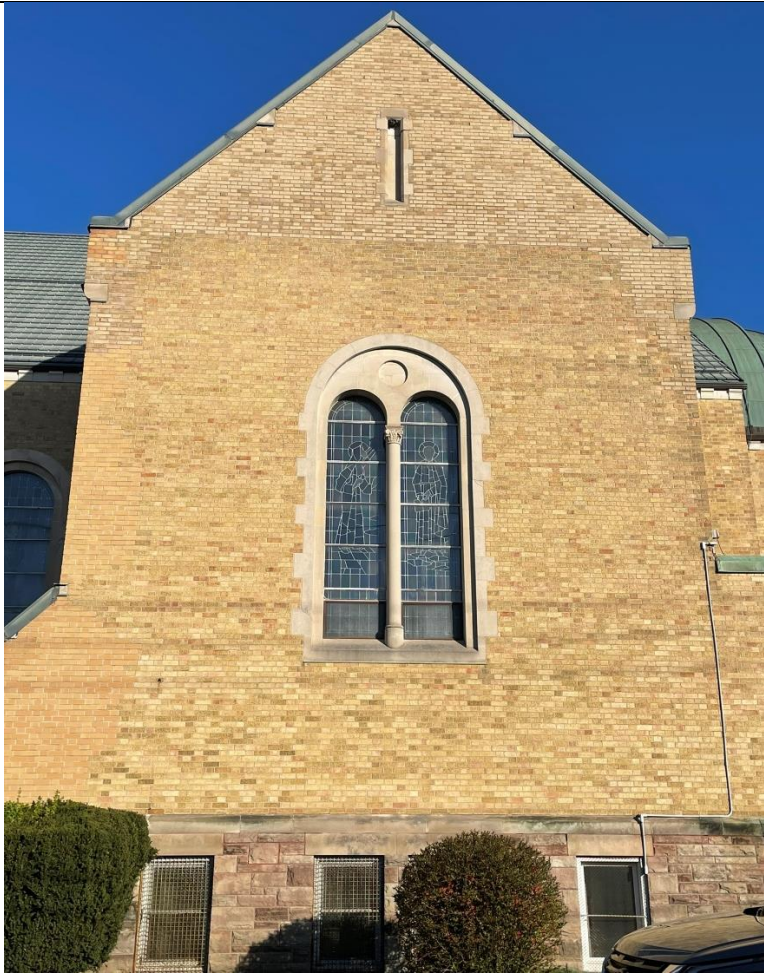
Side Elevation (East Façade) – 148 Madison Avenue South