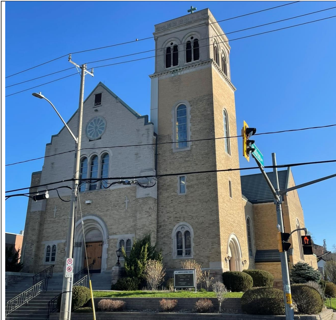
Front Elevation (South Façade) & Side Elevation (East Façade) – 148 Madison Avenue South