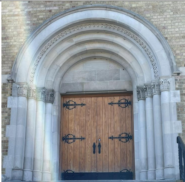
Front Elevation Entrance (South Façade)