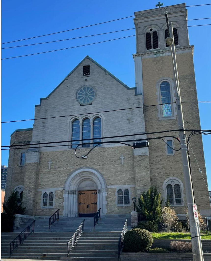
Front Elevation (South Façade) – 148 Madison Avenue South