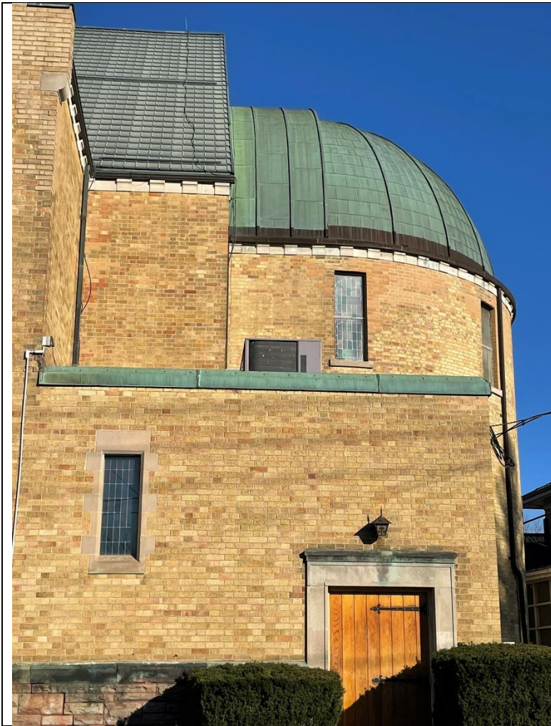
Side Elevation (East Façade) – 148 Madison Avenue South