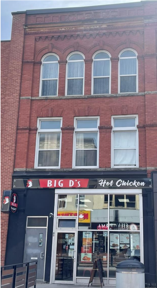
Figure 2.0: Front (North Façade) Elevation

Per standard procedure, should Council support the Notice of Intention to Designate (NOID), the property owner will be contacted a third time through a letter advising of the City’s NOID. An ad for the NOID will be published in a newspaper. Once the letter is served on the property owner and the Ontario Heritage Trust, and the newspaper ad is posted, there will be a 30-day appeal period in which the property owner may object to the designation.