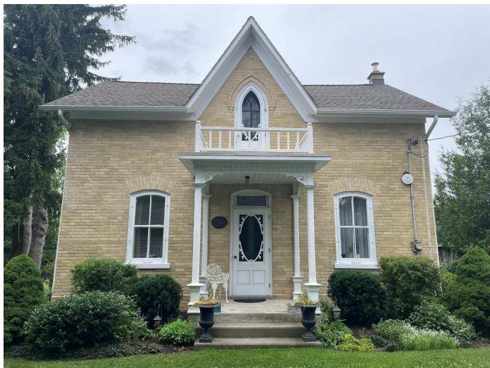
Front Elevation (West Façade) – 1738 Trussler Road