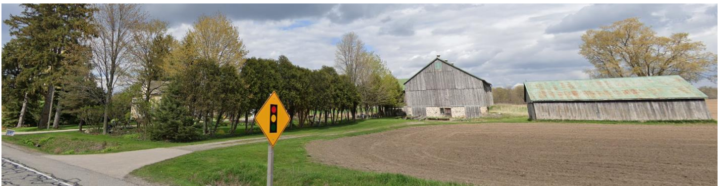
View of Farmhouse (1738 Trussler Road) & Barn and Driveshed (Huron Road)