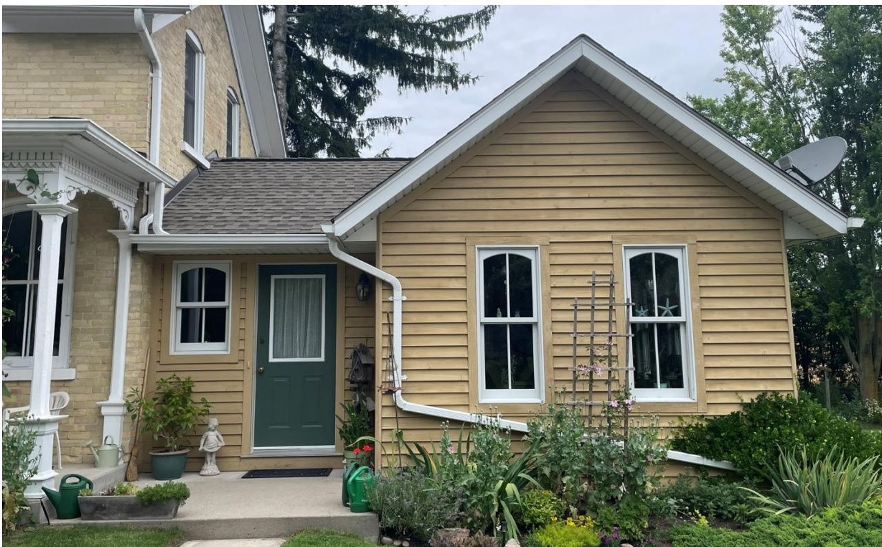
Side Elevation (South Elevation) – 1738 Trussler Road