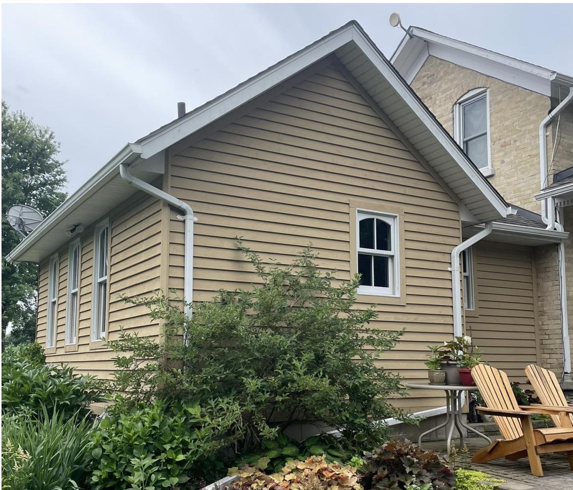
Side Elevation (North Façade) – 1738 Trussler Road