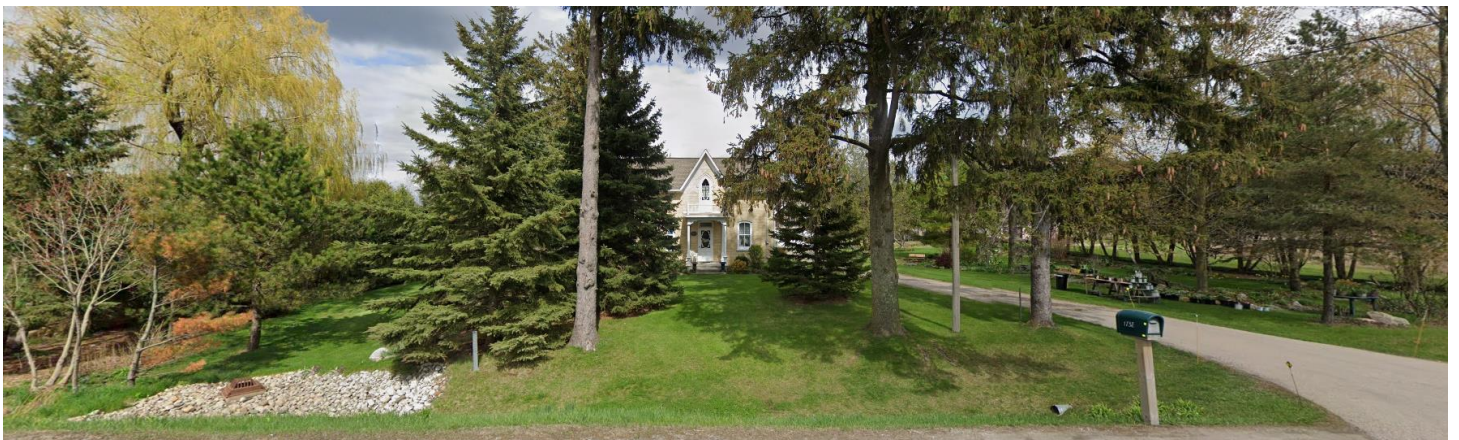
Wide Angle View of the Frontage of the Property, including the Front Elevation (West Façade) of the Farmhouse – 1738 Trussler Road