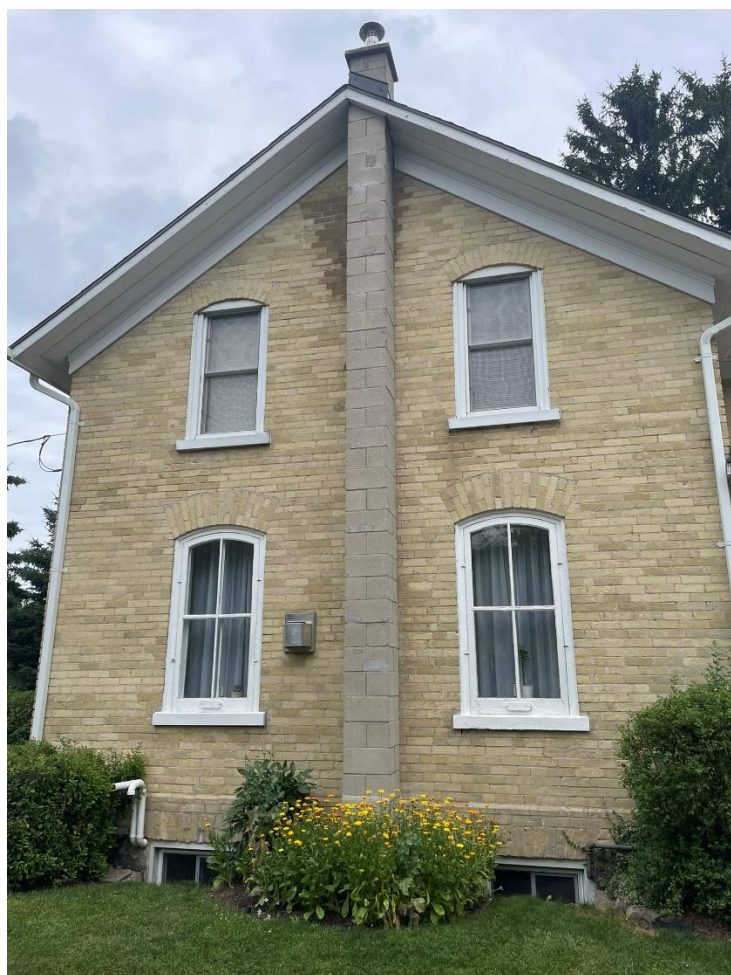
Side Elevation (South Elevation) – 1738 Trussler Road