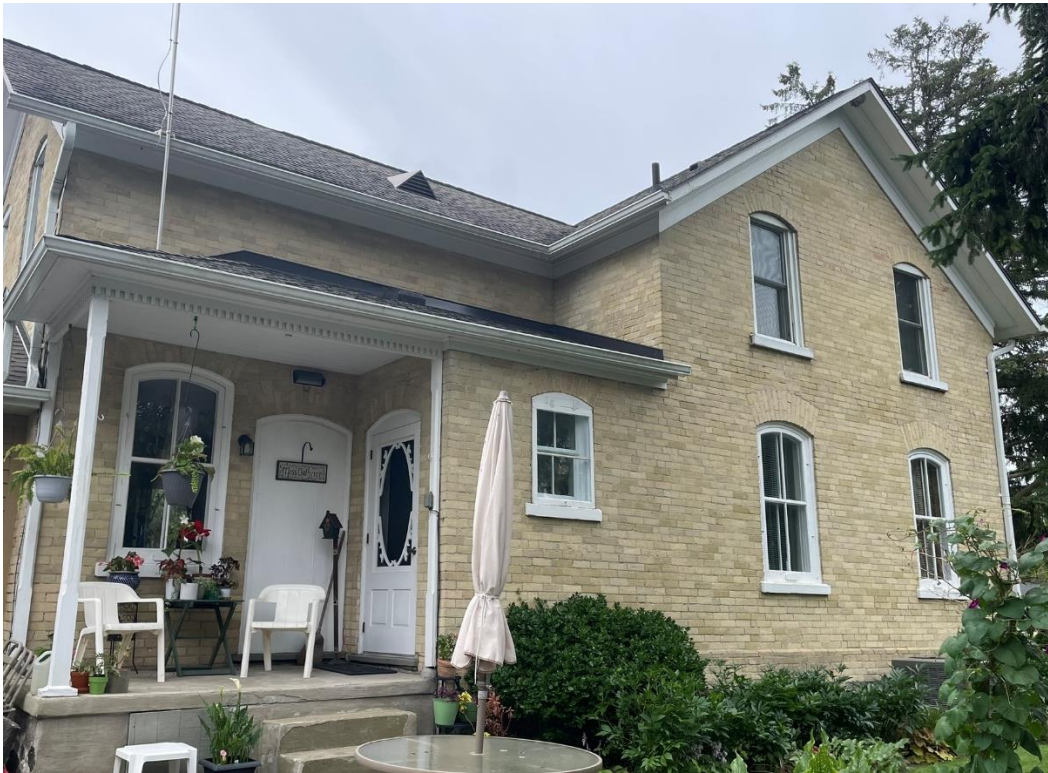
Side Elevation (North Façade) – 1738 Trussler Road