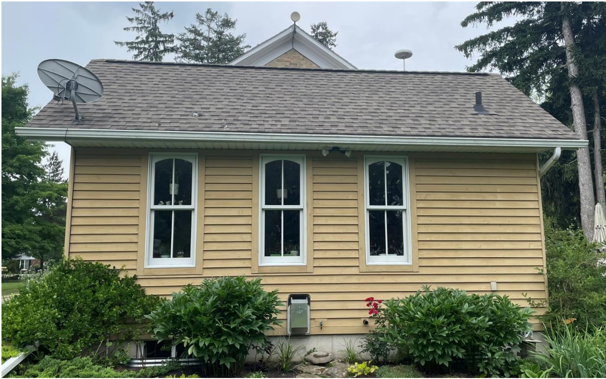
Rear Elevation (East Façade) – 1738 Trussler Road