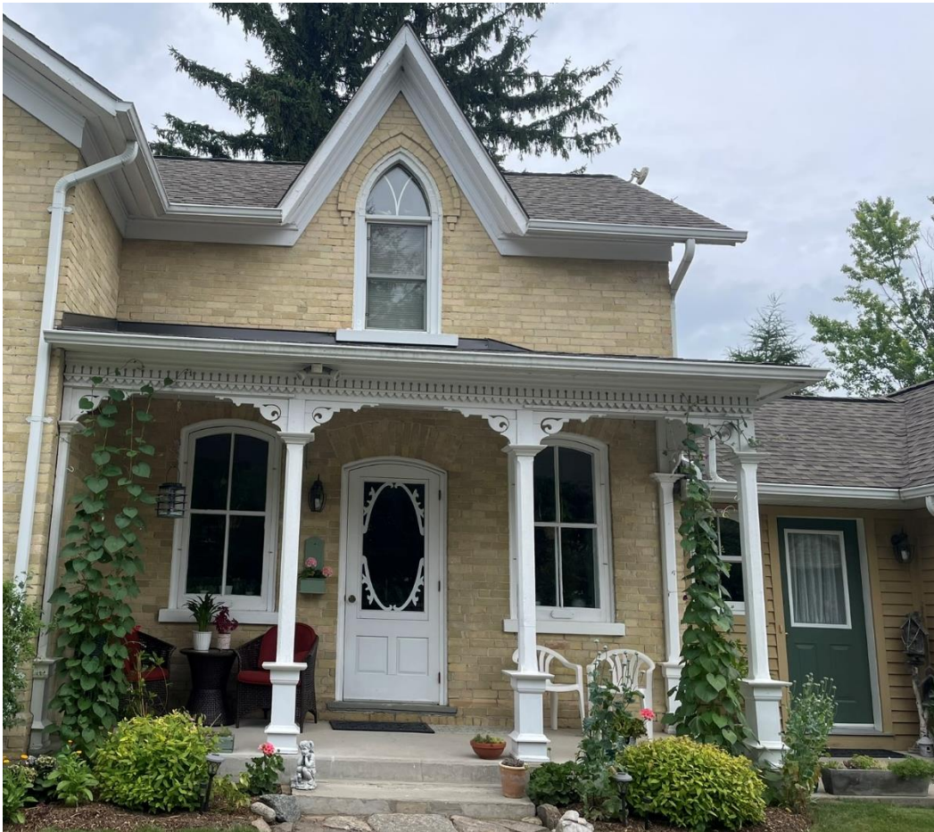
Side Elevation (South Elevation) – 1738 Trussler Road