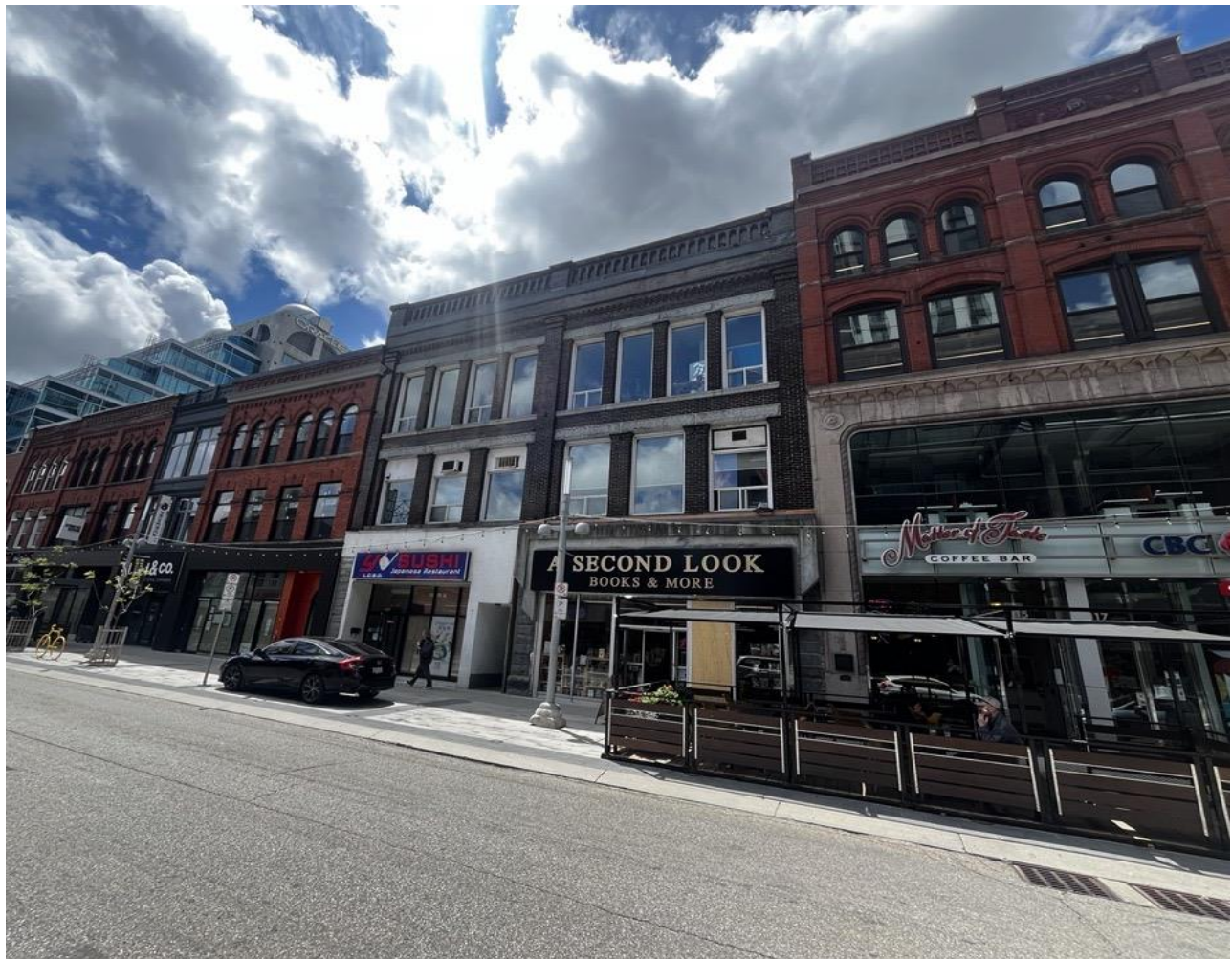
Figure 2: Front Façade of Subject Property

103-109 King Street West fronts onto King Street West. It's façade is divided vertically into two sections by three piers, three storeys in height which create two bays. The first floor of the building contains storefronts and its appearance has been modernized. The second storey contains a row of six windows, three in each bay. The windows do not appear to be original and the window openings on the eastern-most bay have been reduced in size. Below the windows are stone sills, and above and dividing the second storey from the third is a continuous stone lintel. The third storey contains a row of eight windows, four in each bay and all of a size. The windows do not appear to be original. These windows are also framed by stone lintels and sills. The roofline possesses a brick parapet with decorative brickwork.