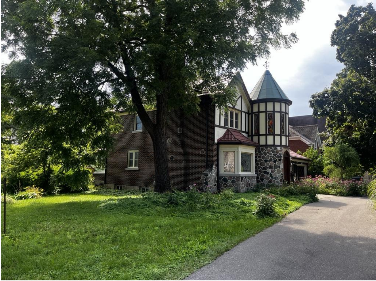
North Side Elevation