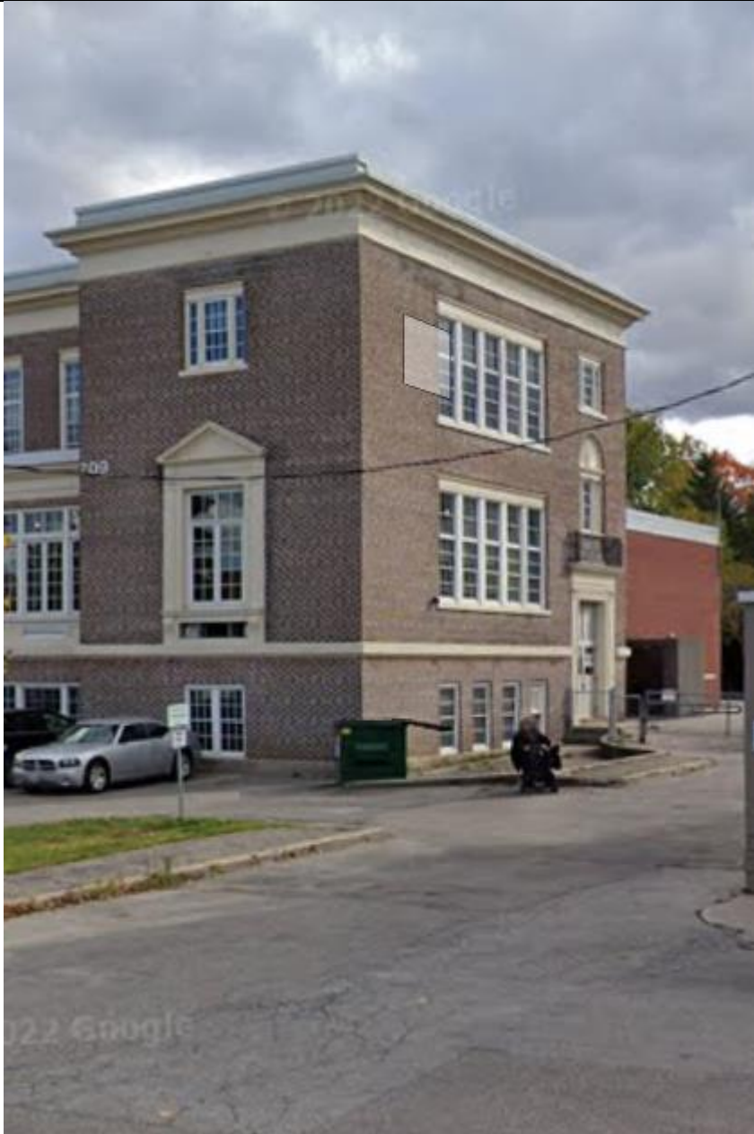
Side Elevation (Interior)