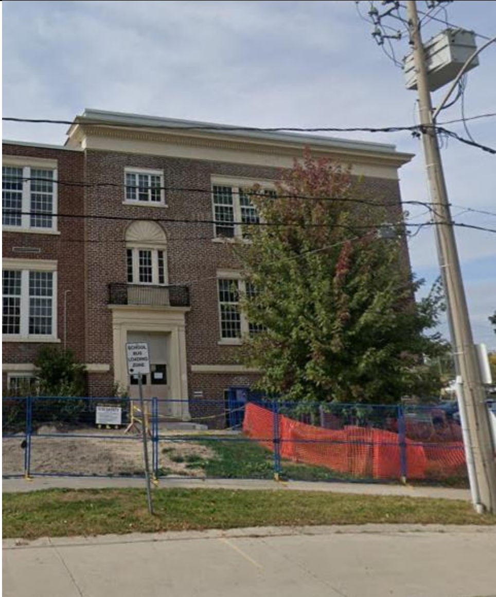
Side Elevation (Ange's Street)