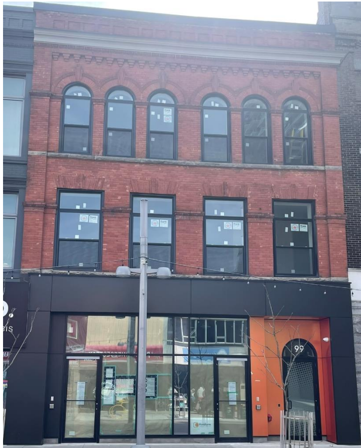
Figure 2.0: Front (North Façade) Elevation

Per standard procedure, should Council support the Notice of Intention to Designate (NOID), the property owner will be contacted a third time through a letter advising of the City’s NOID. An ad for the NOID will be published in a newspaper. Once the letter is served on the property owner and the Ontario Heritage Trust, and the newspaper ad is posted, there will be a 30-day appeal period in which the property owner may object to the designation.