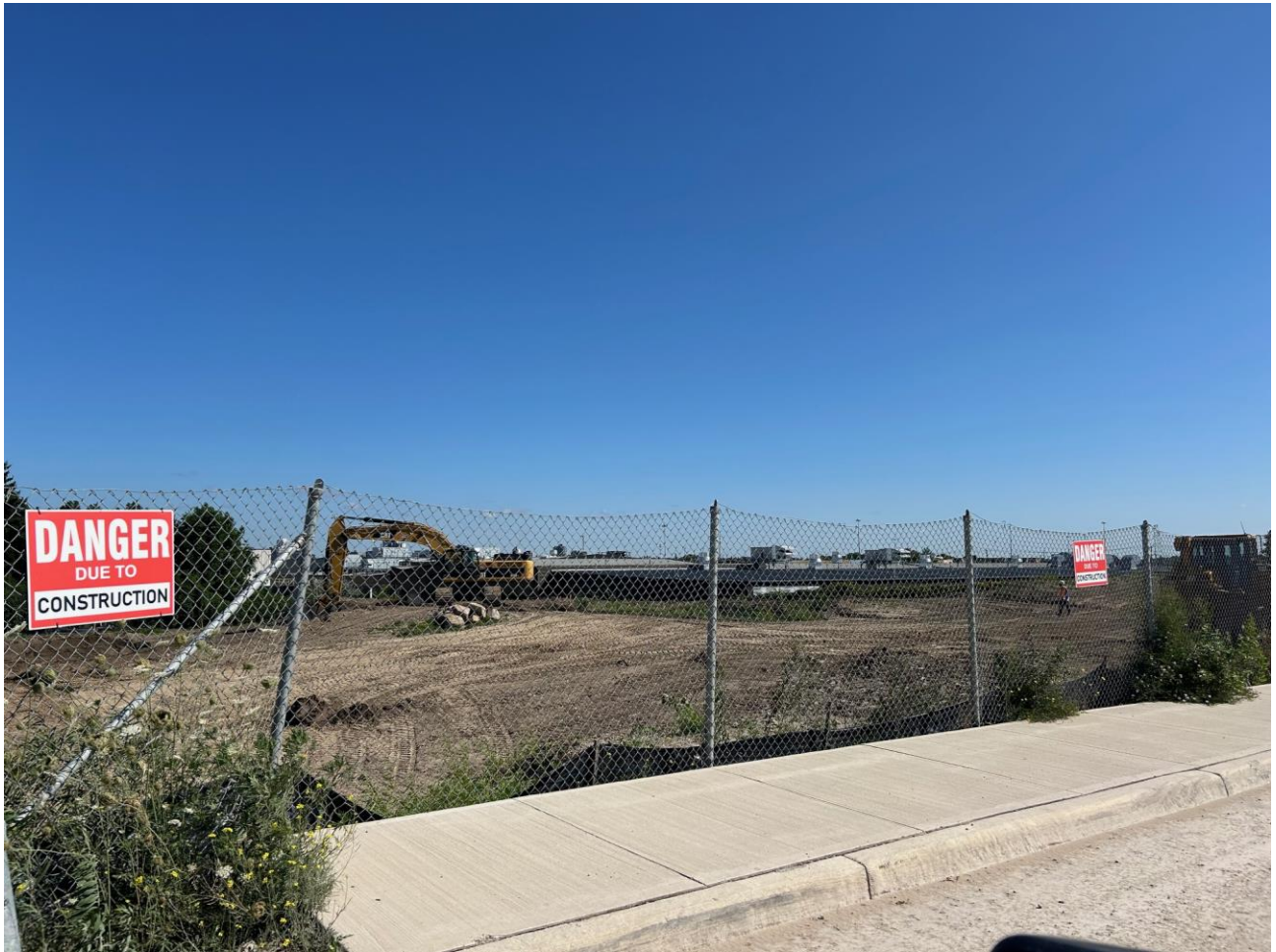
Figure 2: View of Existing Site Conditions