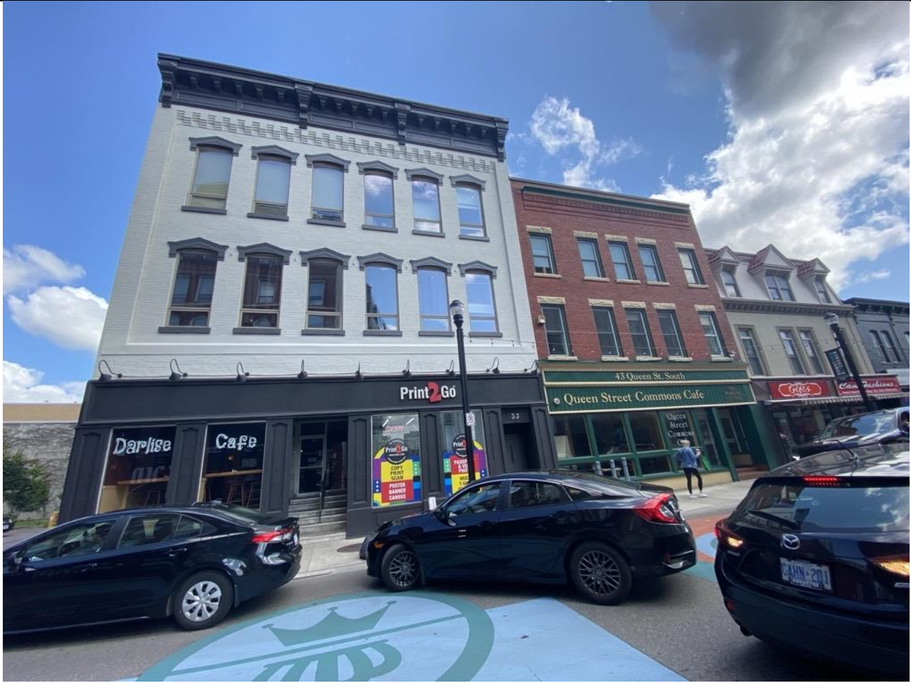
33 Queen Street South – Commerical Streetscape