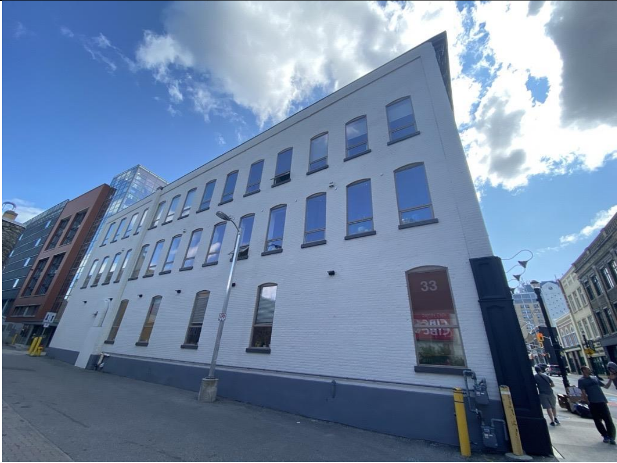
33 Queen Street South – East (side) elevation