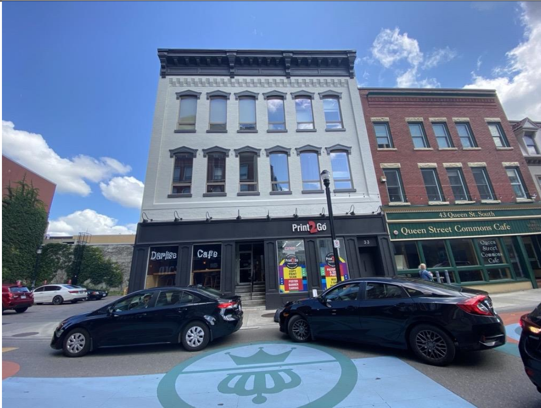
33 Queen Street South – Front Façade