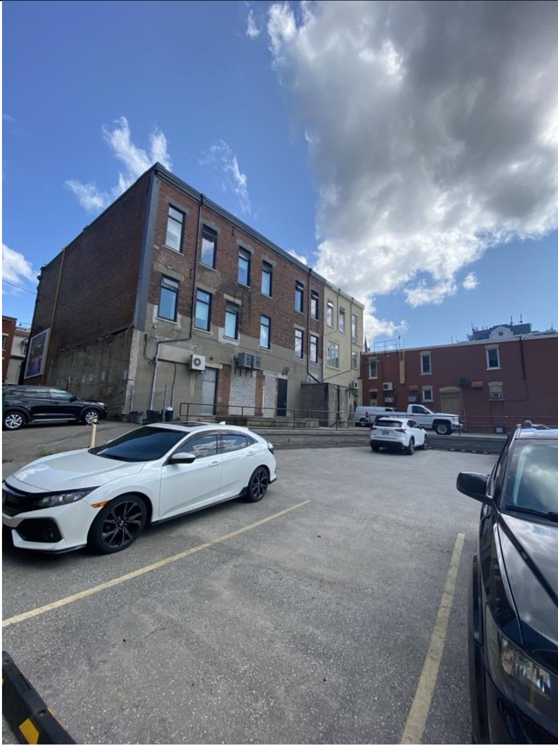
44-54 Queen Street South – Rear Facade