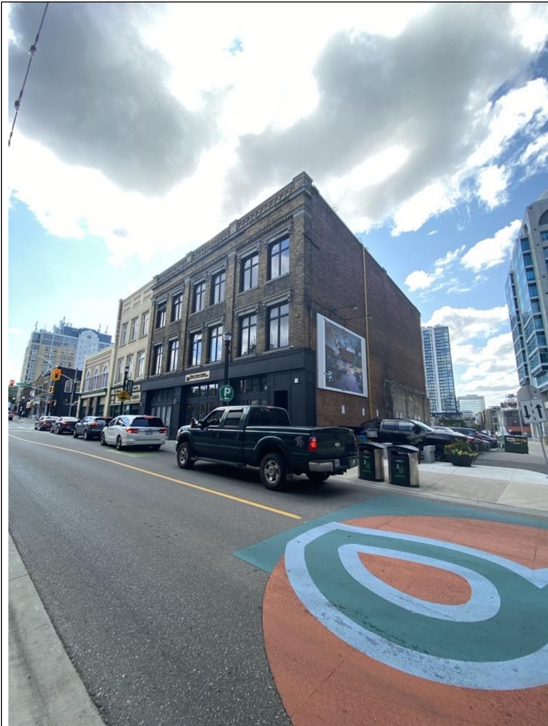
44-54 Queen Street South – Front and East (side) elevation