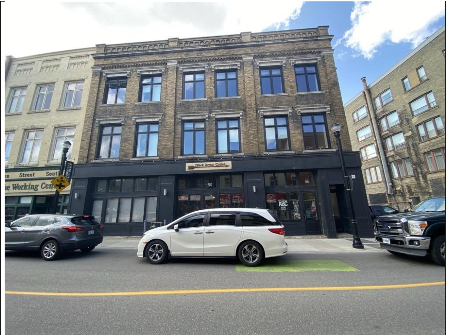
44-54 Queen Street South – Front Façade