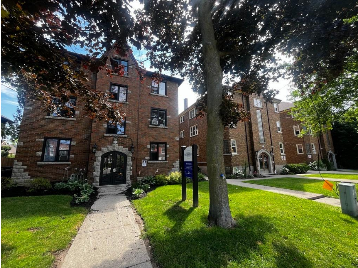
Contextual Setting – Three Adjacent Apartment Buildings