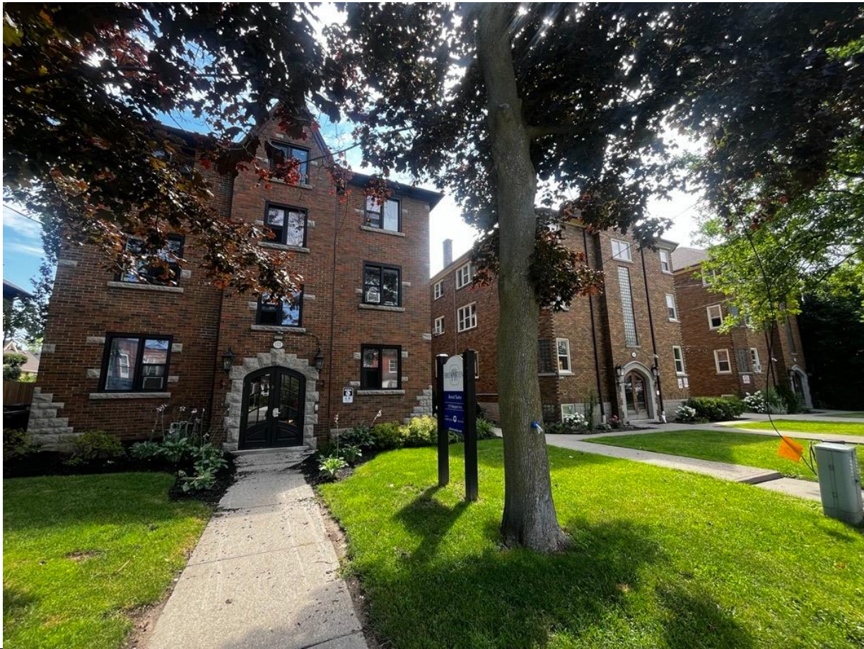
Contextual Setting – Three Adjacent Apartment Buildings