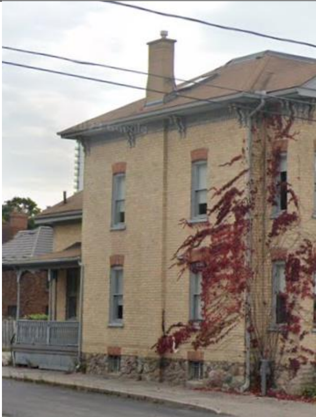
Side Elevation (East Façade) – 171-173 Victoria Street North