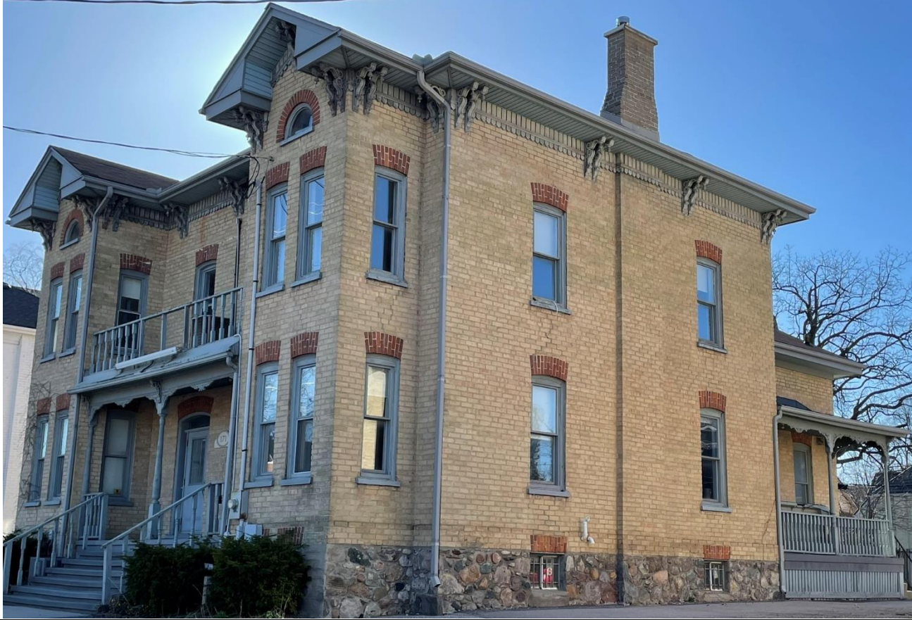
Side Elevation (West Façade) – 171-173 Victoria Street North