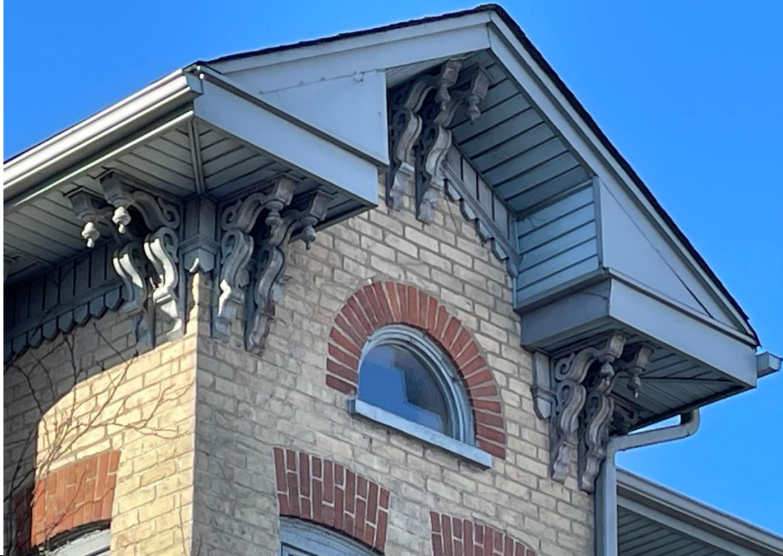
Detailing of projecting gable with plain fascia, soffits and decorative frieze board along with highly decorative paired brackets