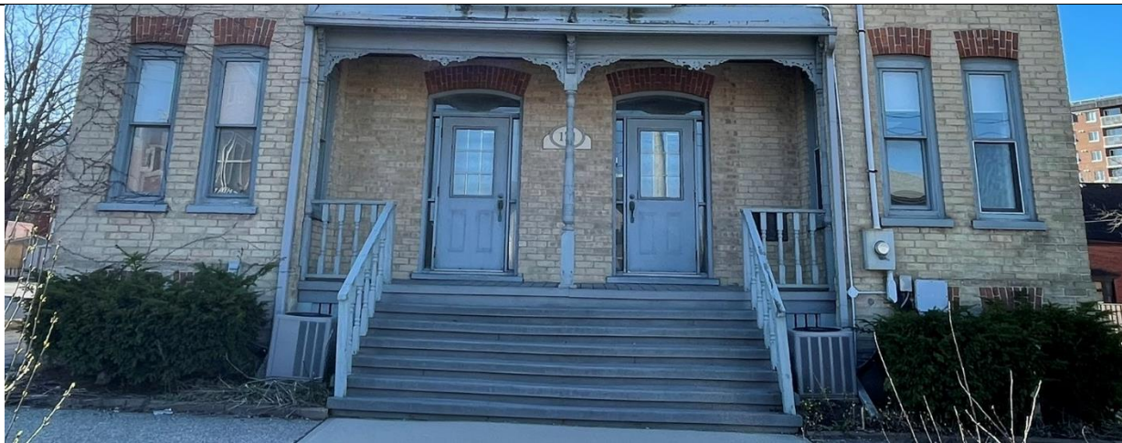
Detailing of door openings with transom and side lites, and detailing of verandah with turned posts, turned balusters and decorative brackets and scrollwork