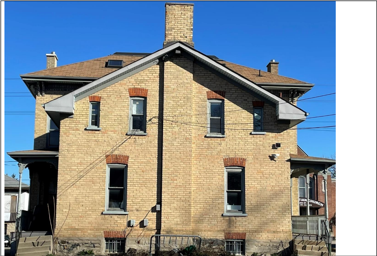
Front Elevation (South Façade) – 171-173 Victoria Street North (Rear Addition)