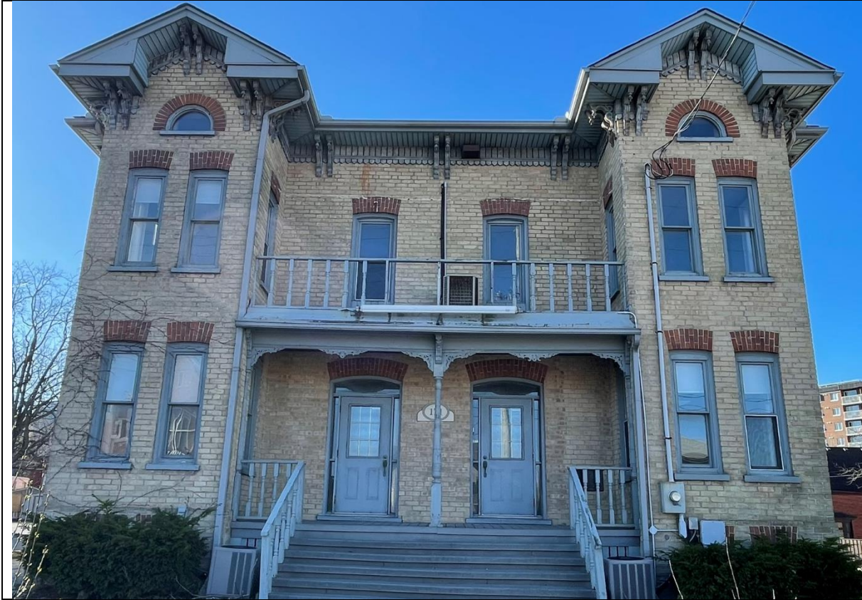
Front Elevation (North Façade) – 171-173 Victoria Street South (former semi-detached dwelling converted to offices)