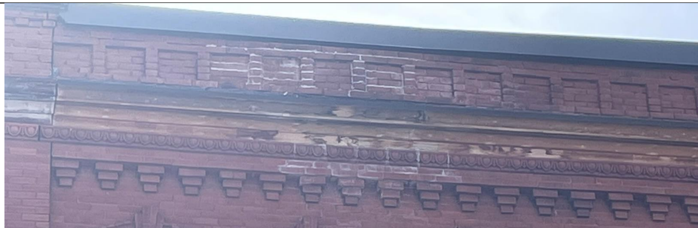
Third-storey details showing highly decorative brick cornice, brick frieze, and stone and brick architrave; and, ornamental brick moulding along with red brick corbelling – 83-85 King Street West