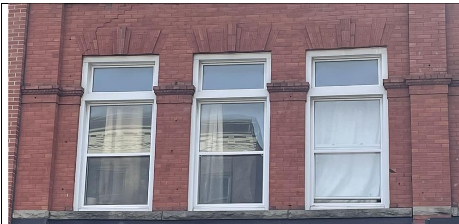
Second-storey details showing flat head window openings; rectangular transom design; and, 1/1 hung window design with brick voussoirs and continuous stone sills