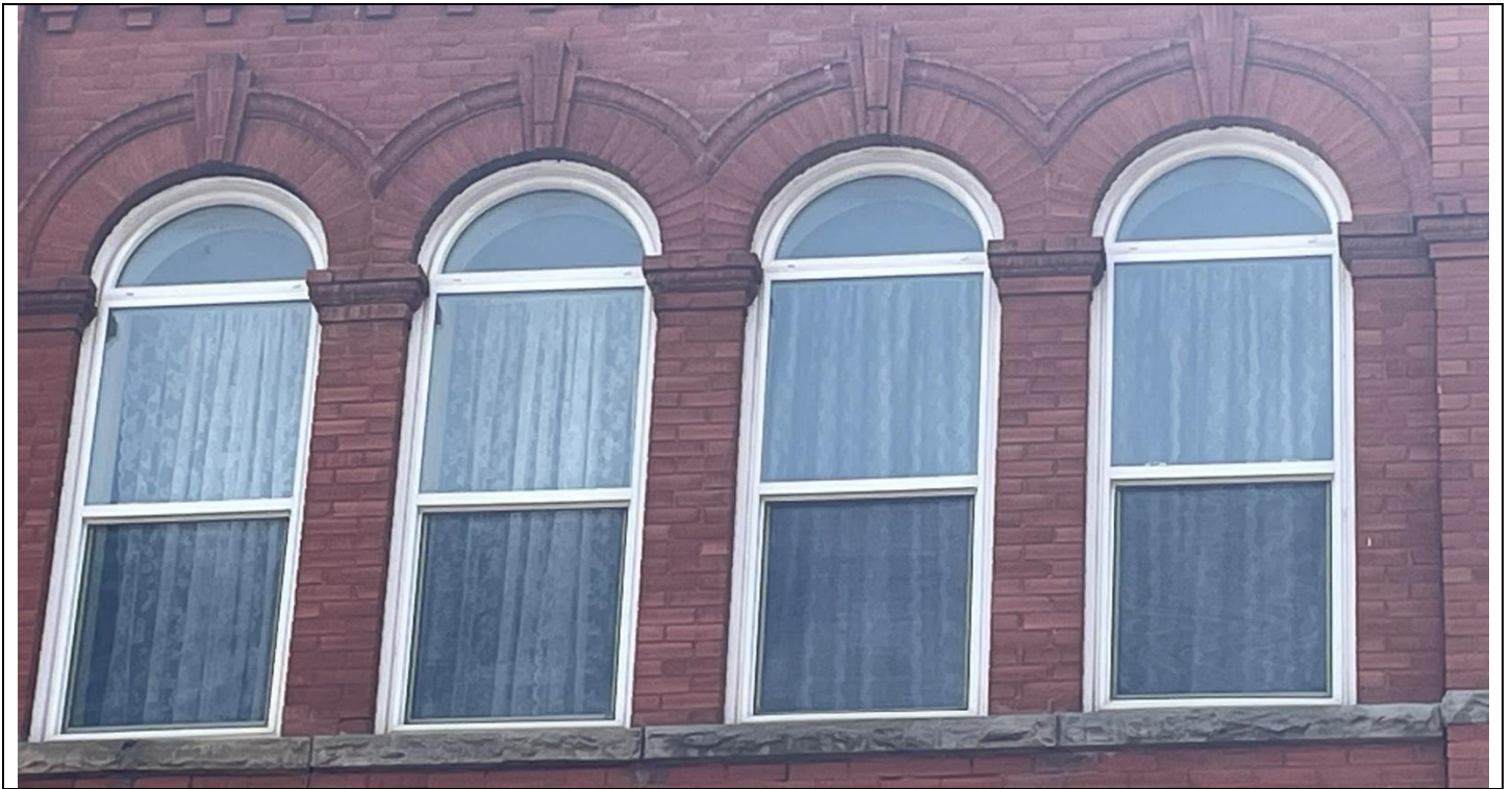
Third-storey details showing semi-circular window openings; semi-circular transom design; and, 1/1 hung window design with brick voussoirs and continuous stone sills