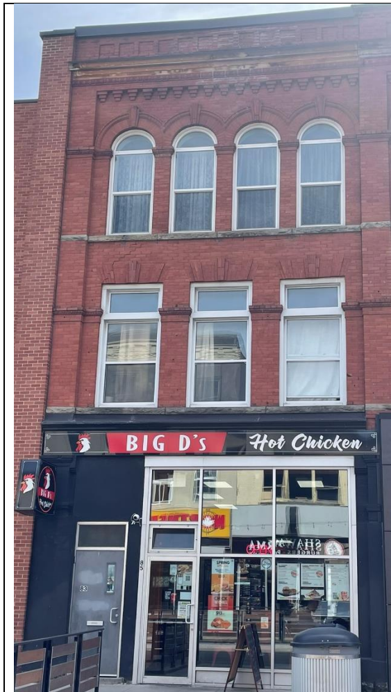
Front Elevation (North Elevation) – 83-85 King Street West