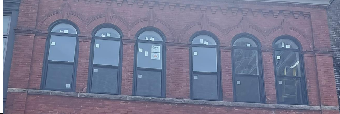
Detailing of second-storey showing semi-circular window openings; semi-circular transom; 1/1 hung windows; and, decorative brick hood moulds with keystones and continuous stone sills