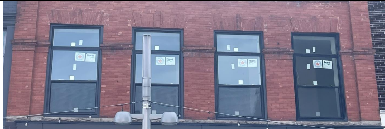
Detailing of second-storey showing flat head window openings; rectangular transoms; 1/1 windows; and, brick voussiors and continuous stone sills