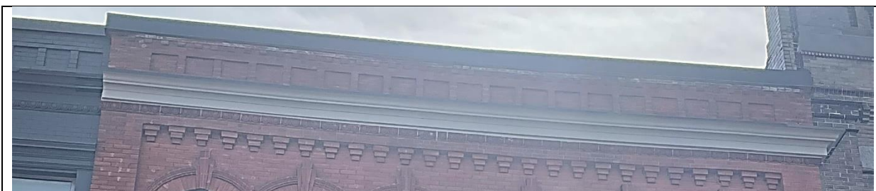
Detailing of brick frieze, stone and brick architrave and ornamental brick moulding along with red brick corbelling – 97-99 King Street West