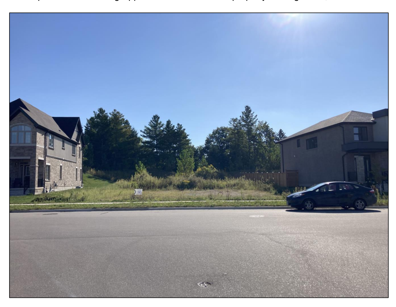
Figure 1: Photo of the subject property, taken from the intersection of Ridgemount Street and Sportsman Hill Street. The Recipient Lot, addressed as 448 New Dundee Road, is located in the background.

The subject property is located on the east side of Ridgemount Street, south of Thomas Slee Drive in the Doon South Planning Community. The property is an undeveloped subdivision block that was created in 2018 though the registration of Subdivision Plan 58M-616 (c/r with 30T-1320; formerly known as the "Ormston Subdivision"). The property continues to be owned by Activa Holdings Inc., the same corporation that registered the plan of subdivision. The property does not have a municipal address because it does not contain a building, though it is located between 98 Ridgemount Street to the north and 86 Ridgemount Street to the south, both of which contain single detached dwellings. Development and Housing Approvals staff visited the property on August 30, 2024.