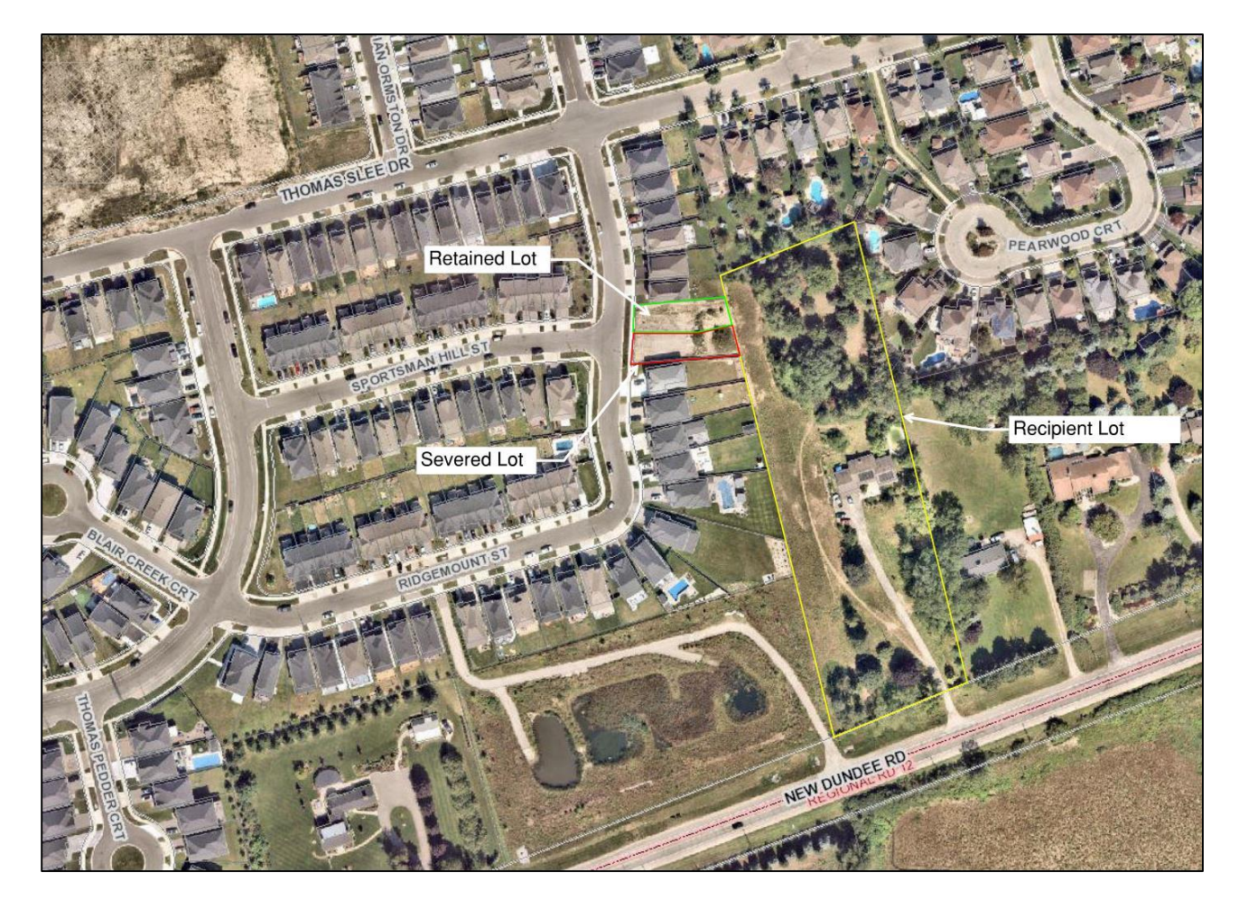
Figure 3: Aerial photo showing the Retained Lot, Severed Lot, and Recipient Lot.

The above noted condition outlines the process and key planning steps for the developer to obtain final Site Plan Approval. In this regard, the purpose of the subject Consent Application is to fulfill Special Condition V.a. Specifically, the applicant is requesting consent to sever a parcel of land having an approximate lot width of 13.3 metres, a lot depth of 46.1, metres and a lot area of 533.1 square metres (i.e., 'Severed Lot'), and convey it as a lot addition to the property municipally addressed as 448 New Dundee Road (i.e., 'Recipient Lot'). The 'Retained Lot' would have an approximate lot width of 11.6 metres, a lot depth of 38.9, metres and a lot area of 511 square metres, would have frontage on Ridgemount Streets, and would be used for low rise residential purposes (see Figure 3).