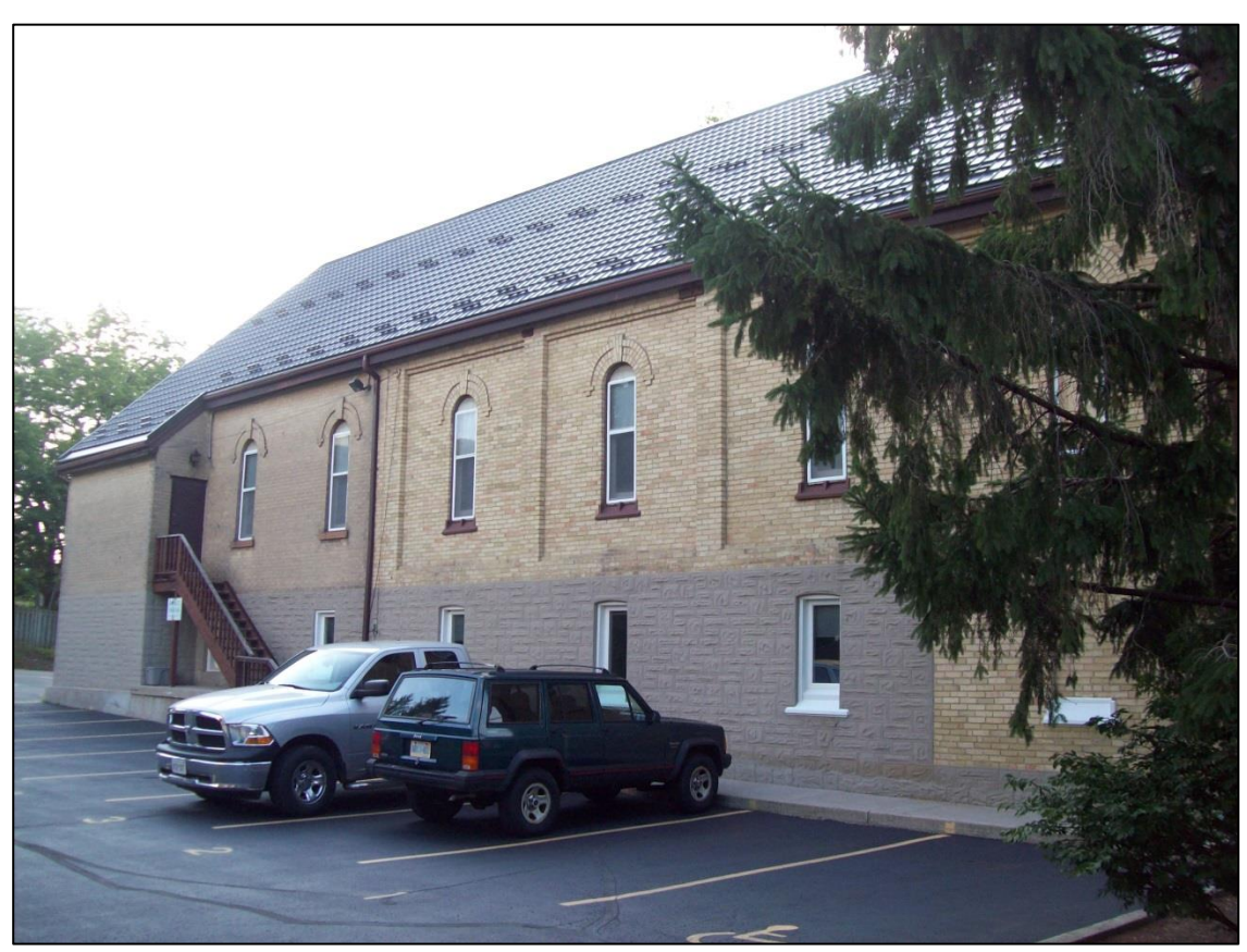
Side Elevation (East Façade)