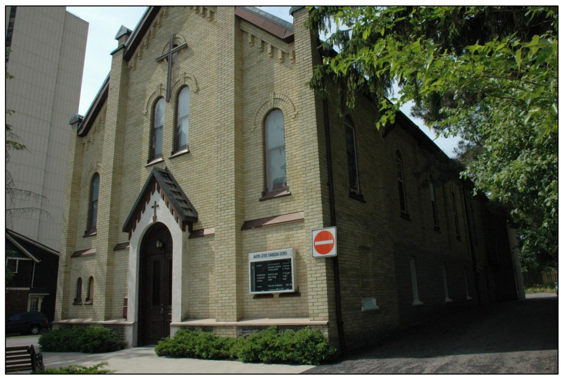
Front and Side Elevation (North and West Facades)