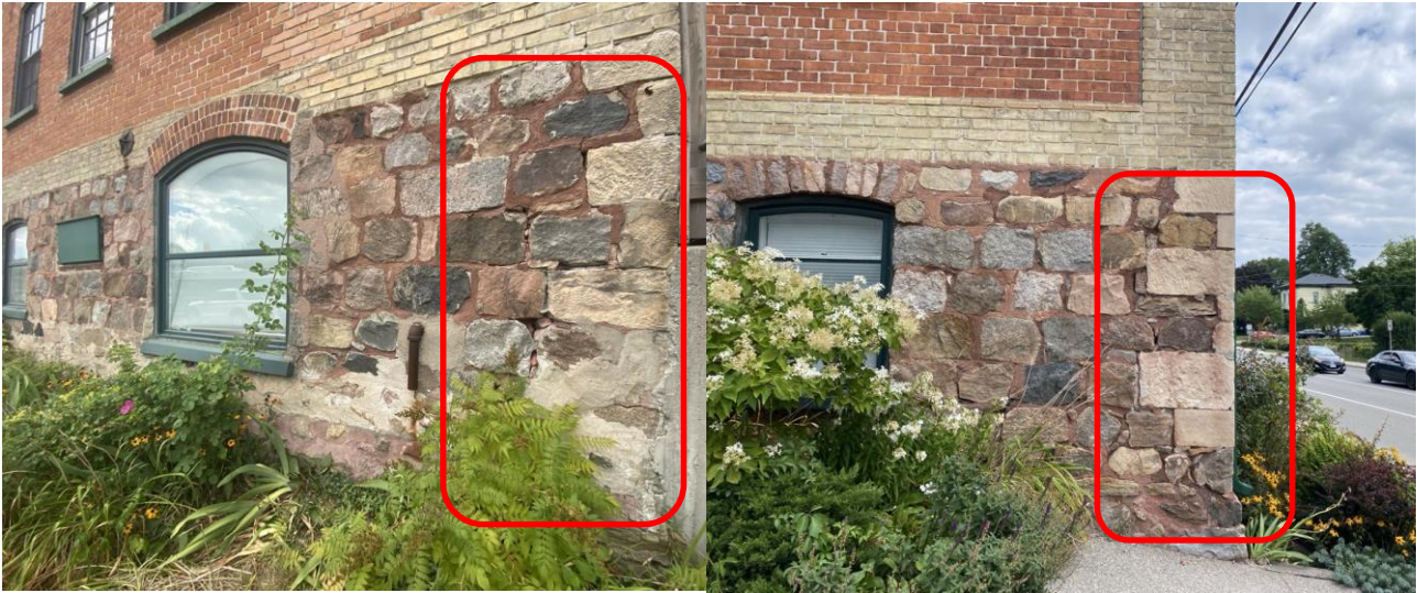
Figure 3. Cracking and spalling of the cement mortar on the side (south) façade facing Courtland Avenue East.

foundation wall along Courtland Avenue East was done in 2012. However, the mortar joints appear to have been repaired with cement, which is not an appropriate repointing agent. The cement patch does not bond well with sand and causes more damage when it falls.