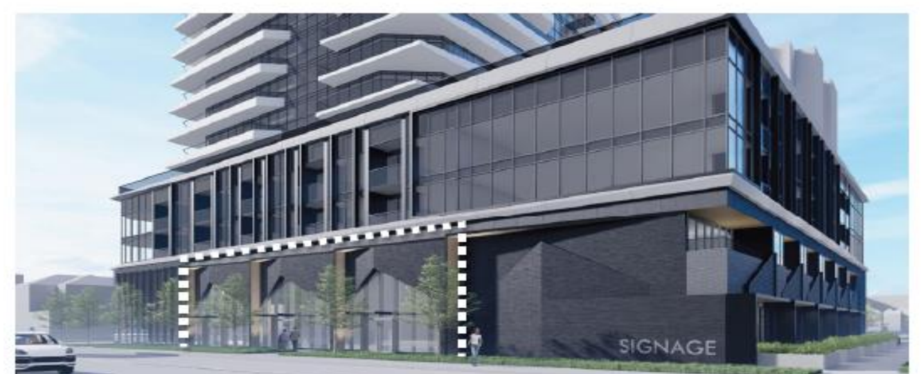
Figure 6: Characteristic Elements of Surrounding Area Reflected in Development Design