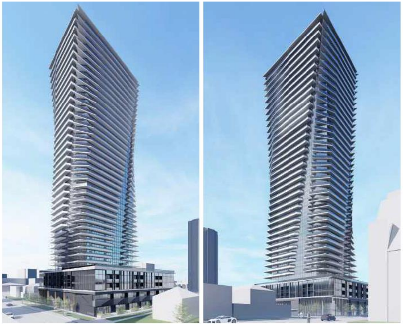
Figure 4: Renderings of Proposed Mixed-Use Development