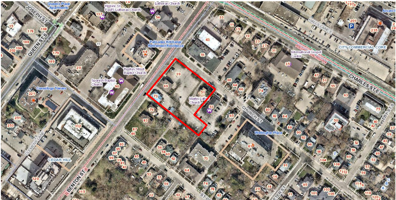
Figure 2: Arial View of Subject Properties