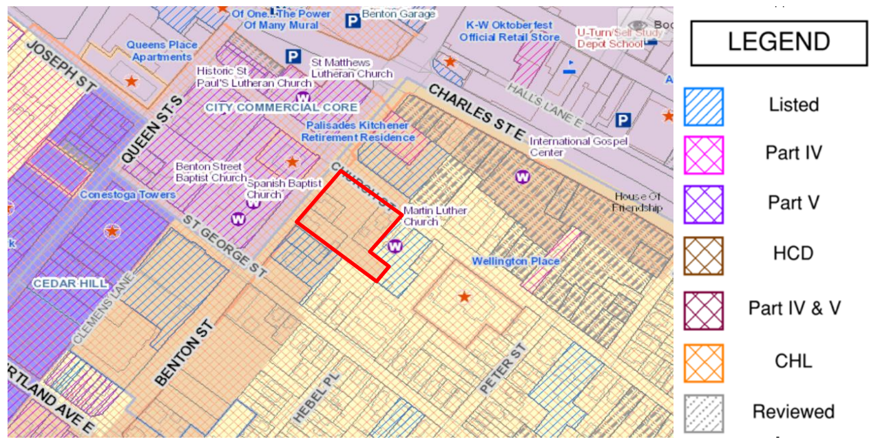
Figure 1: Map of Subject Properties and Surrounding Heritage Resources

The subject properties are also located within the Cedar Hill Neighbourhood Cultural Heritage Landscape (CHL), as defined in the Kitchener Cultural Heritage Landscape Study approved by Council in 2015. It should be noted that the first phase of Growing Together, approved by Kitchener City Council on March 18<sup>th</sup>, 2024, includes Official Plan Amendments which identify the Cedar Hill Neighbourhood CHL boundaries and provides area-specific policies which relate to new development or redevelopment. In particular the policies identify properties at notable intersections, including that of Benton Street and Church Street, as being a Property of Specific Cultural Heritage Landscape Interest, and state that in such locations consideration must be given to transition in built forms to protect and enhance views and local streetscape characteristics of the neighbourhood.