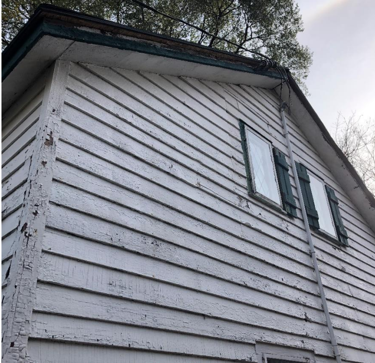
Figure 7. Side (West) Elevation in 2023