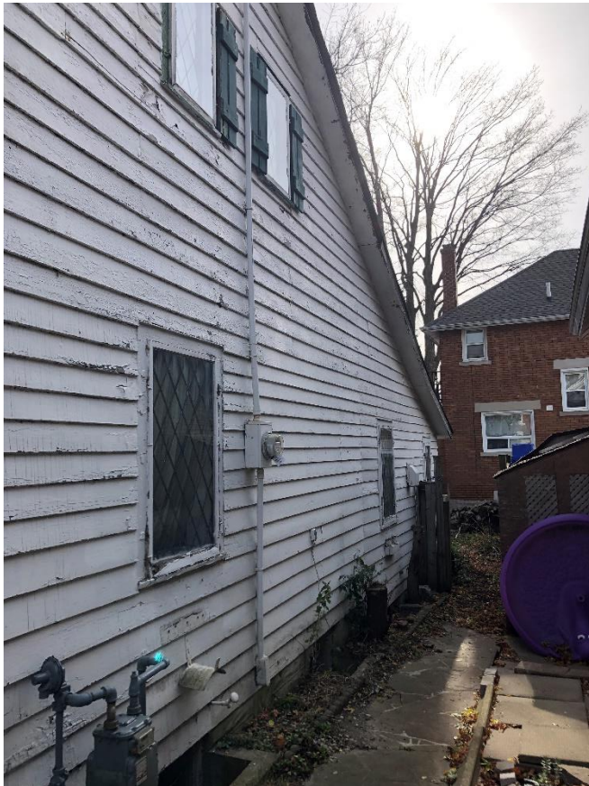
Figure 8. Side (West) Elevation in 2023