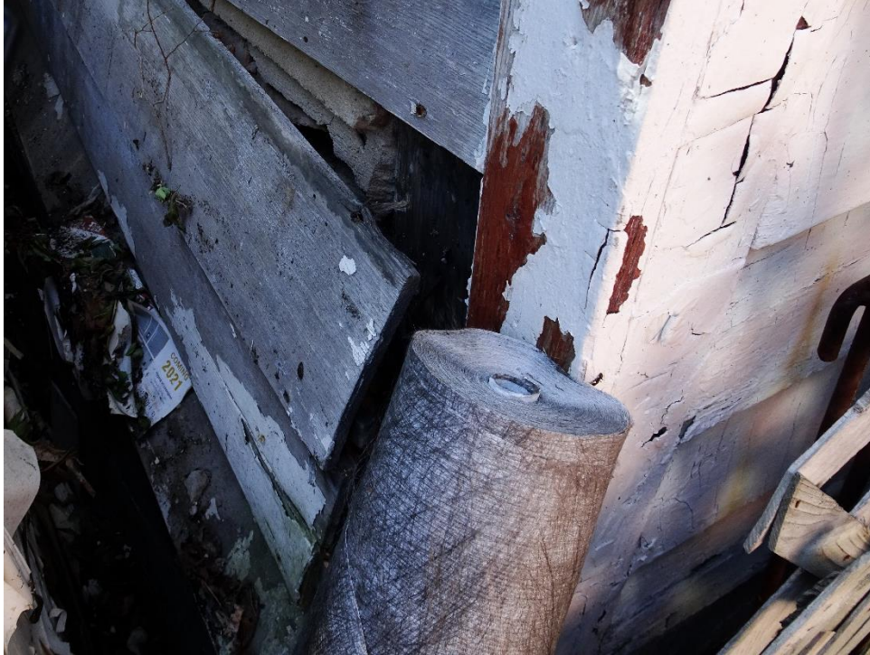
Figure 3. North-West Corner in 2020