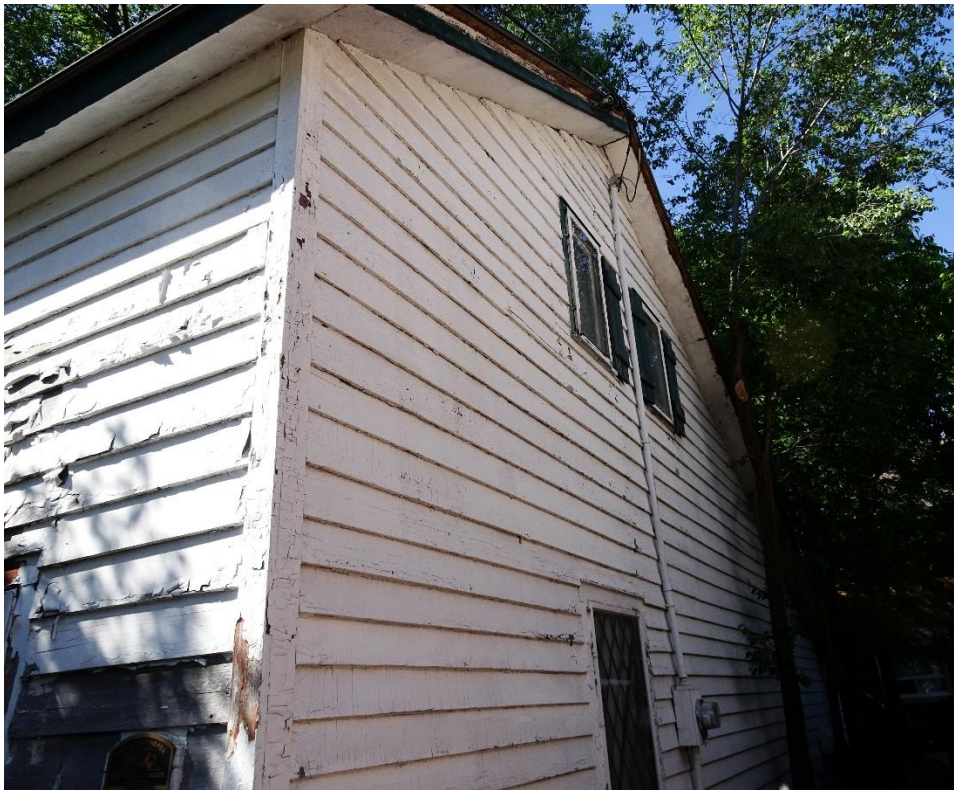
Figure 4. Side (West) Elevation in 2020