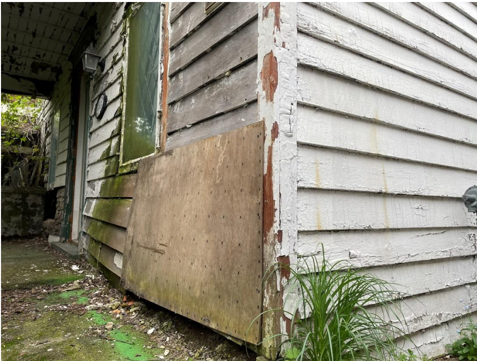
Figure 23. North-West Corner in 2024