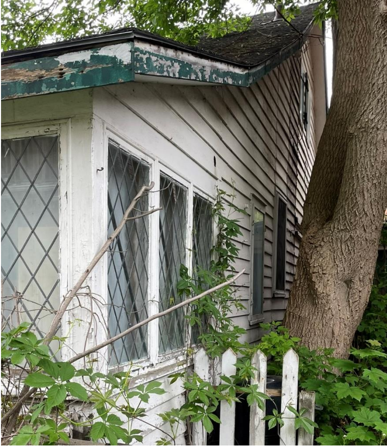
Figure 24. Side (East) Elevation in 2024