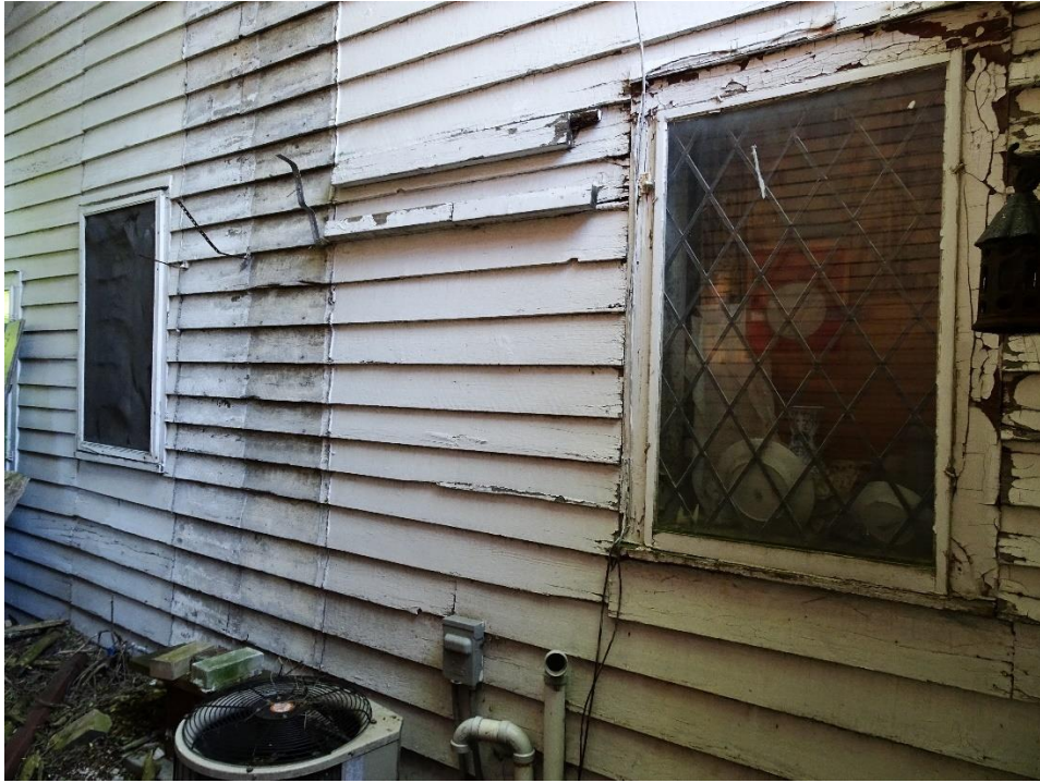
Figure 5. Side (East) Elevation in 2020