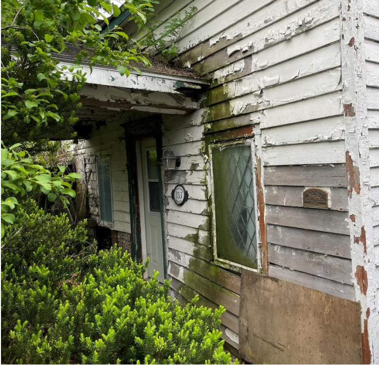
Figure 20. Front (North) Elevation in 2024