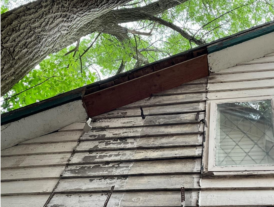
Figure 28. Missing Fascia from Chimney Removal on Side (East) Elevation in 2024