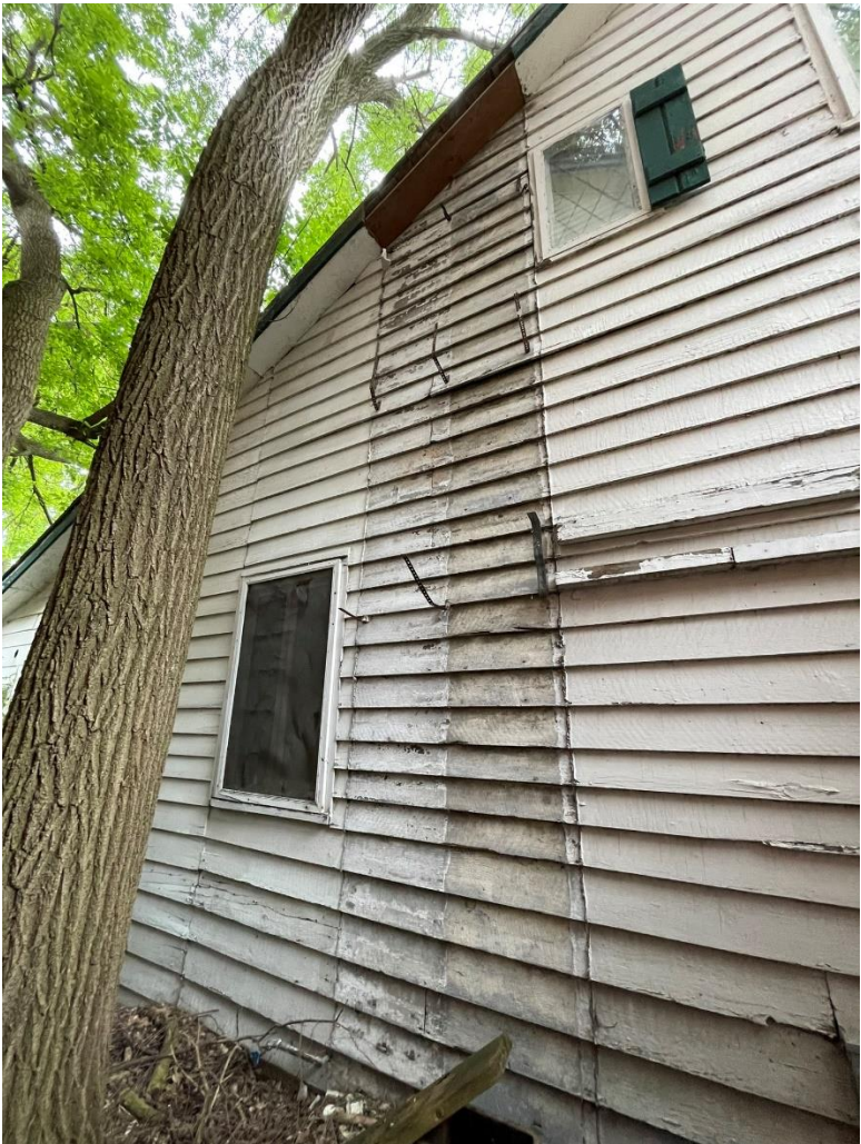
Figure 27. Side (East) Elevation in 2024