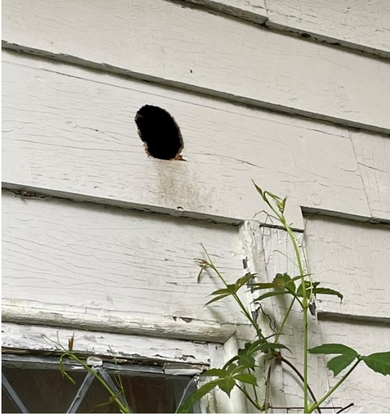
Figure 26. Hole in Clapboard on Side (East) Elevation in 2024