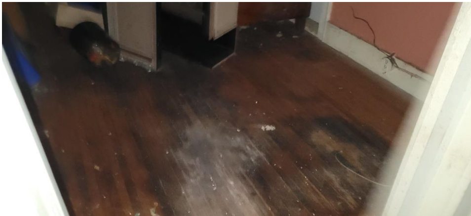
Figure 12. Interior – Water Damaged Wood Floor in 2023