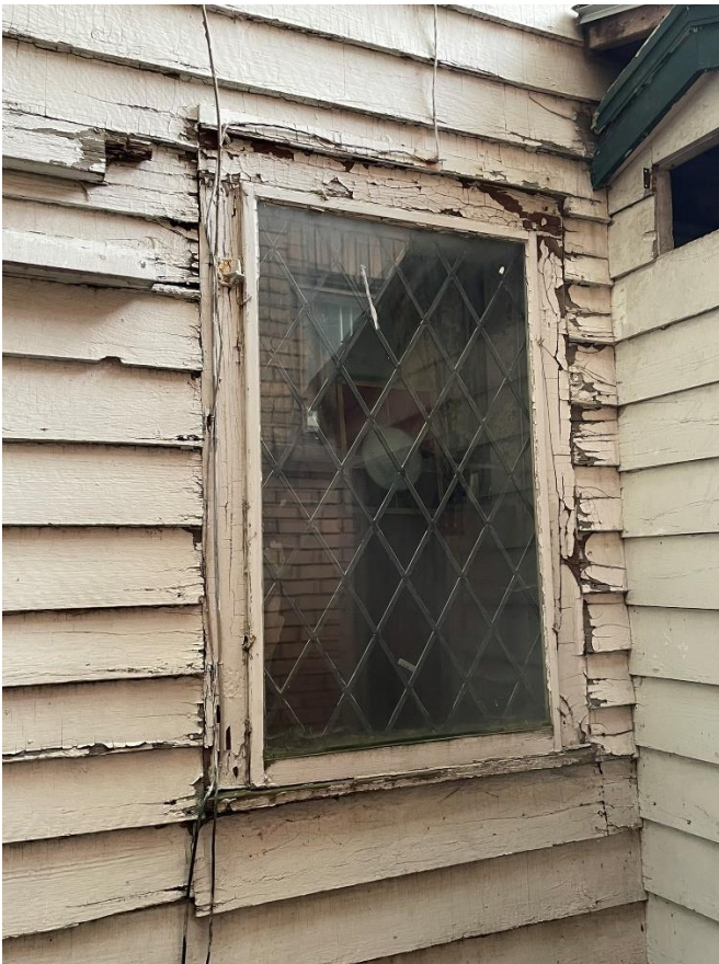
Figure 29. Example Leaded Glass Diamond Shaped Windows in 2024