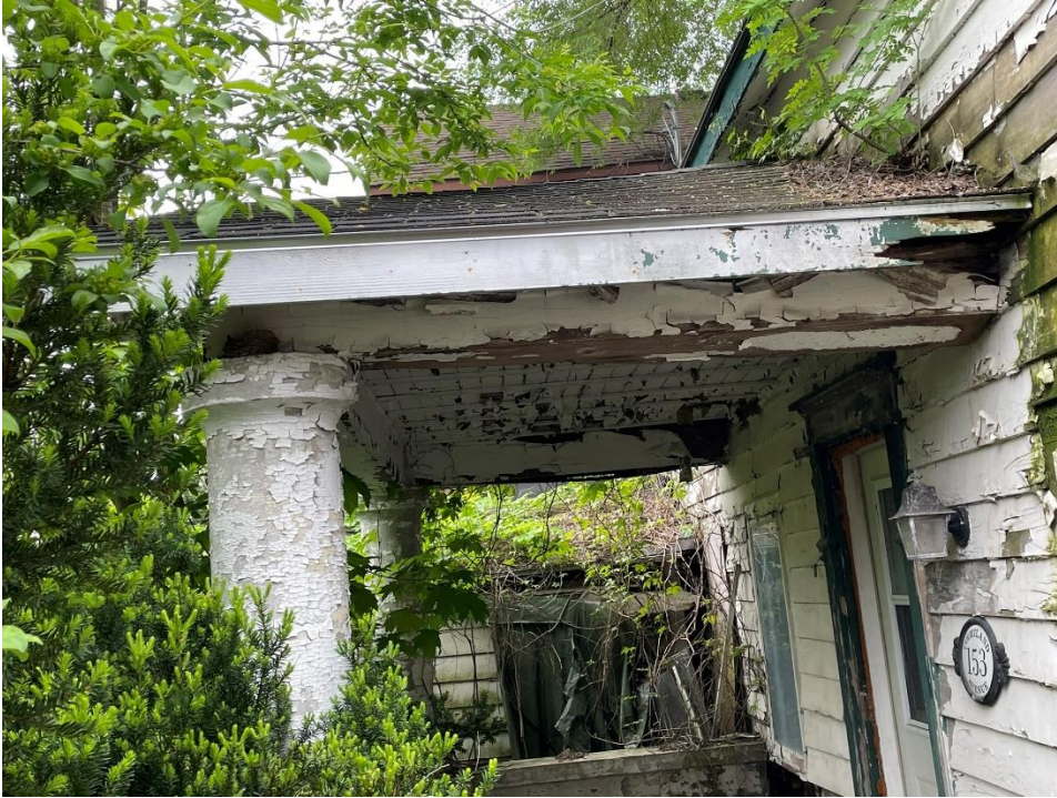
Figure 22. Porch Roof and Columns in 2024