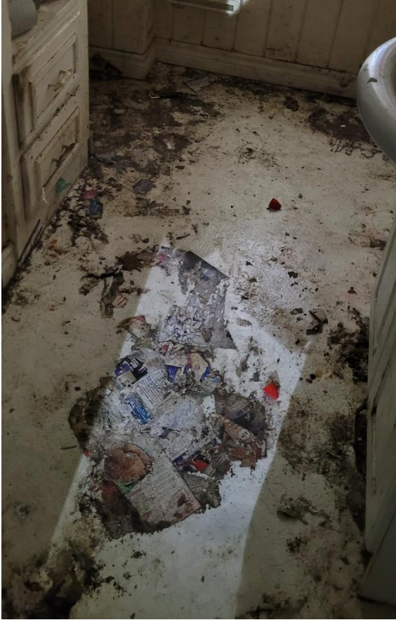
Figure 14. Interior – Bathroom Floor in 2023