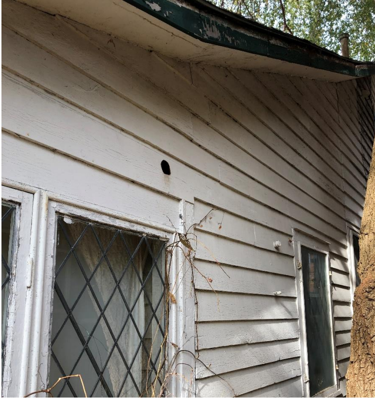
Figure 9. Side (East) Elevation in 2023