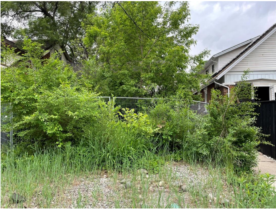
Figure 19. Front (North) Elevation in 2024