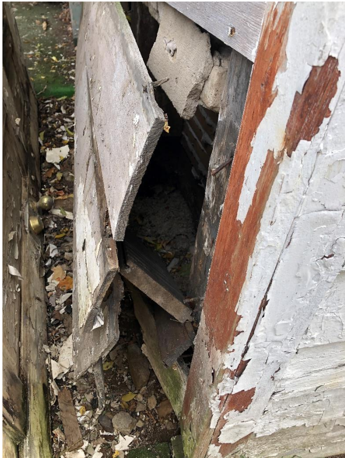
Figure 6. North-West Corner in 2023