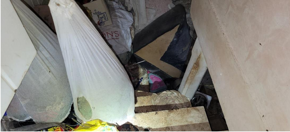
Figure 18. Interior – Stairs to Basement in 2023