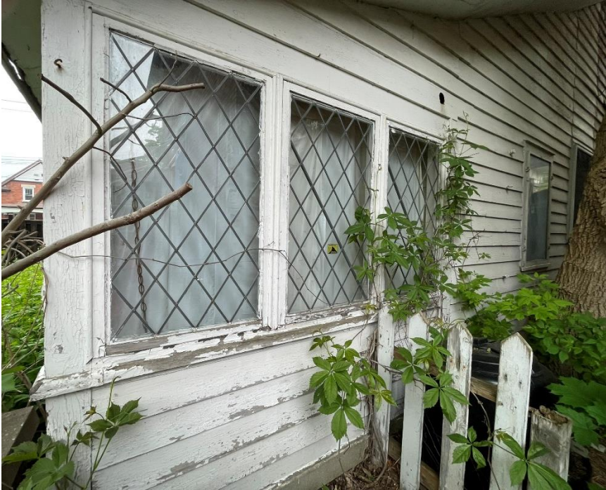
Figure 25. Side (East) Elevation in 2024