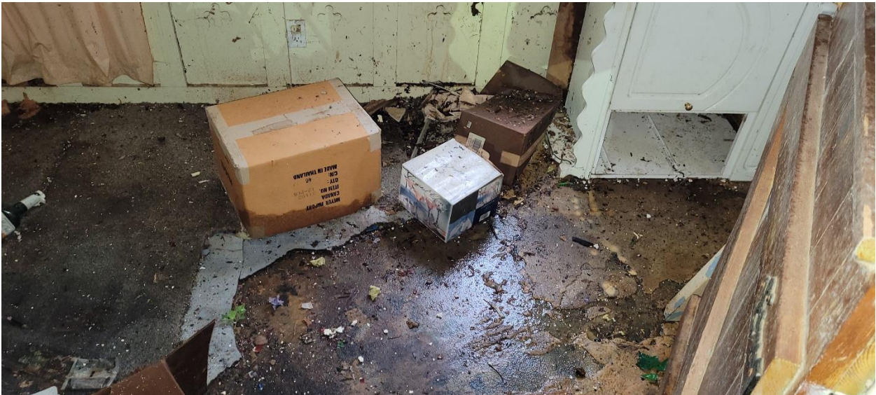
Figure 15. Interior – Floor in 2023