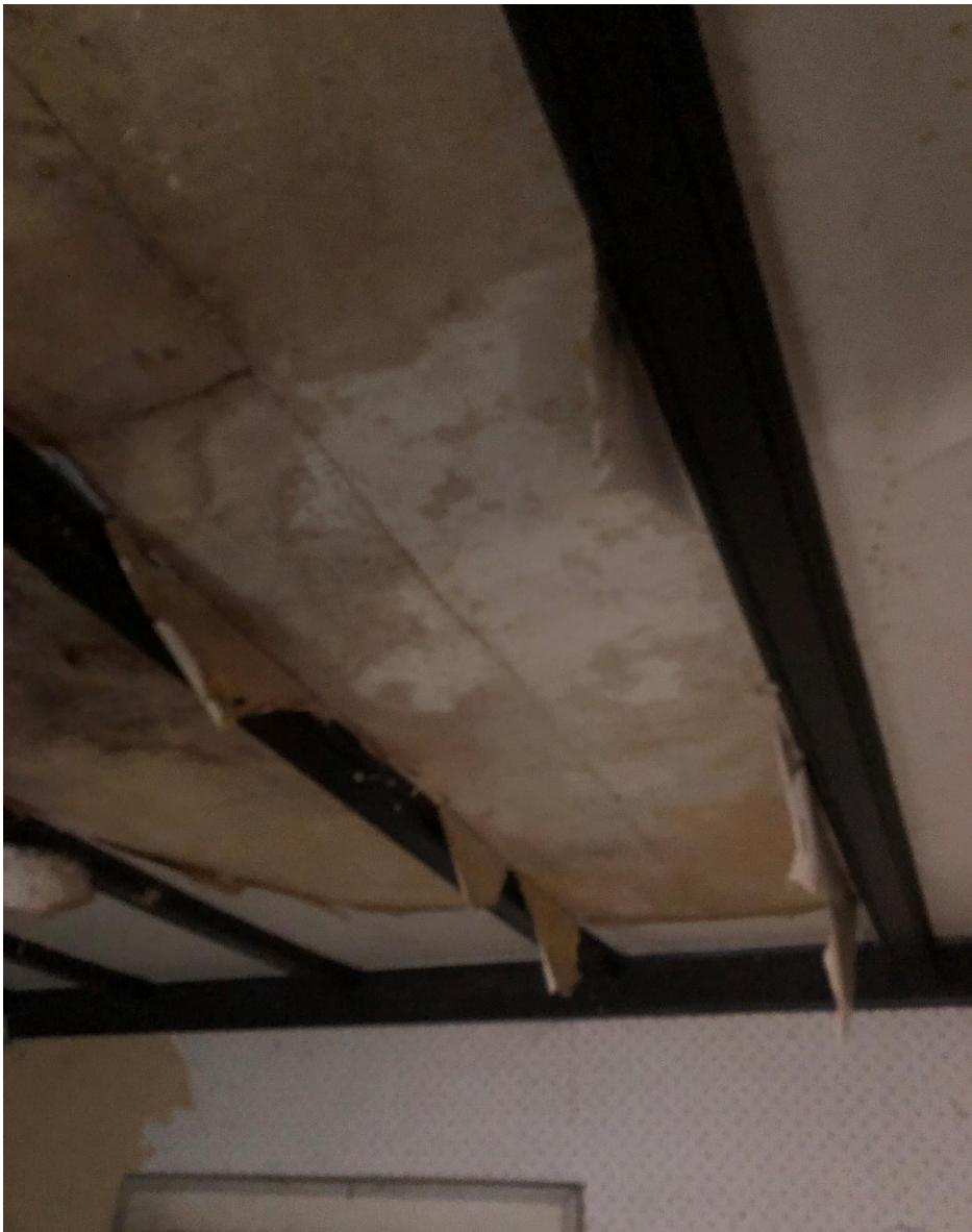
Figure 17. Interior – Water Damaged Ceiling in 2023