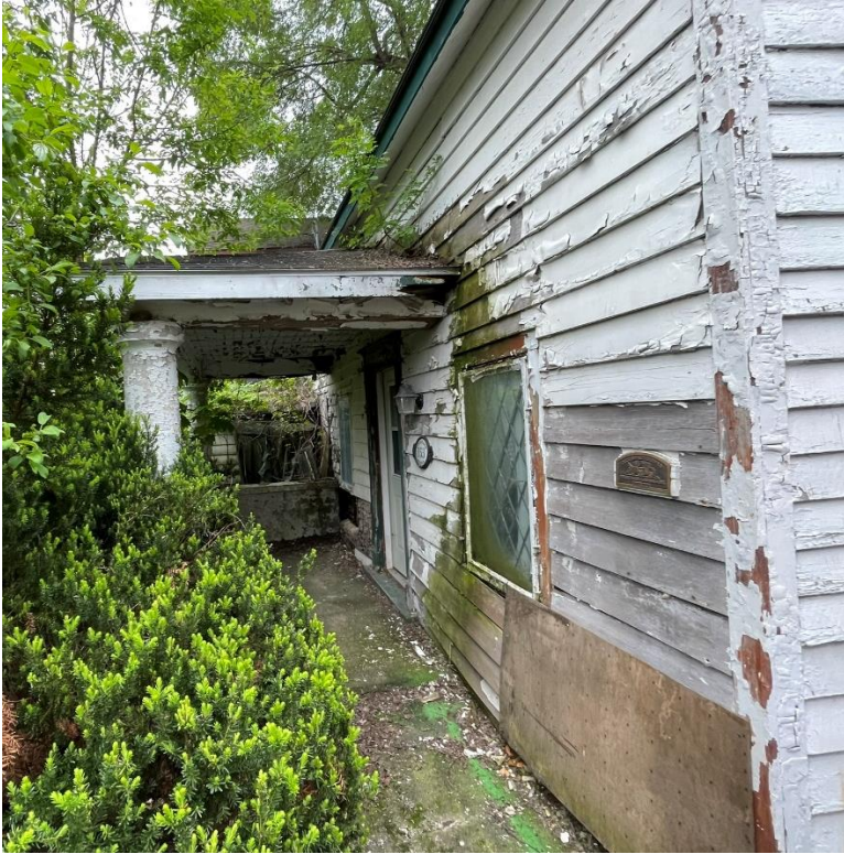
Figure 21. Front (North) Elevation in 2024