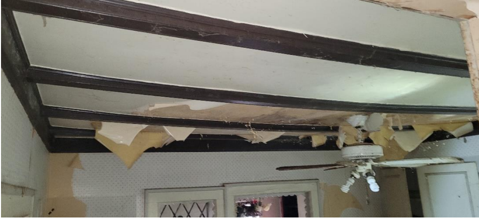
Figure 16. Interior – Water Damaged Ceiling in 2023