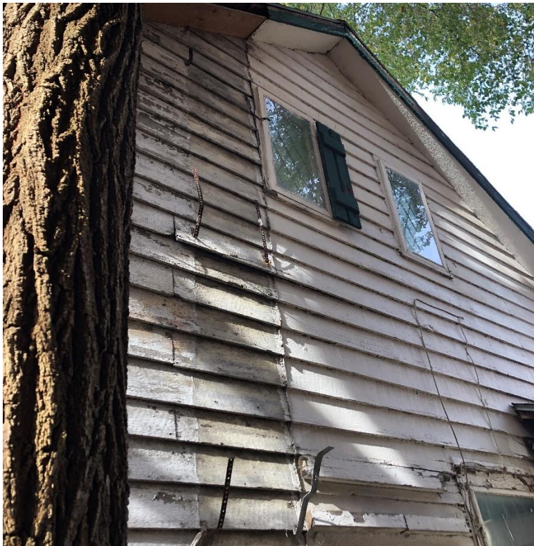
Figure 10. Side (East) Elevation in 2023