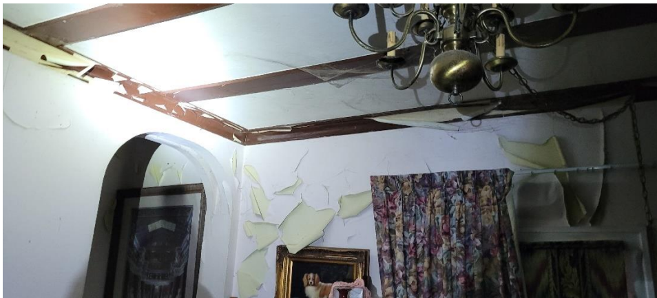
Figure 13. Interior – Example of Peeling Paint in 2023