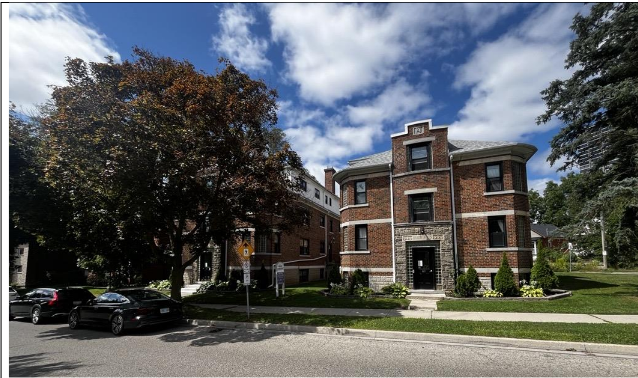
View from Union Boulevard