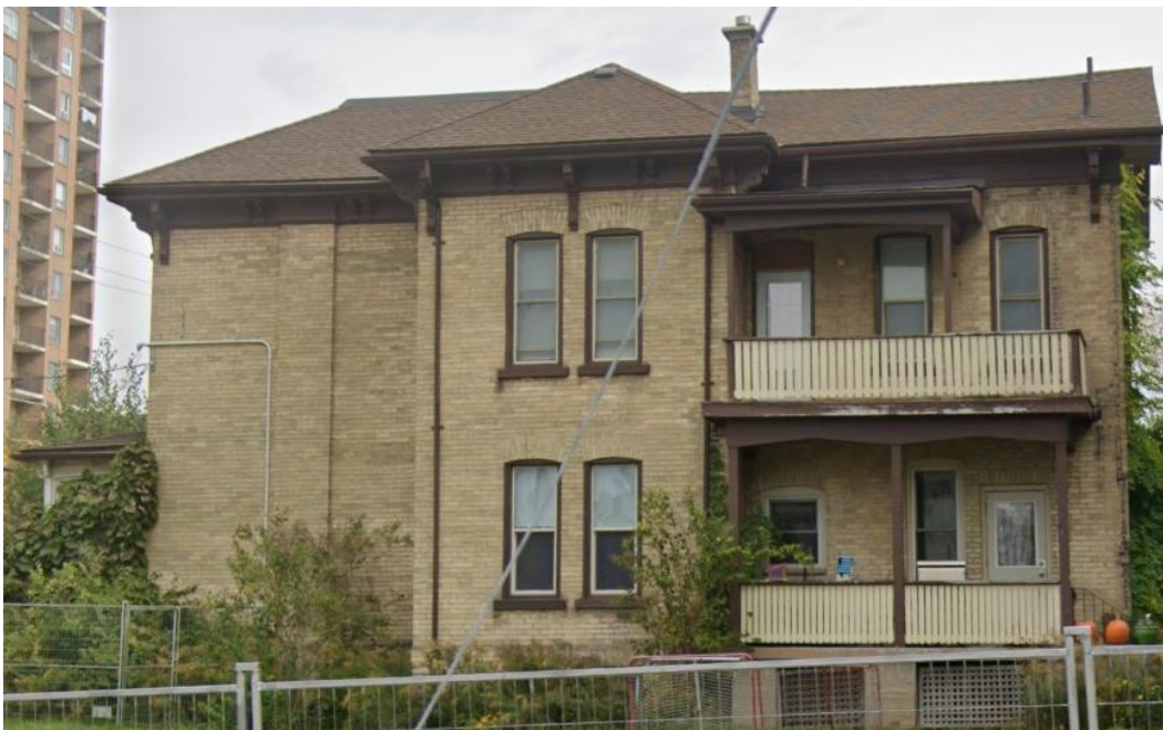
Side Elevation (West Façade) – 83 Benton Street