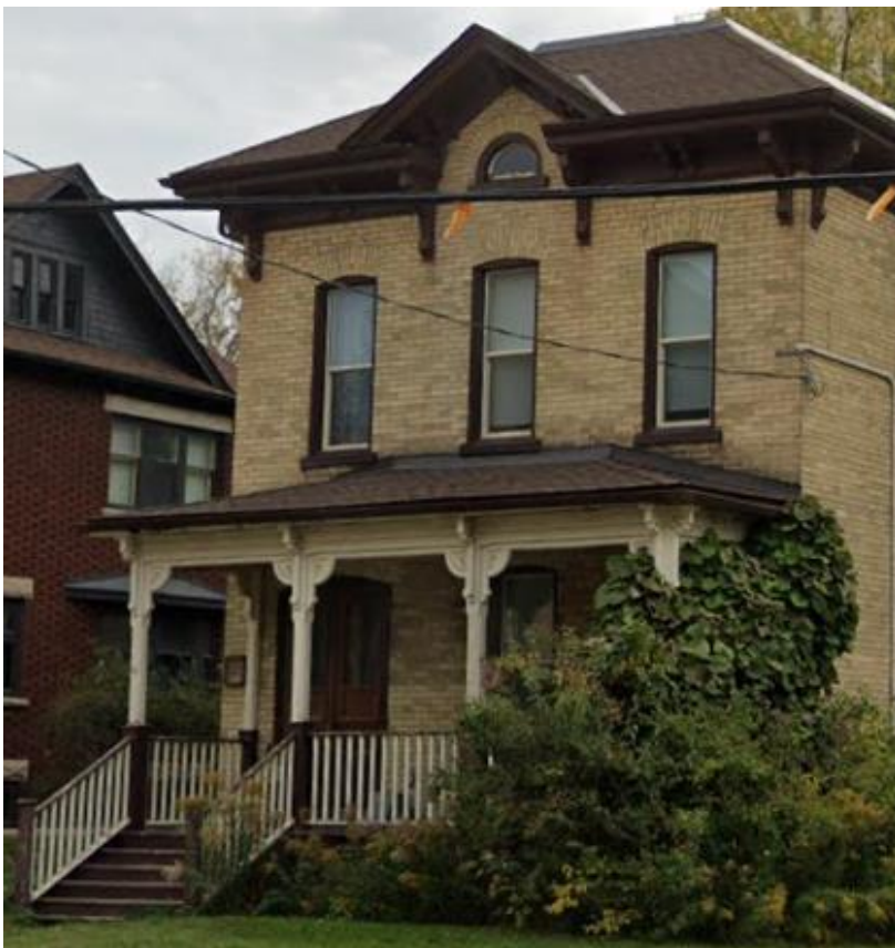
Front Elevation (North Façade) – 83 Benton Street