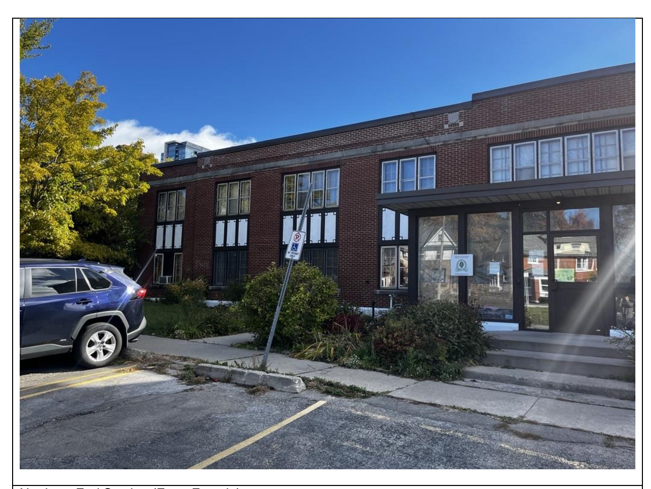
Northern End Section (Front Façade)