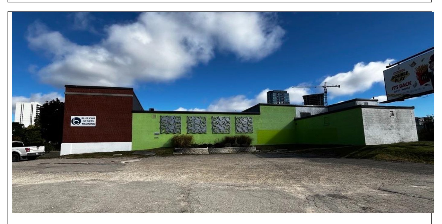
South-Side Façade (1927 Portion and new addition)