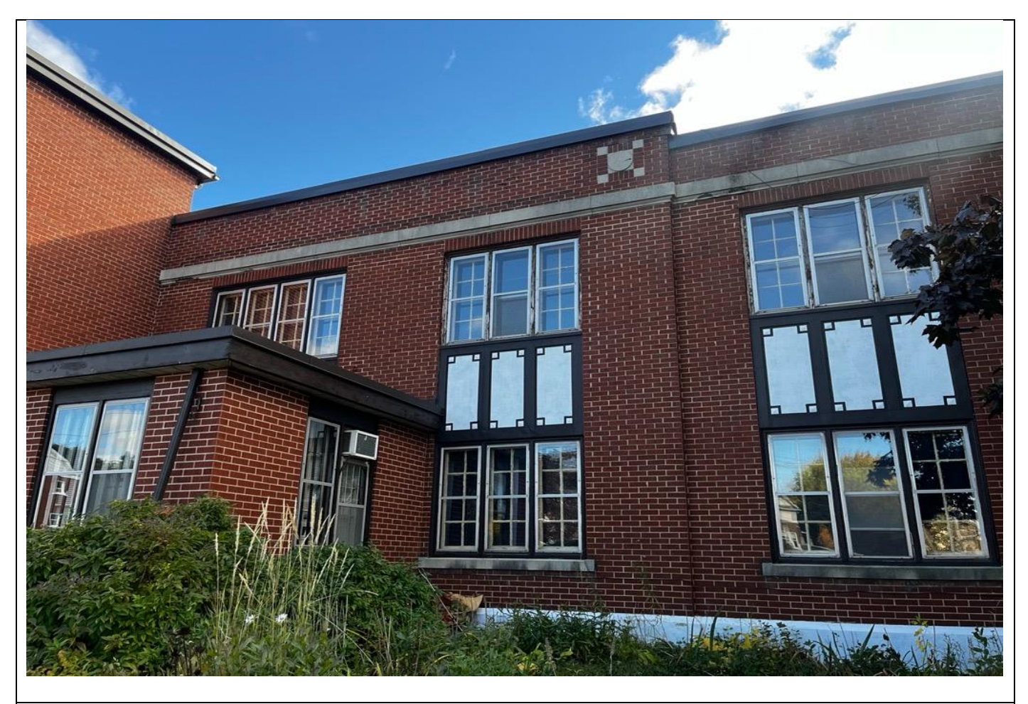
Close-up of Architectural Detailing on Central Section Including Concrete Motifs and Decorative Panels