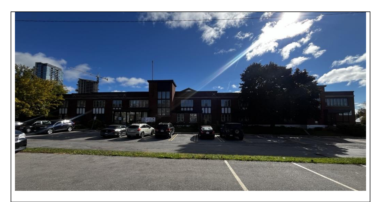
Front Façade of Subject Building