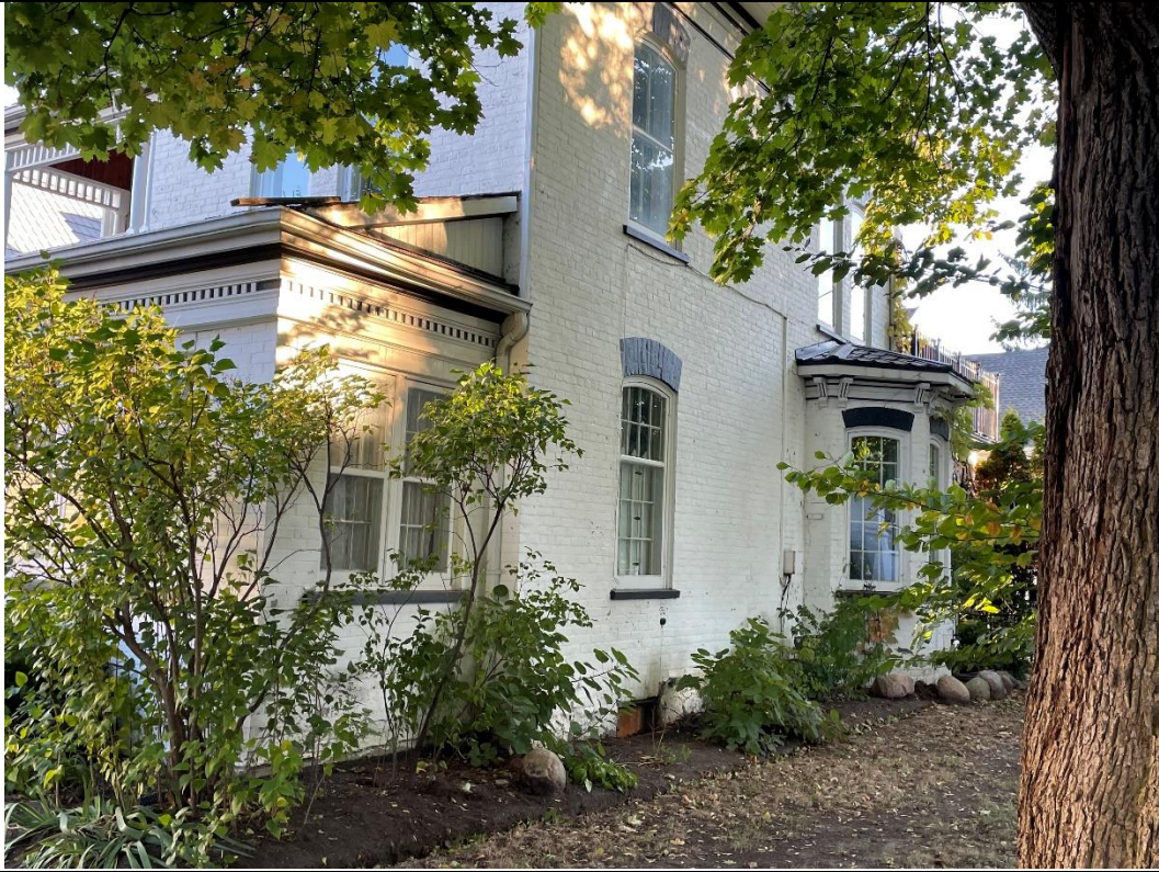
Side (East Façade) Elevation