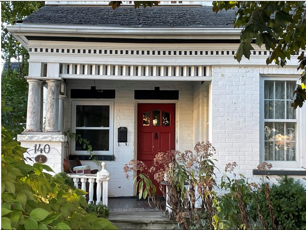
Front (South Façade) Elevation - Verandah