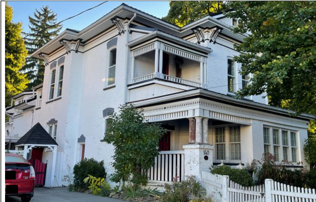
Front & Side (South & West Façade) Elevation