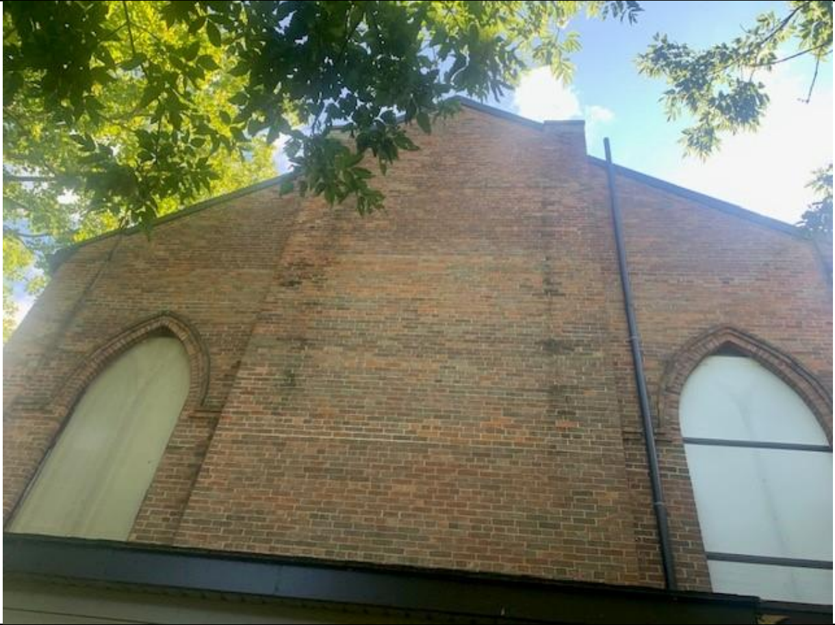
Rear Elevation (West Façade)