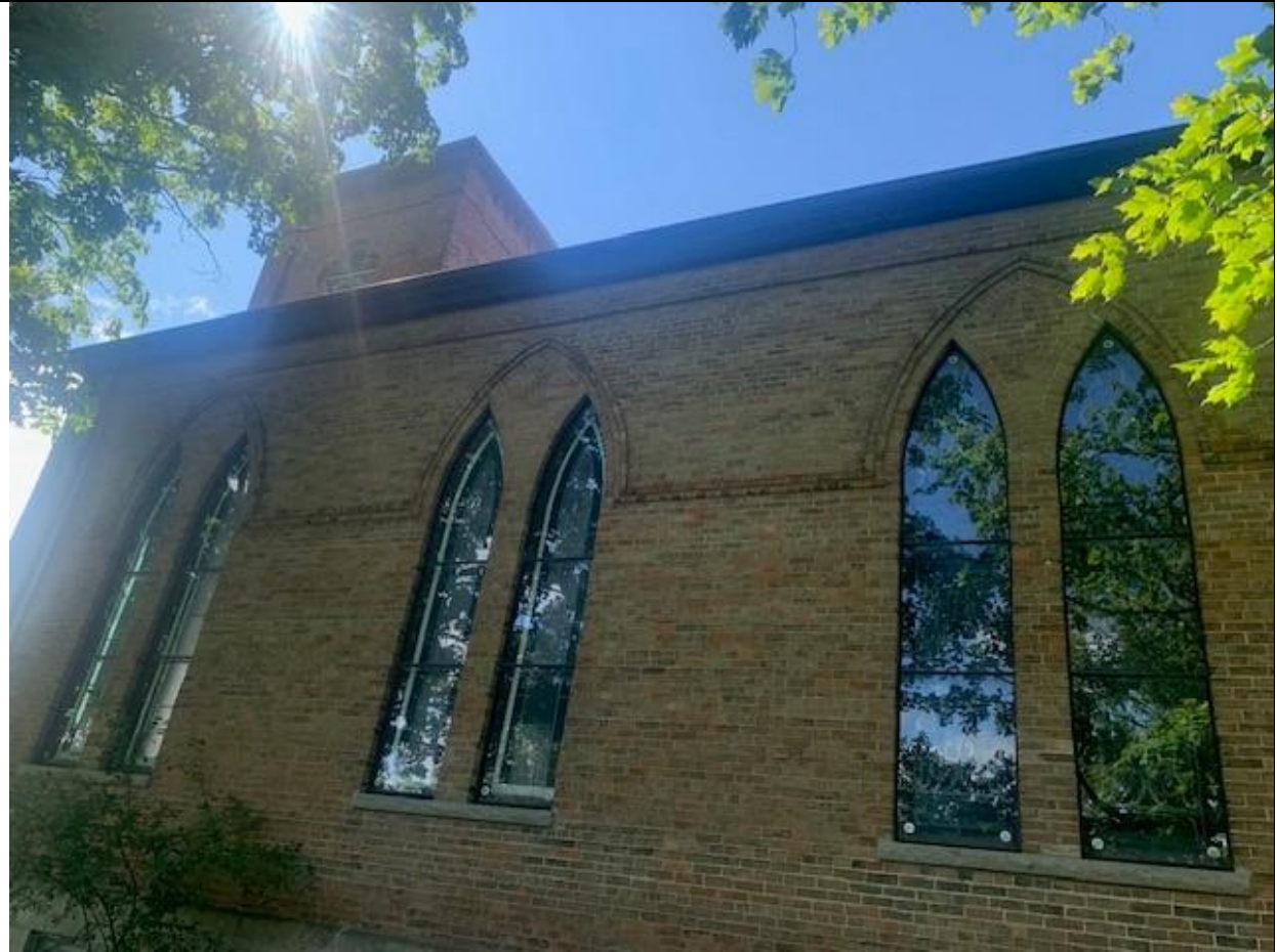
Side Elevation (North Façade)