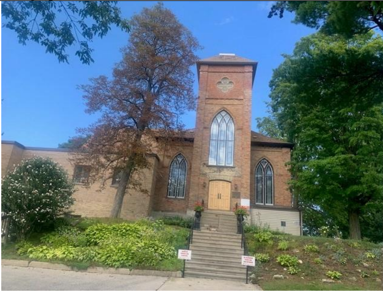
Front Elevation (East Façade)