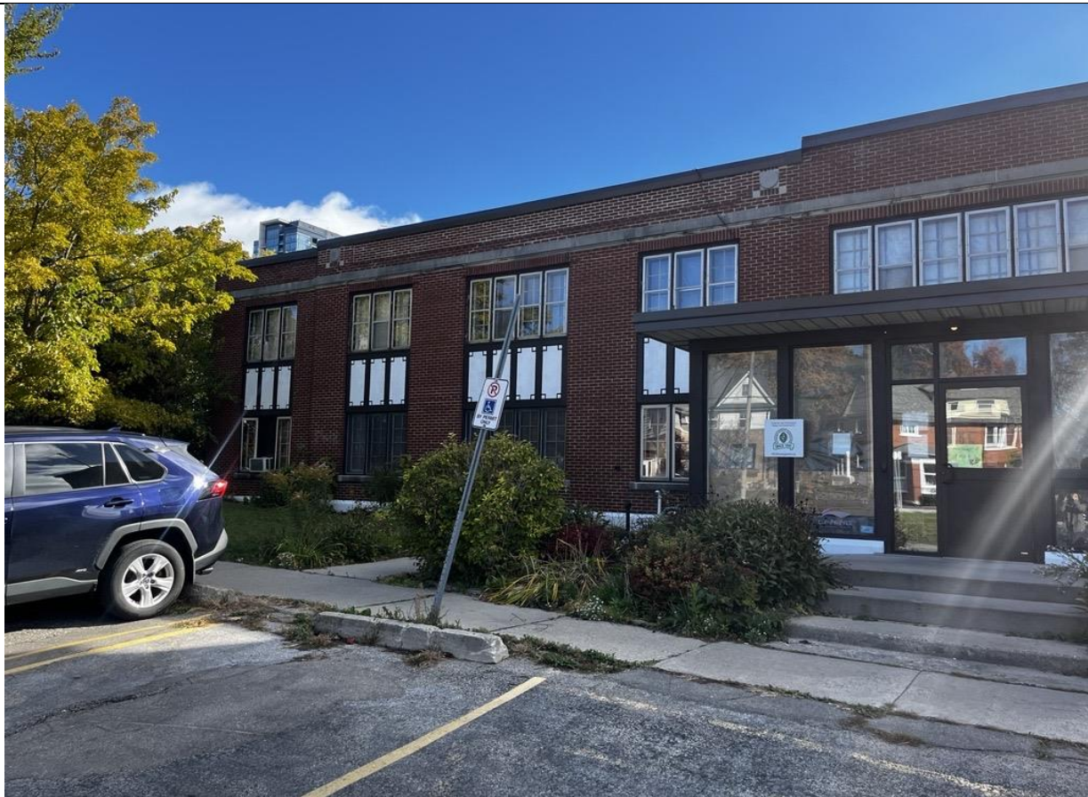
Northern End Section (Front Façade)