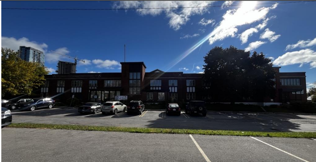
Front Façade of Subject Building