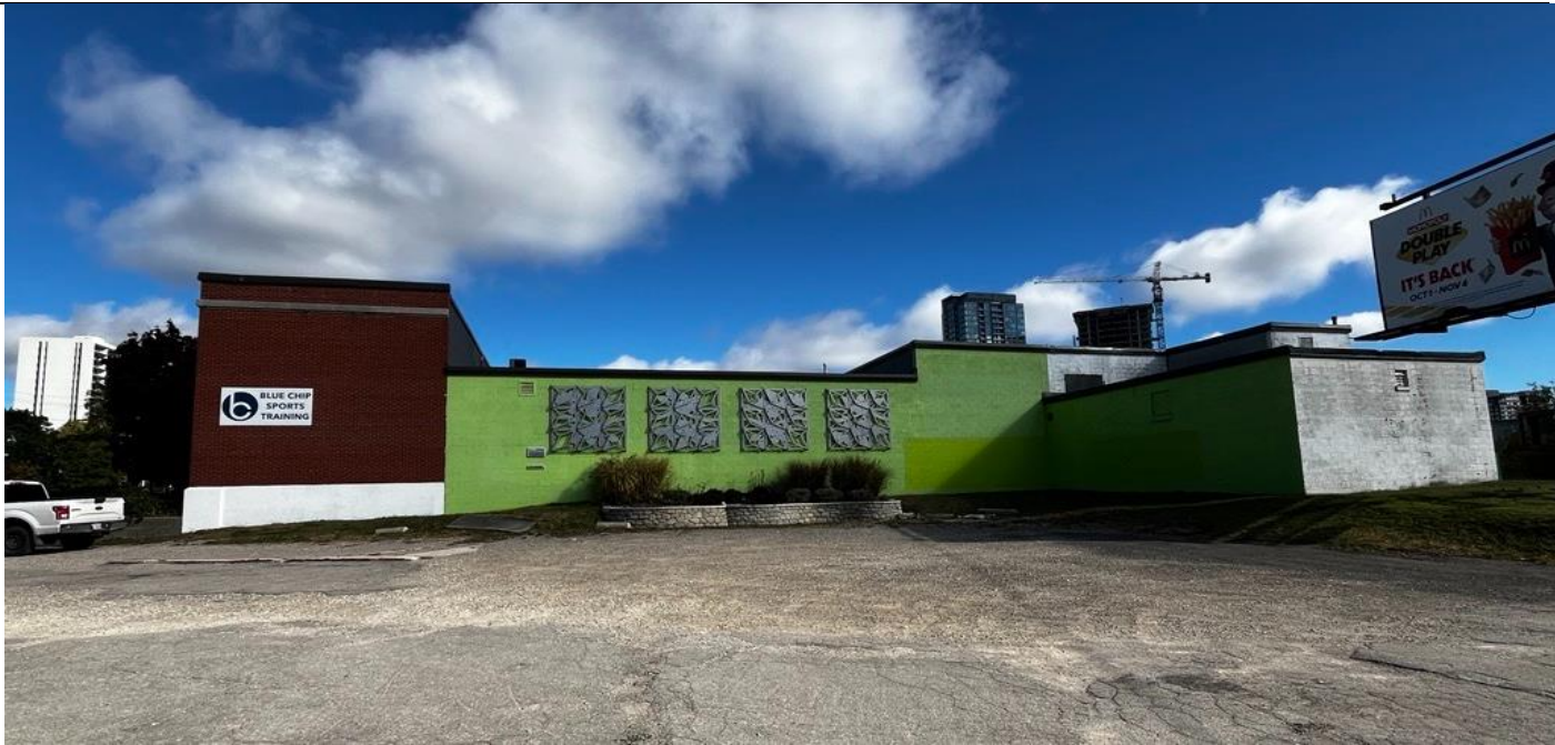
South-Side Façade (1927 Portion and new addition)