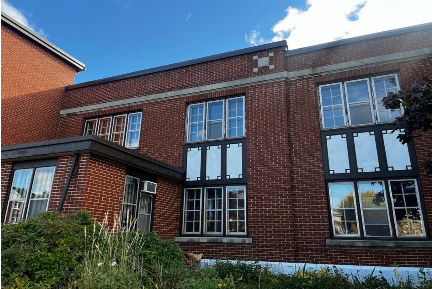
Close-up of Architectural Detailing on Central Section Including Concrete Motifs and Decorative Panels