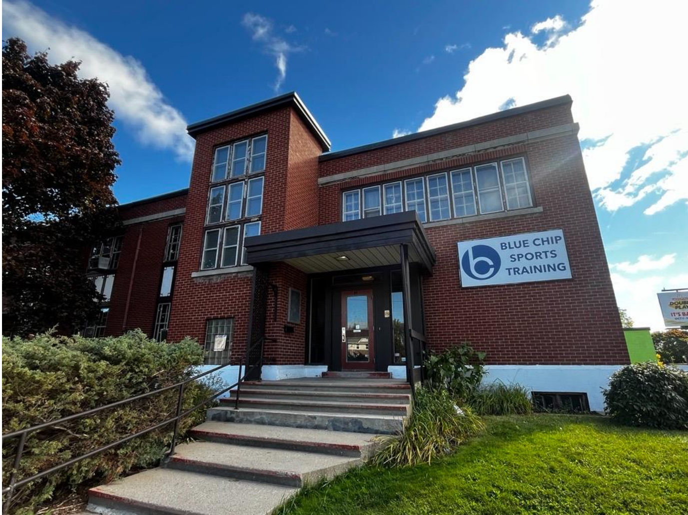
Second Tower and Southern End Section (Front Façade)