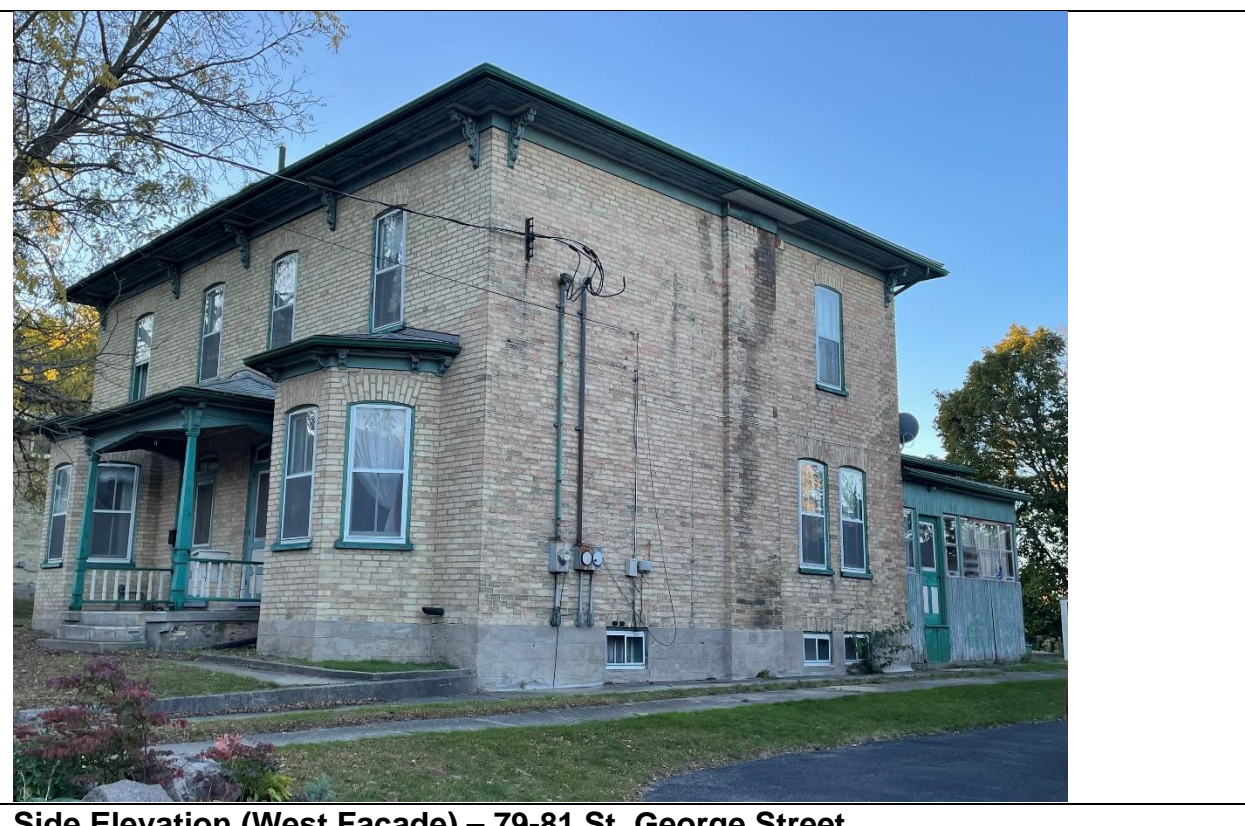
Side Elevation (West Façade) – 79-81 St. George Street

Side Elevation (East Façade) – 79-81 St. George Street