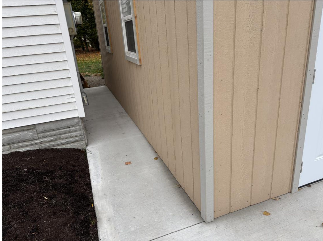
Figure 4: Existing setback of the shed into the front yard.