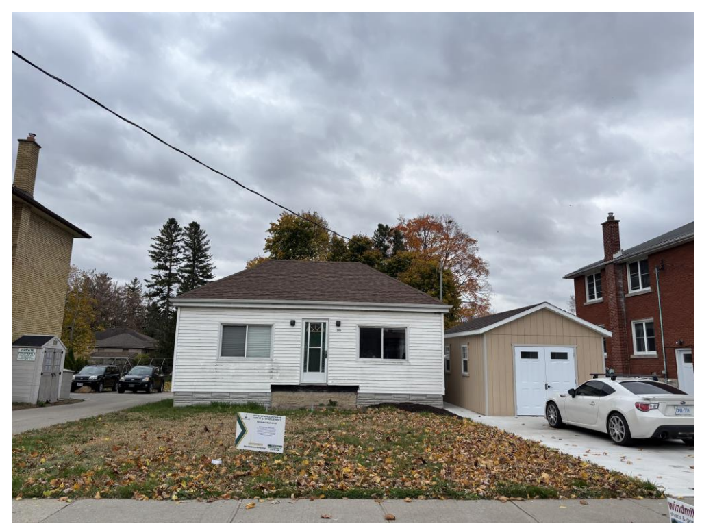
Figure 3 – View of 593 Ephraim Street from the street.

Planning Staff conducted a site visit on October 31, 2024.