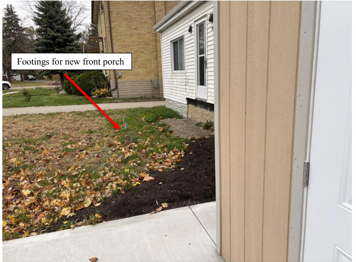
Figure 6: Photo showing the alignment of the shed to the footings of the proposed front porch.