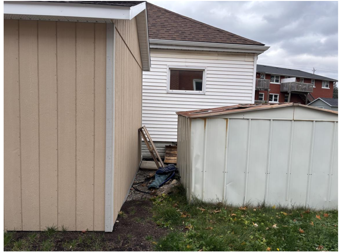
Figure 5: Existing rear setback (approximately 0.9 metres) of the new shed to the pre-existing smaller shed