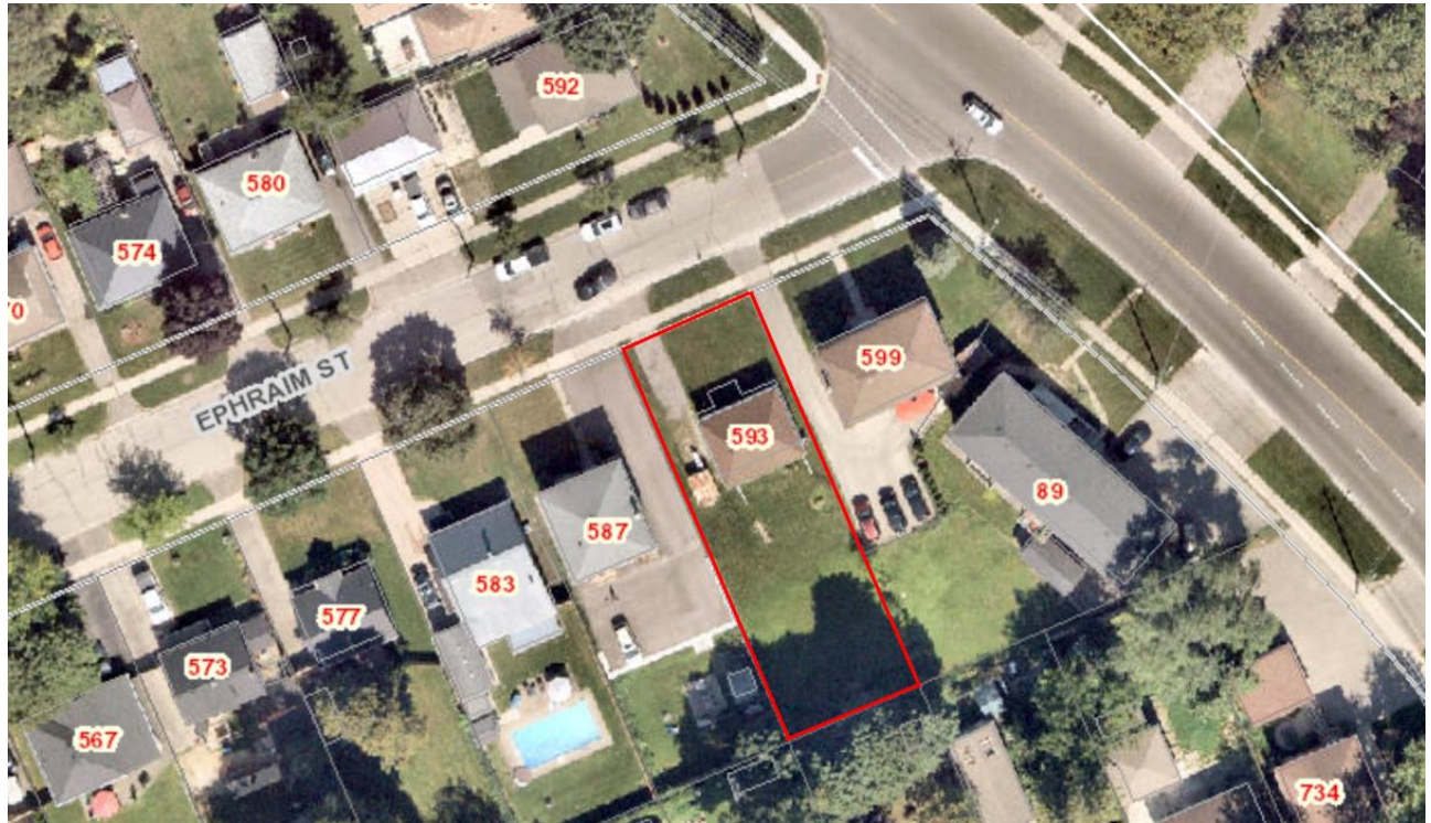
Figure 1 – Location of subject property (outlined in RED)

The subject property is identified as 'Community Areas' on Map 2 – Urban Structure and is designated 'Low Rise Residential' on Map 3 – Land Use in the City's 2014 Official Plan.