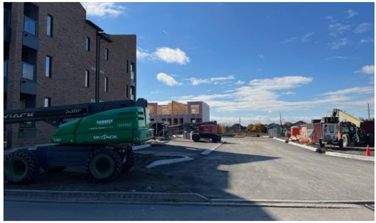
Figure 6: Reverie Way – 630 Benninger Drive

The purpose of this report is to review a consent application to create an access easement over a parcel of land in a Vacant Land of Condominium to permit access to adjacent vacant land of condominium units/parcels.