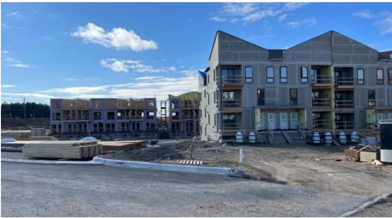
Figure 5: Future townhouses under construction – 630 Benninger Drive