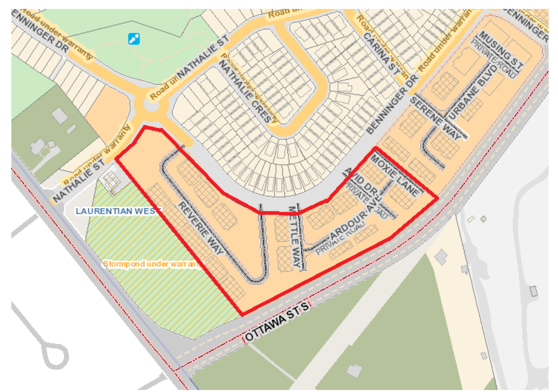
Figure 1: Location Map – 630 Benninger Drive