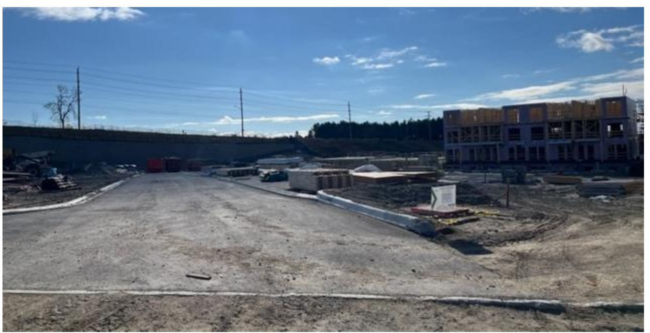
Figure 4: Reverie Way – 630 Benninger Drive