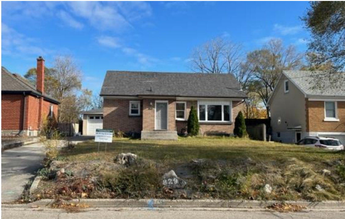
Figure 2: Existing building – 829 Stirling Avenue South

The subject property is identified as 'Community Areas' on Map 2 – Urban Structure and is designated 'Low Rise Residential' on Map 3 – Land Use in the City's 2014 Official Plan.