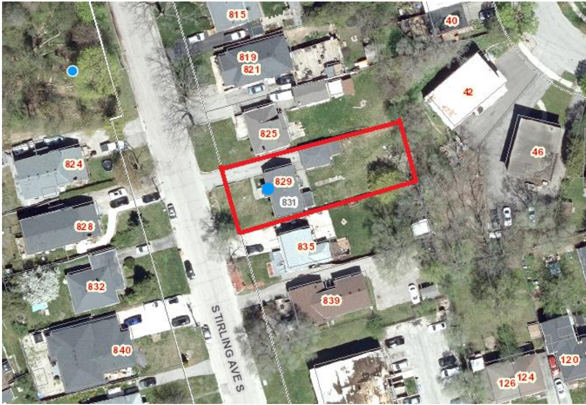
Figure 1: Location Map – 829 Stirling Avenue South