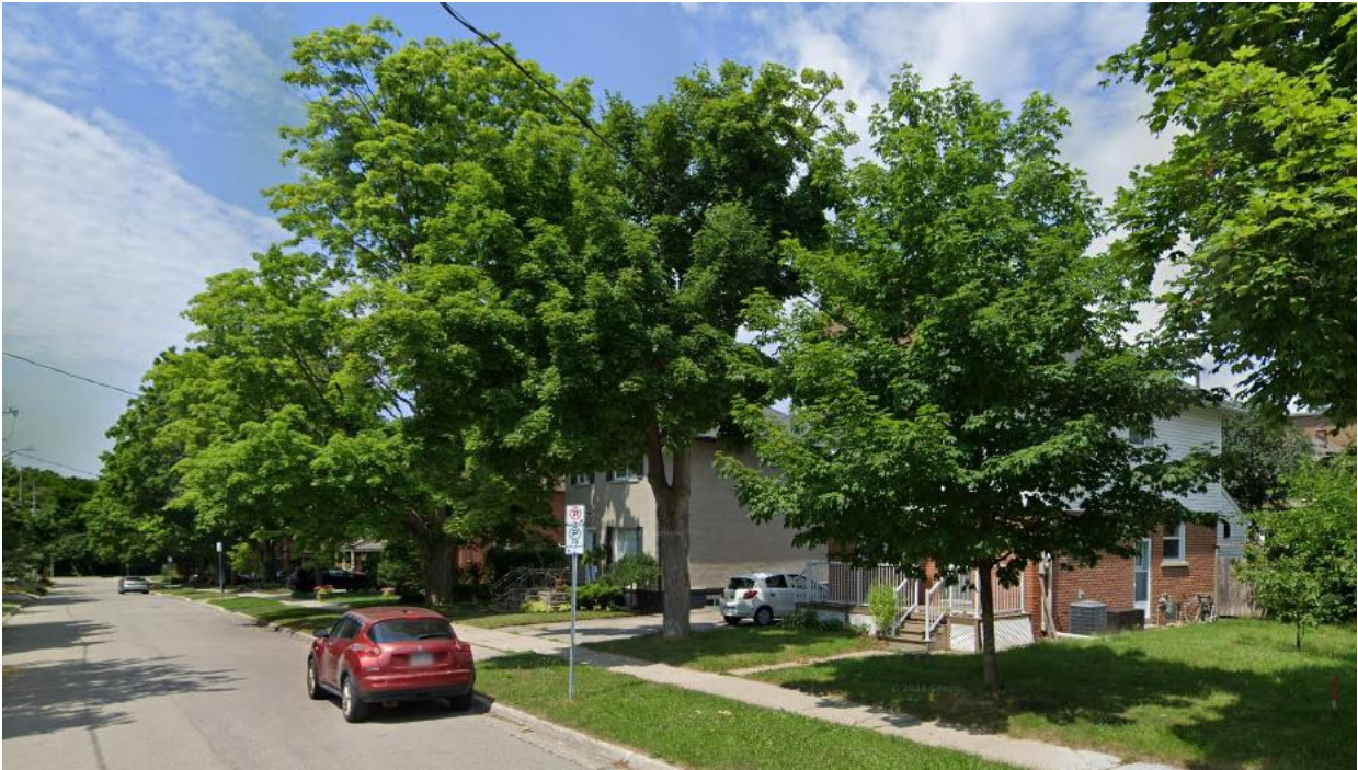
Figure 6: Existing House and Wood Street Streetscape