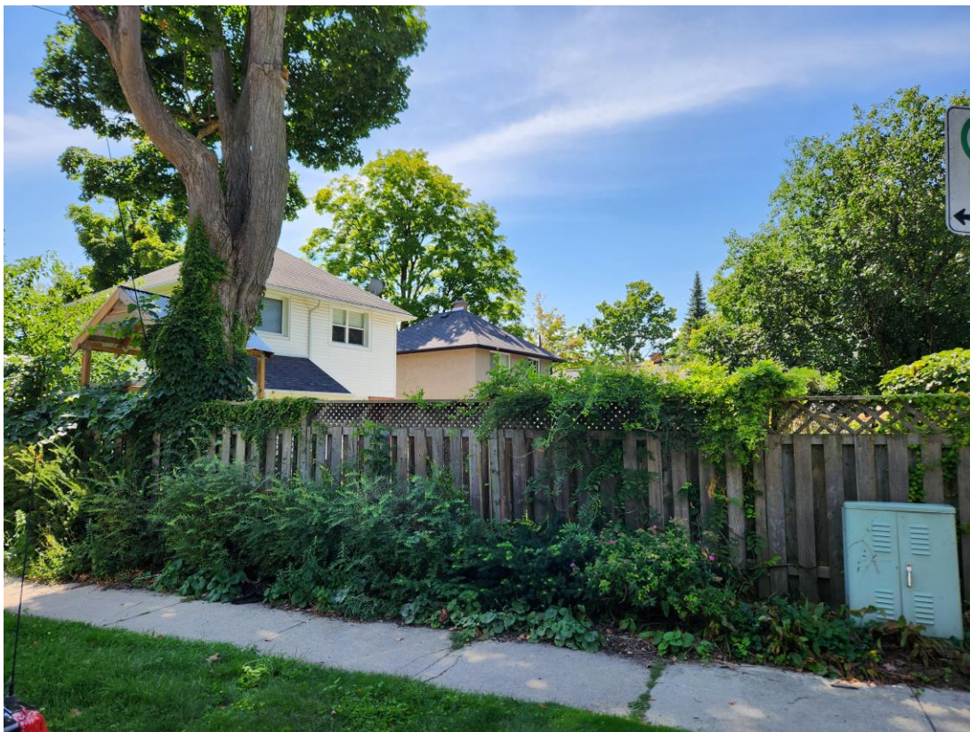
Figure 8: Proposed Driveway Location between City tree and Utility Box