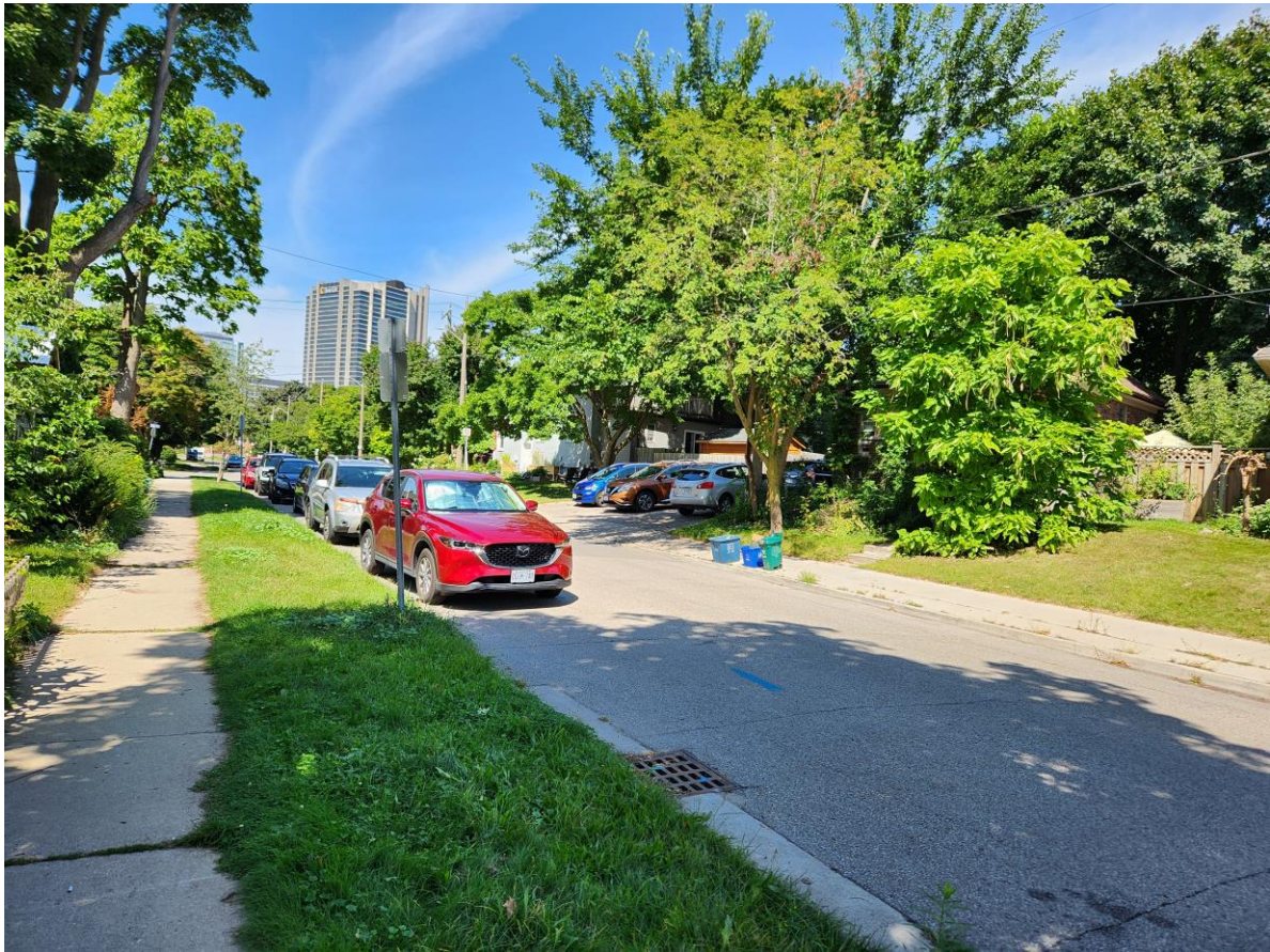
Figure 7: York Street Facing North Directly Beside Subject Property