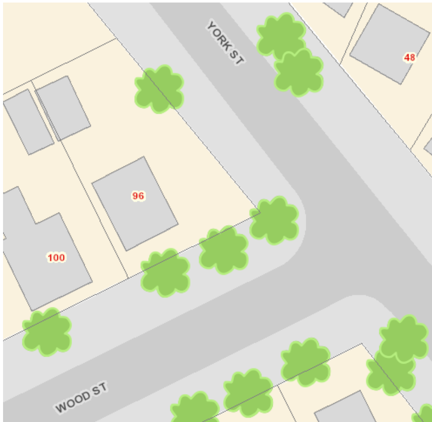
Figure 9: Location of City Trees