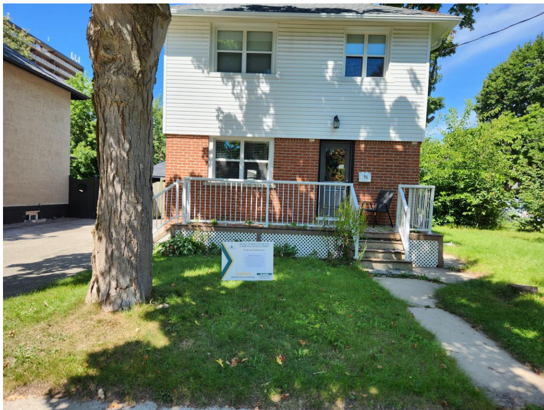
Figure 4: Front of Existing House (Wood Street Façade)