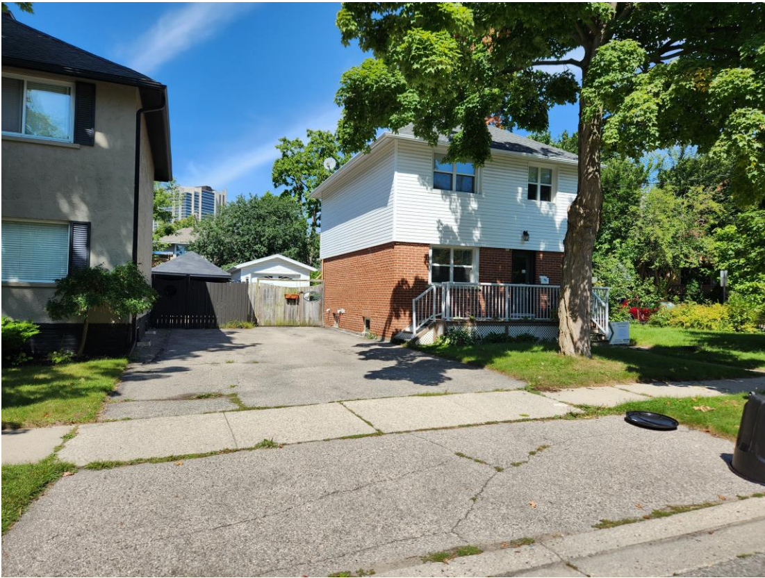
Figure 5: Existing Driveway and Detached Garage