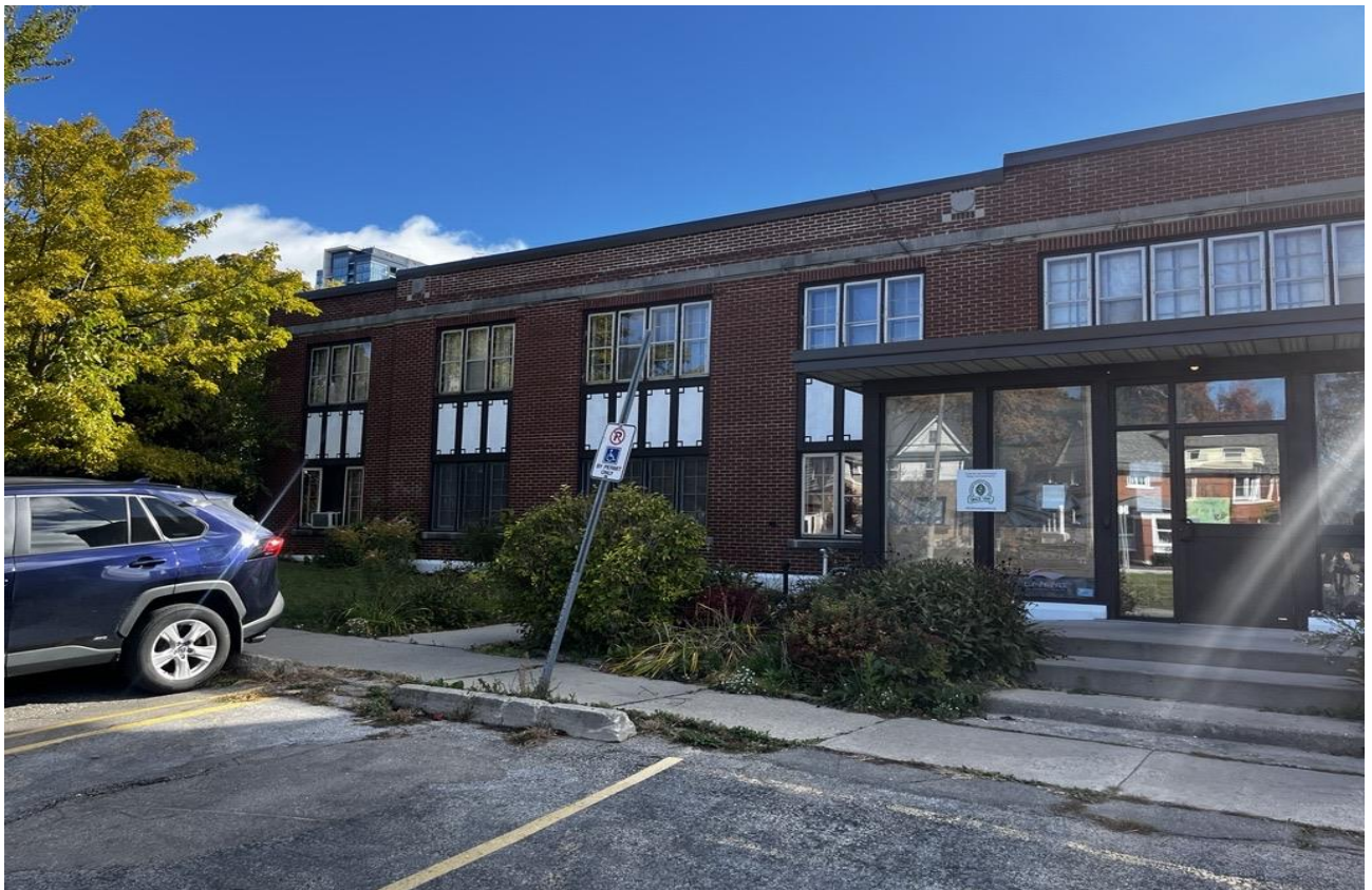
Figure 3: Close-up of Northern Section of Front Façade