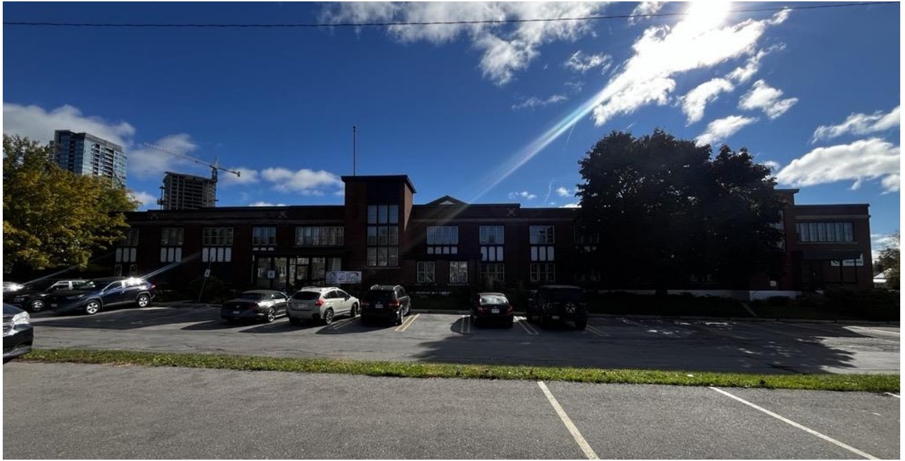
Figure 2: Front Façade of Subject Property