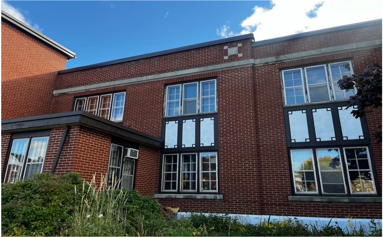
Figure 4: Close up of Central Section of Front Façade