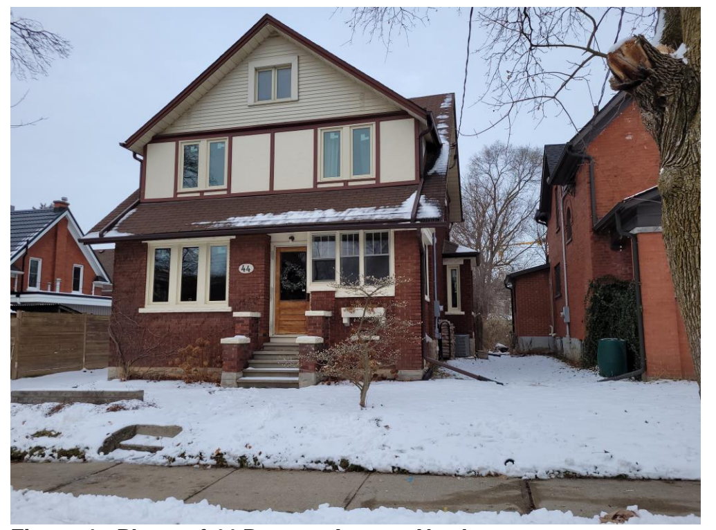
Figure 4 - Photo of 44 Betzner Avenue North