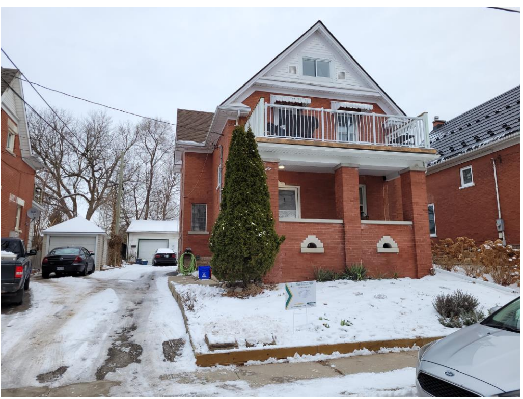
Figure 2 - Photo of 284 Duke Street East