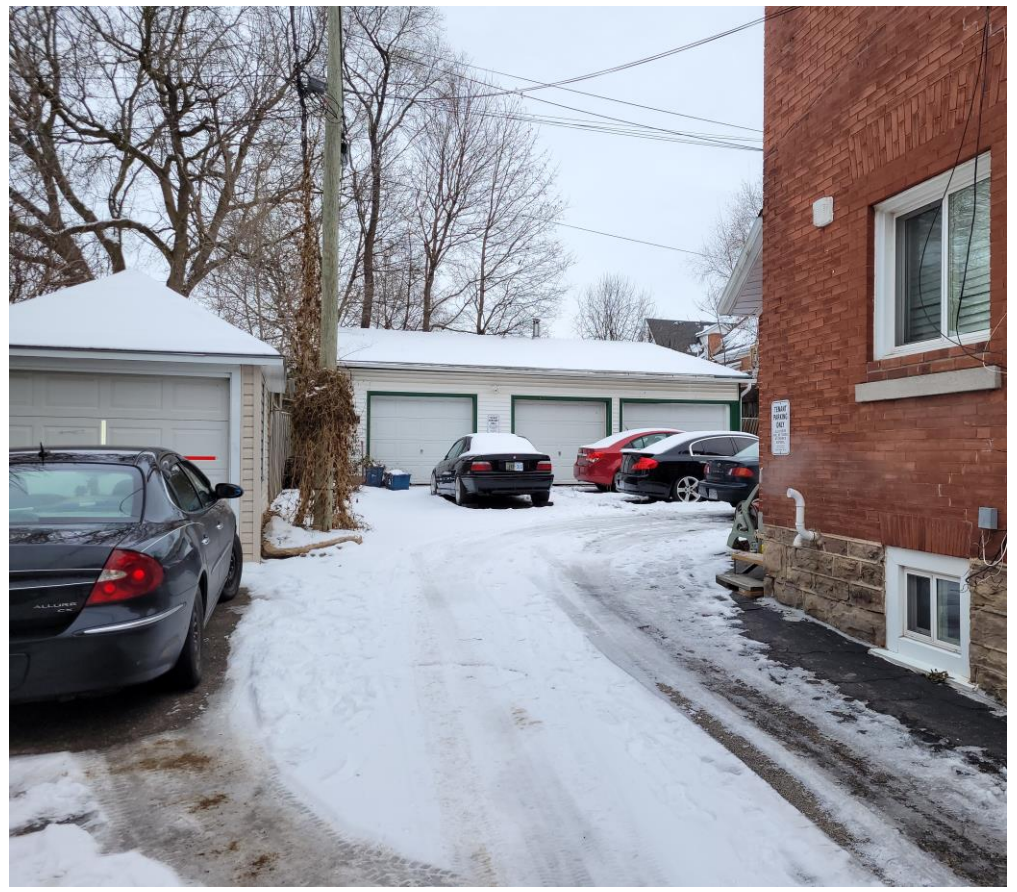
Figure 3 - Metal-clad garage at rear of property