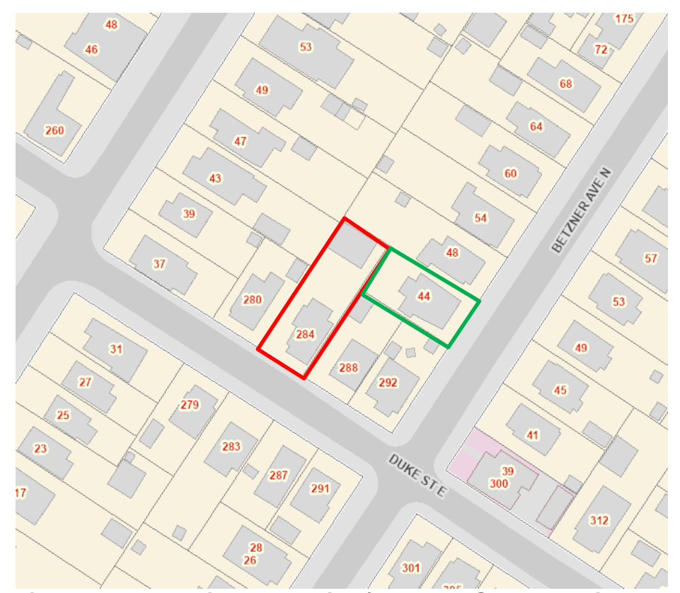
Figure 1 - The subject properties (284 Duke Street East in red, 44 Betzner Avenue North in green) and surrounding property boundaries.