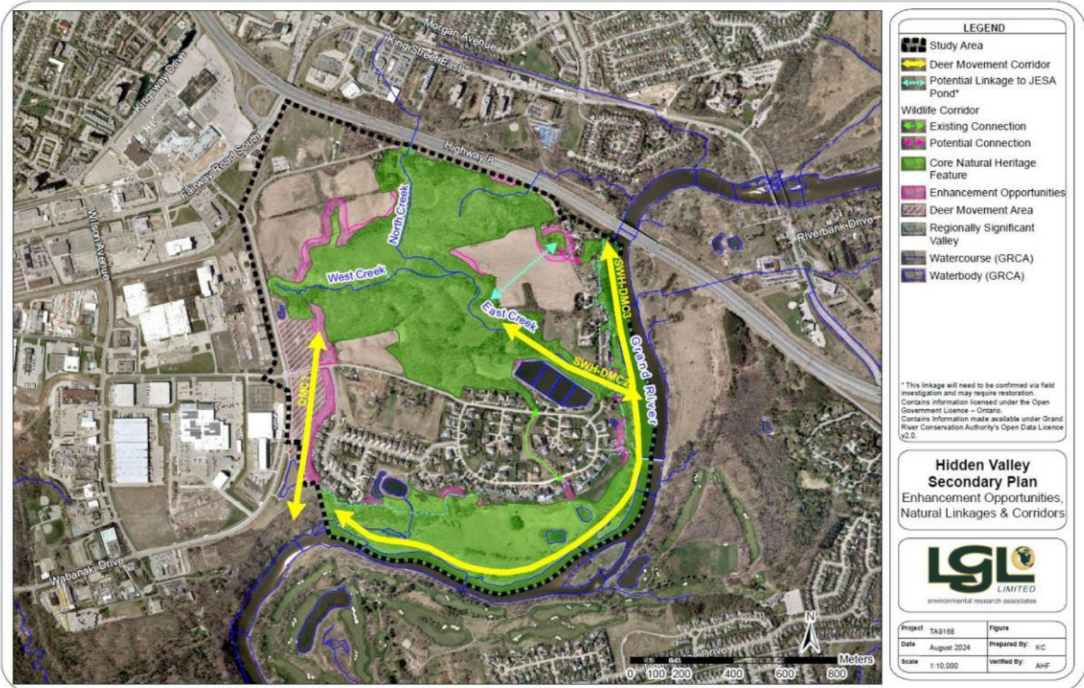
Figure 13: KNHS Component Map: Linkages and Enhancement Areas