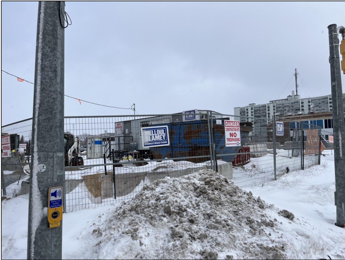
Figure 2 – Location Map: View of Site from King Street West (January 29, 2025)