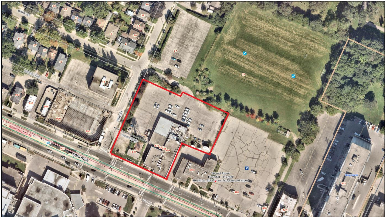
Figure 1 – Location Map: 864 King Street West

The 'Growing Together' Zoning By-law Amendment to Zoning By-law 2019-051 is currently under appeal. As a result, zoning the subject lands are currently "dual testing" in which both Zoning By-law 85-1 and Zoning By-law 2019-051 are in effect. The property is zoned 'High Intensity Mixed Use Corridor Zone (MU-3)' in Zoning By-law 85-1, and "High Rise Growth Zone (SGA-4)" in Zoning By-law 2019-051.