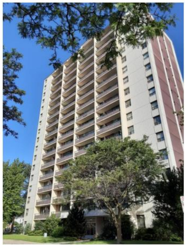
Figure 3: View of property from street.

Currently, there are no visitor parking spaces on site as this was not a requirement when the building was constructed in 1968. By providing eight visitor spaces on the surface outside the property will ensure demarcated and dedicated parking spaces for visitors. Staff note that the property is one block from the Strategic Growth Area which has no minimum parking requirement. The property is on a bus route and just outside the 800 metres to an LRT station. Transportation Planning staff support the proposed parking variance.