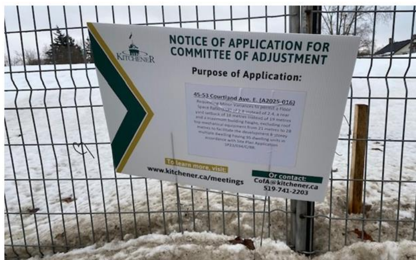
Figure 2 – Photo of the Subject Property

Staff conducted a site visit on February 28, 2025.