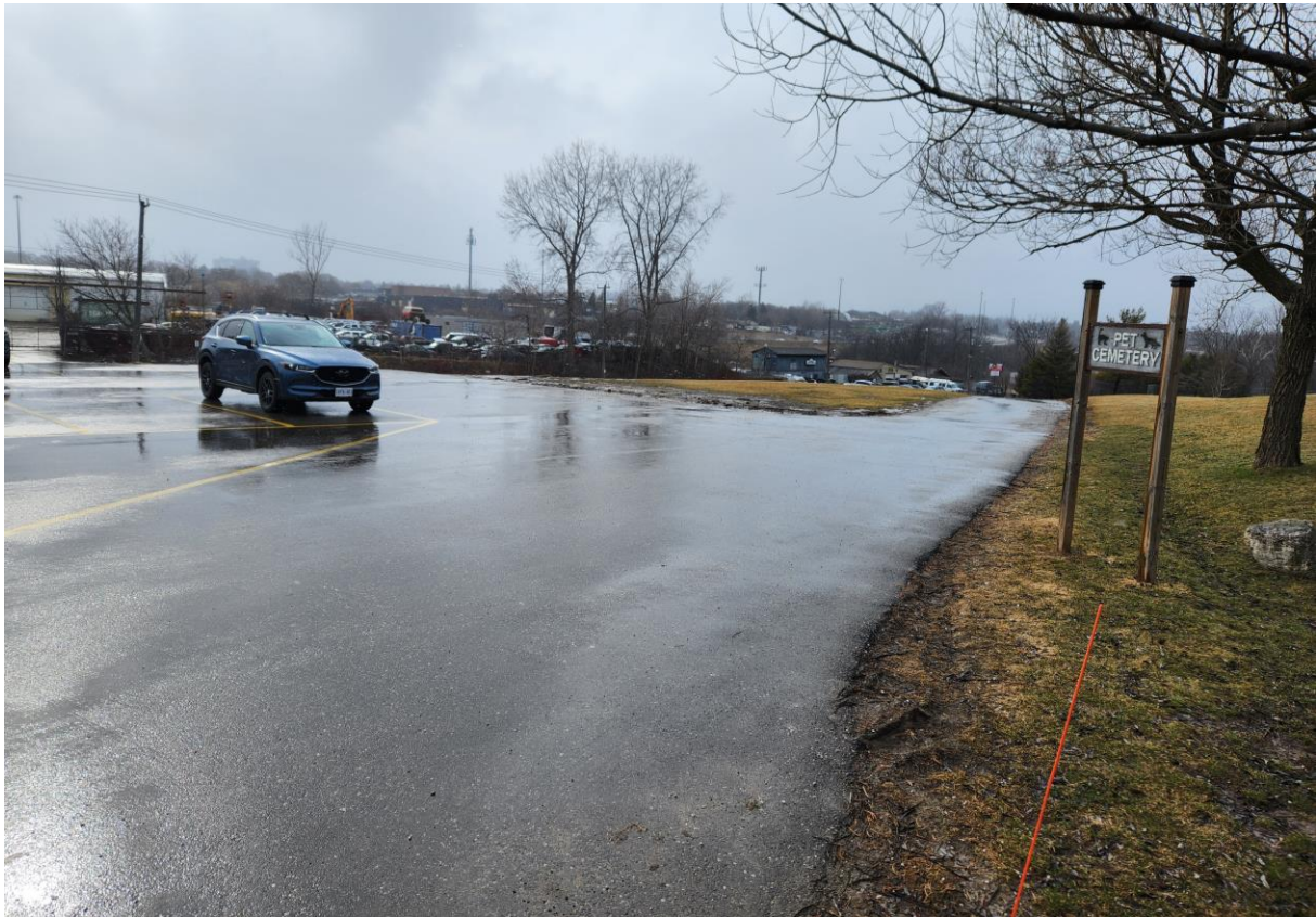
Figure 3: Proposed New Building Location