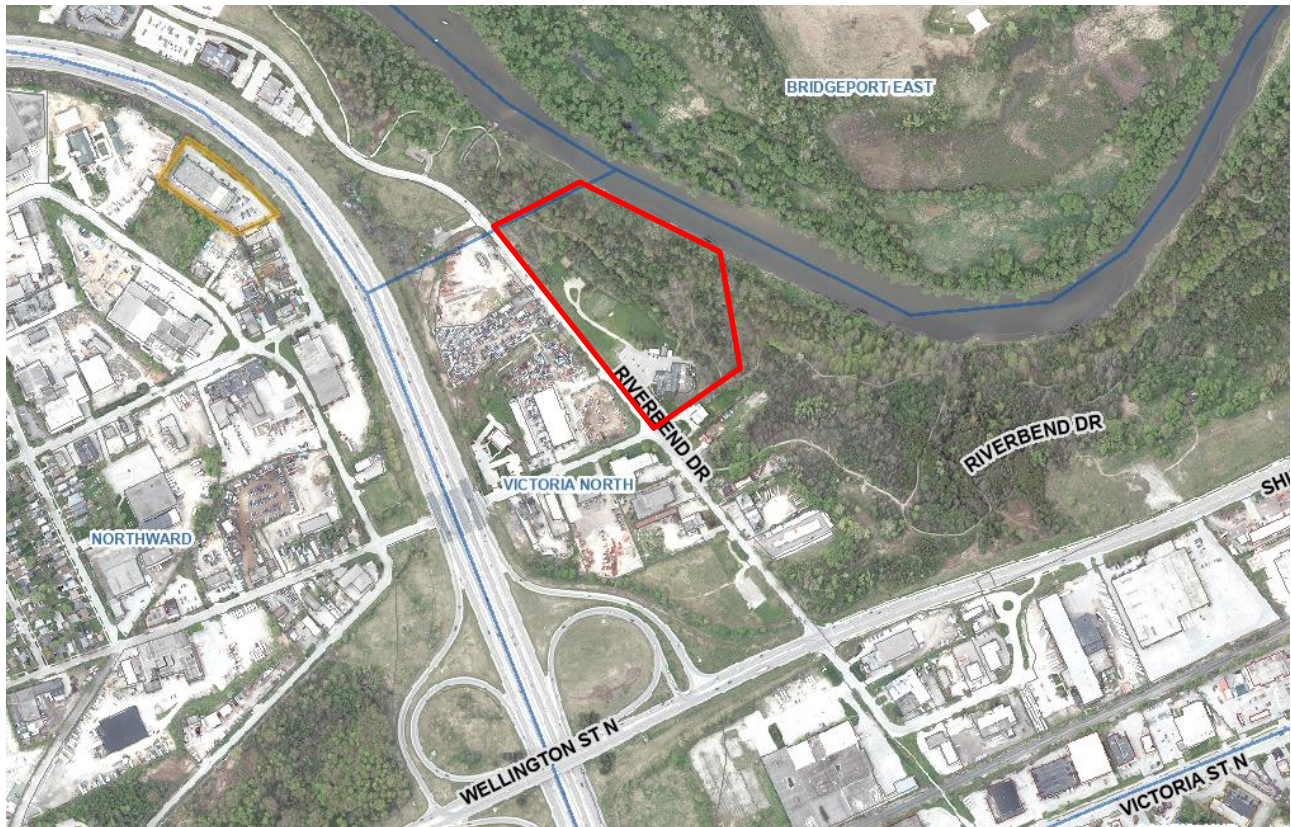
Figure 1: Location Map (250 Riverbend Drive shown in Red)

The subject property is identified as 'Industrial Employment Areas' and 'Green Areas' on Map 2 – Urban Structure and is designated 'Business Park Employment' and 'Natural Heritage Conservation' on Map 3 – Land Use in the City's 2014 Official Plan.