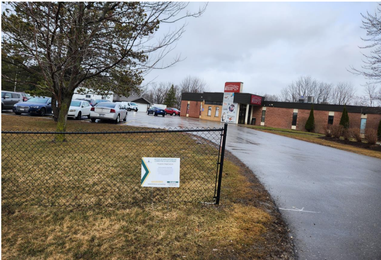
Figure 4: Existing Building