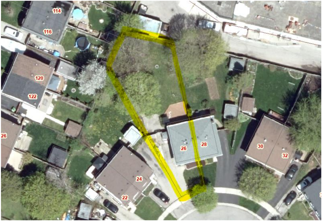
Figure 1 – Aerial Photo of the Subject Property

The subject property is identified as 'Community Areas' on Map 2 – Urban Structure and is designated 'Low Rise Residential' on Map 3 – Land Use in the City's 2014 Official Plan.