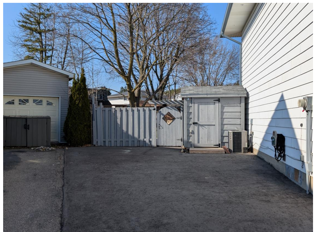
Figure 4 – Existing side yard/driveway where the drive aisle and walkway are proposed, existing fence shown in the photo will be removed.