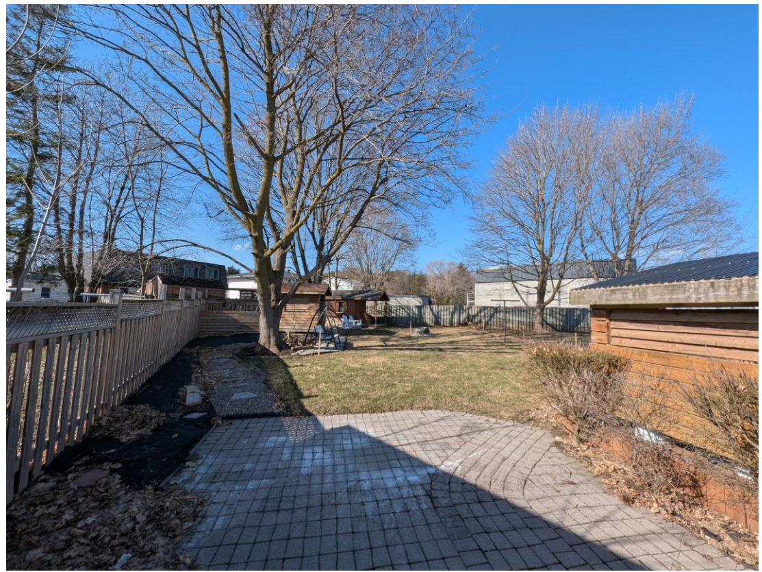
Figure 5 – Existing rear yard where the Additional Dwelling (Detached) is proposed, existing sheds and trees in the centre of the photo will be removed.