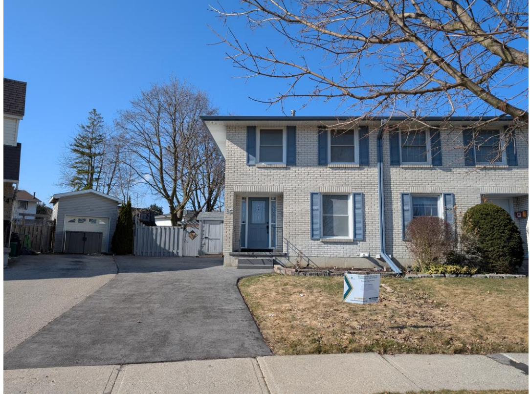
Figure 3 – Site Photo of 26 Berwick Place

Planning Staff conducted a site visit on March 27, 2025.